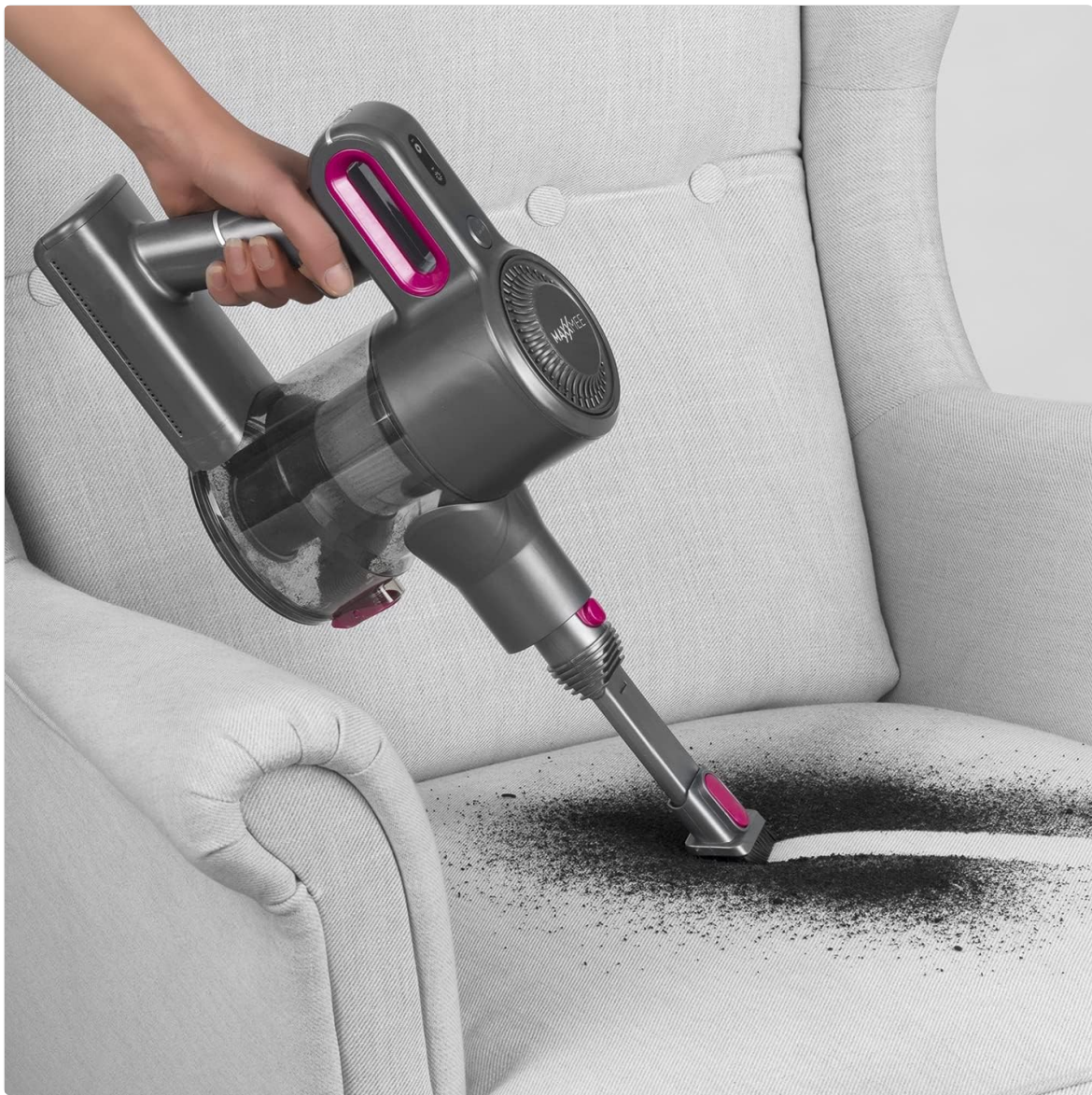
Image 4.3: The MAXXMEE 02026 used in handheld mode to clean an armchair.