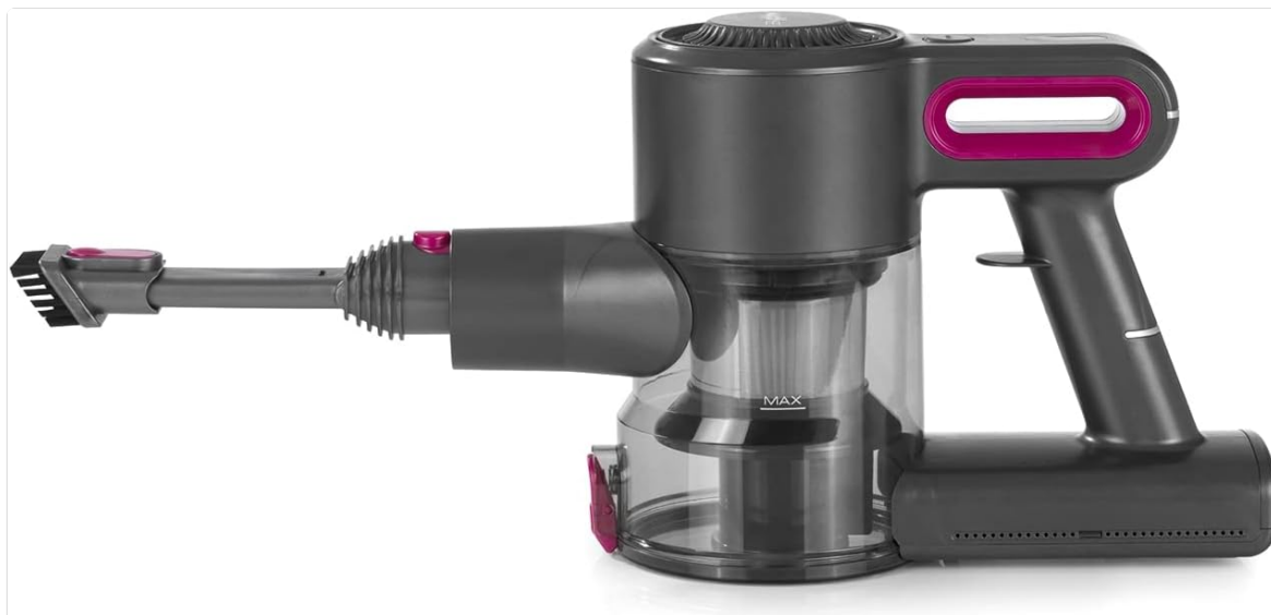
Image 3.2: The main vacuum unit configured with the brush tool for handheld cleaning.