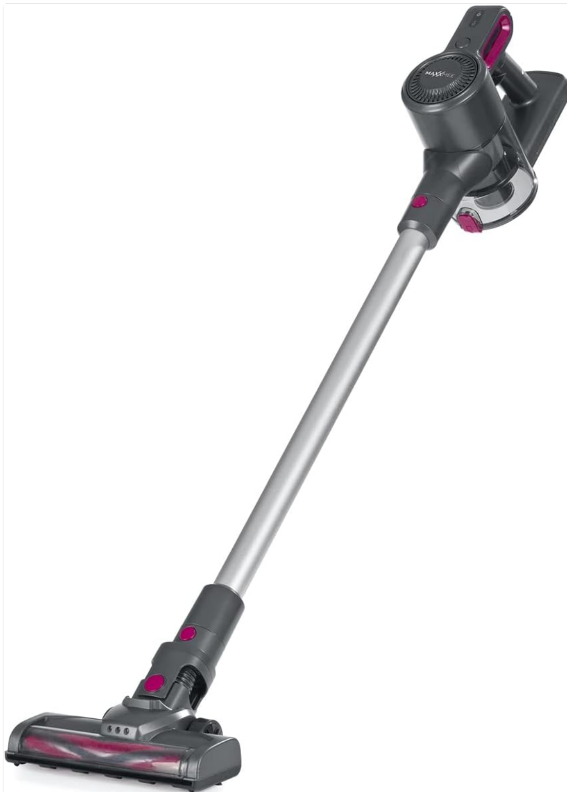
Image 1.1: The MAXXMEE 02026 Cordless Handheld Vacuum Cleaner in its full stick configuration.