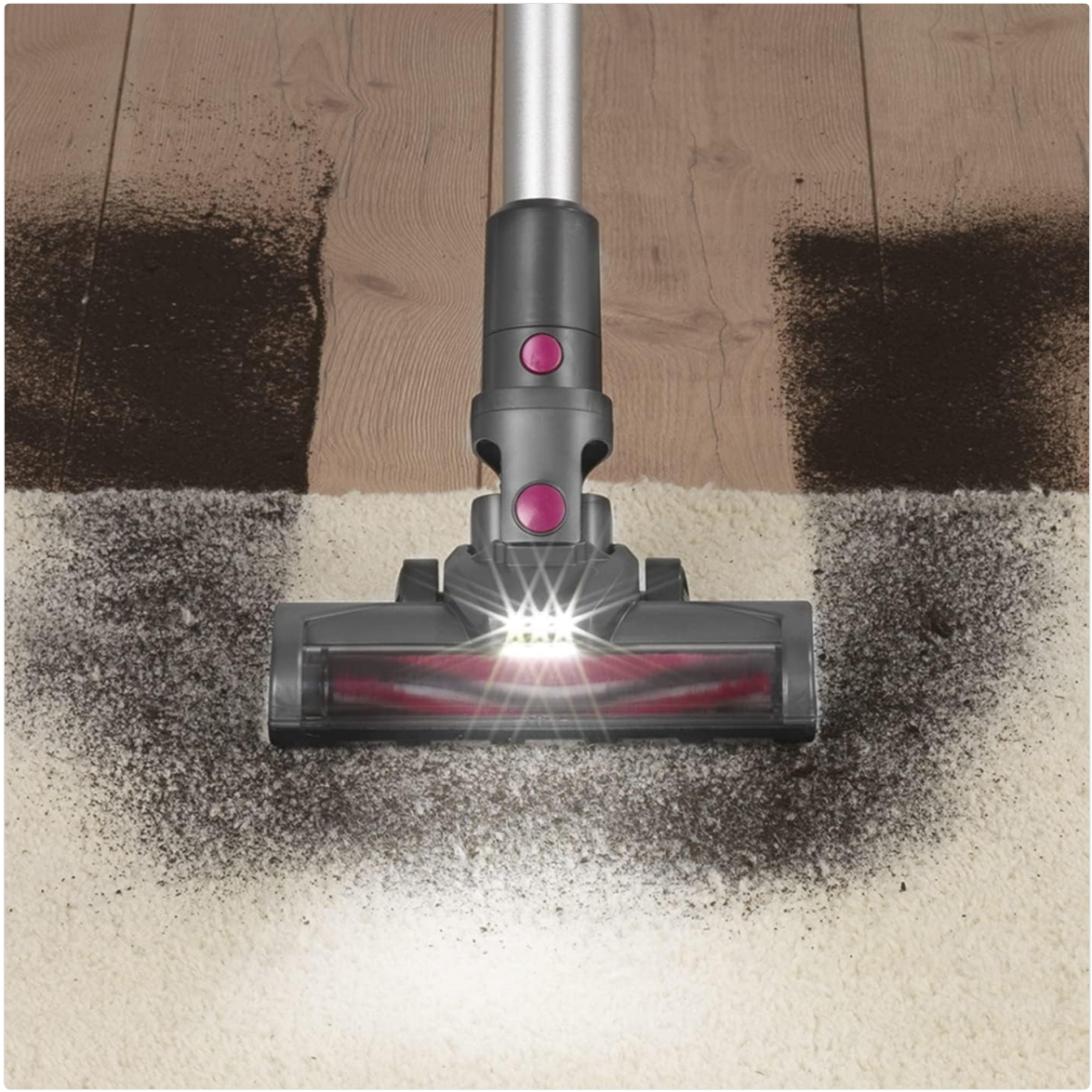
Image 4.2: The motorized floor brush with integrated LED lights illuminating dirt on a carpet surface.