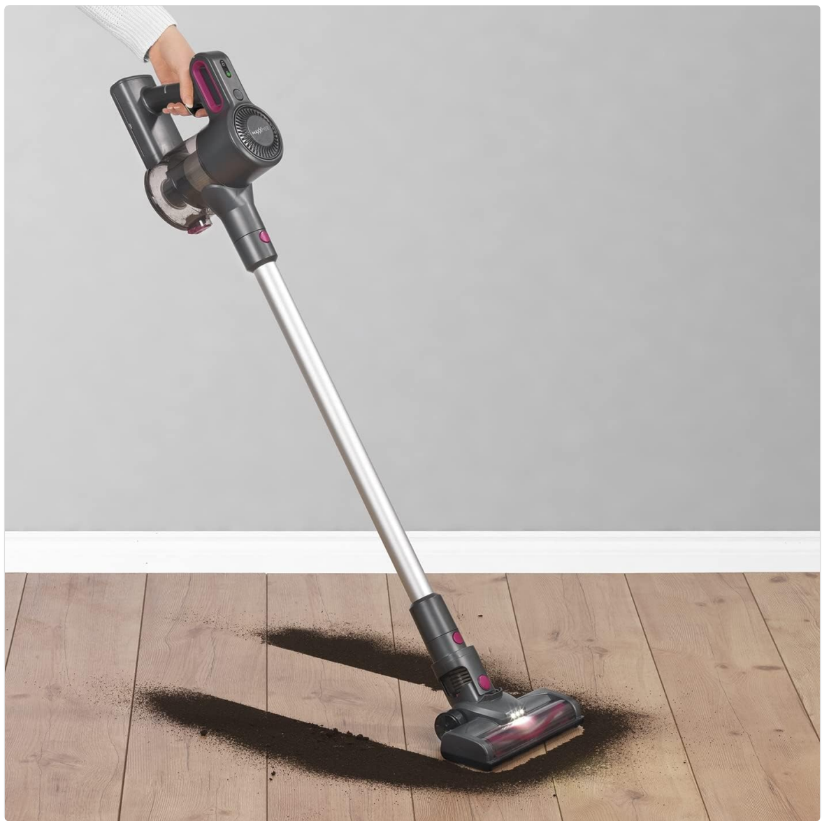
Image 4.1: Demonstrating the MAXXMEE 02026 in stick vacuum mode cleaning a wooden floor.