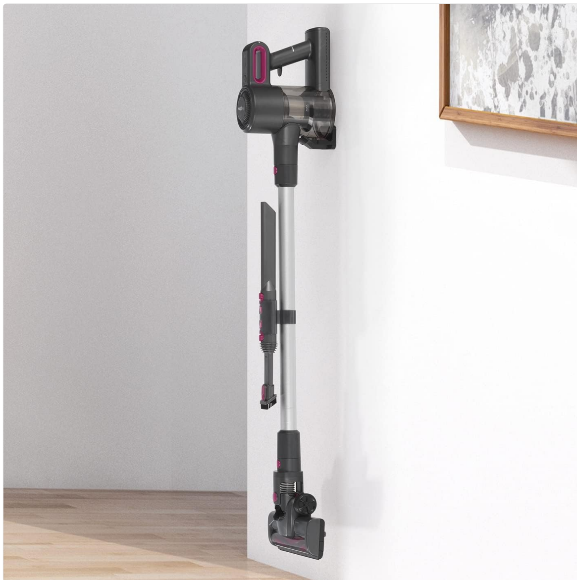
Image 3.3: The MAXXMEE 02026 vacuum cleaner stored on its wall mount bracket.