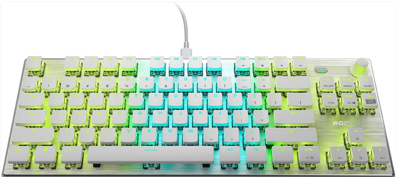
Image: Front view of the ROCCAT Vulcan TKL Pro keyboard, showcasing its white keys and vibrant RGB illumination.

The ROCCAT Vulcan TKL Pro is a high-performance tenkeyless gaming keyboard designed for precision and speed. It features ROCCAT's linear Titan Switch Optical, AIMO RGB lighting, and a low-profile ergonomic design for enhanced comfort during extended use. Its compact form factor provides more desk space for mouse movement, which is beneficial for gaming.