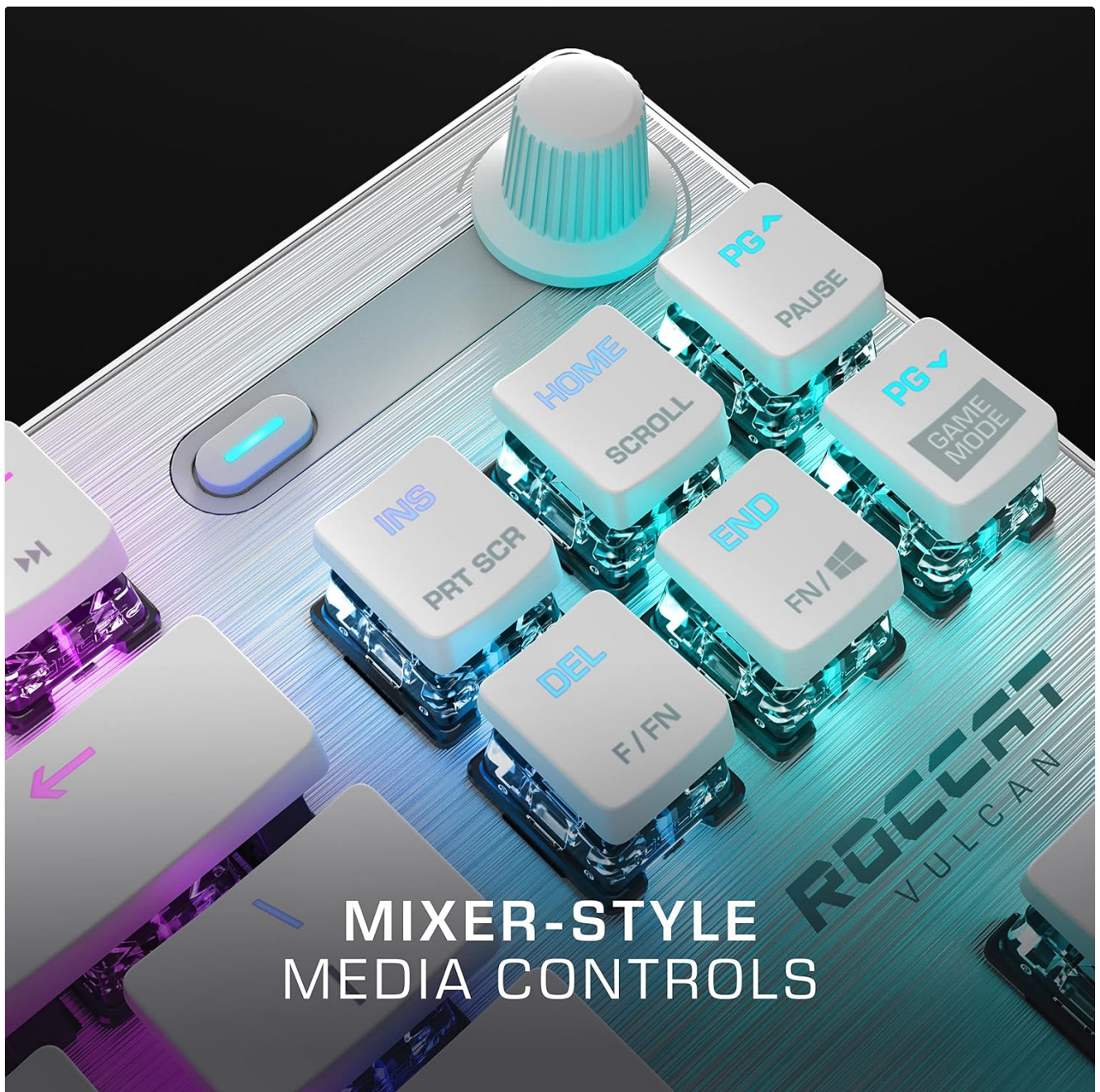
Image: Detailed view of the mixer-style media controls, including the volume dial and mute button.