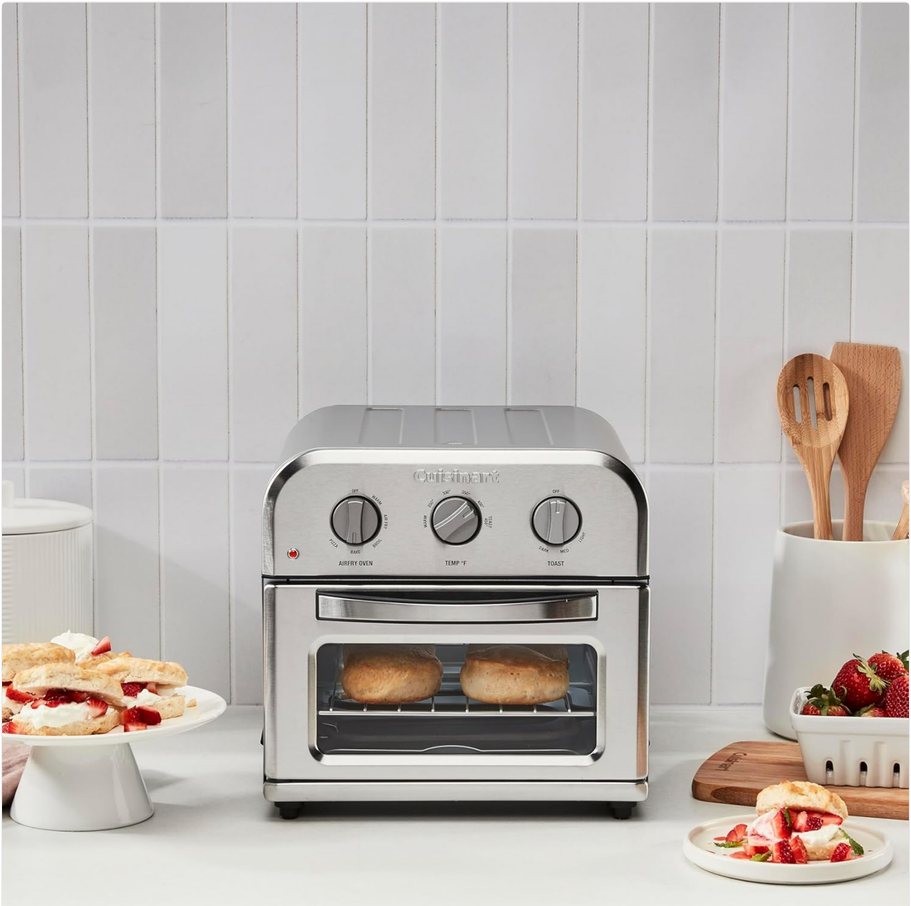
Image: A detailed view of the control panel, showing the Function, Temperature, and Toast Shade dials.

The Cuisinart Compact Air Fryer Toaster Oven features three control dials for easy operation: Function, Temperature, and Toast Shade.