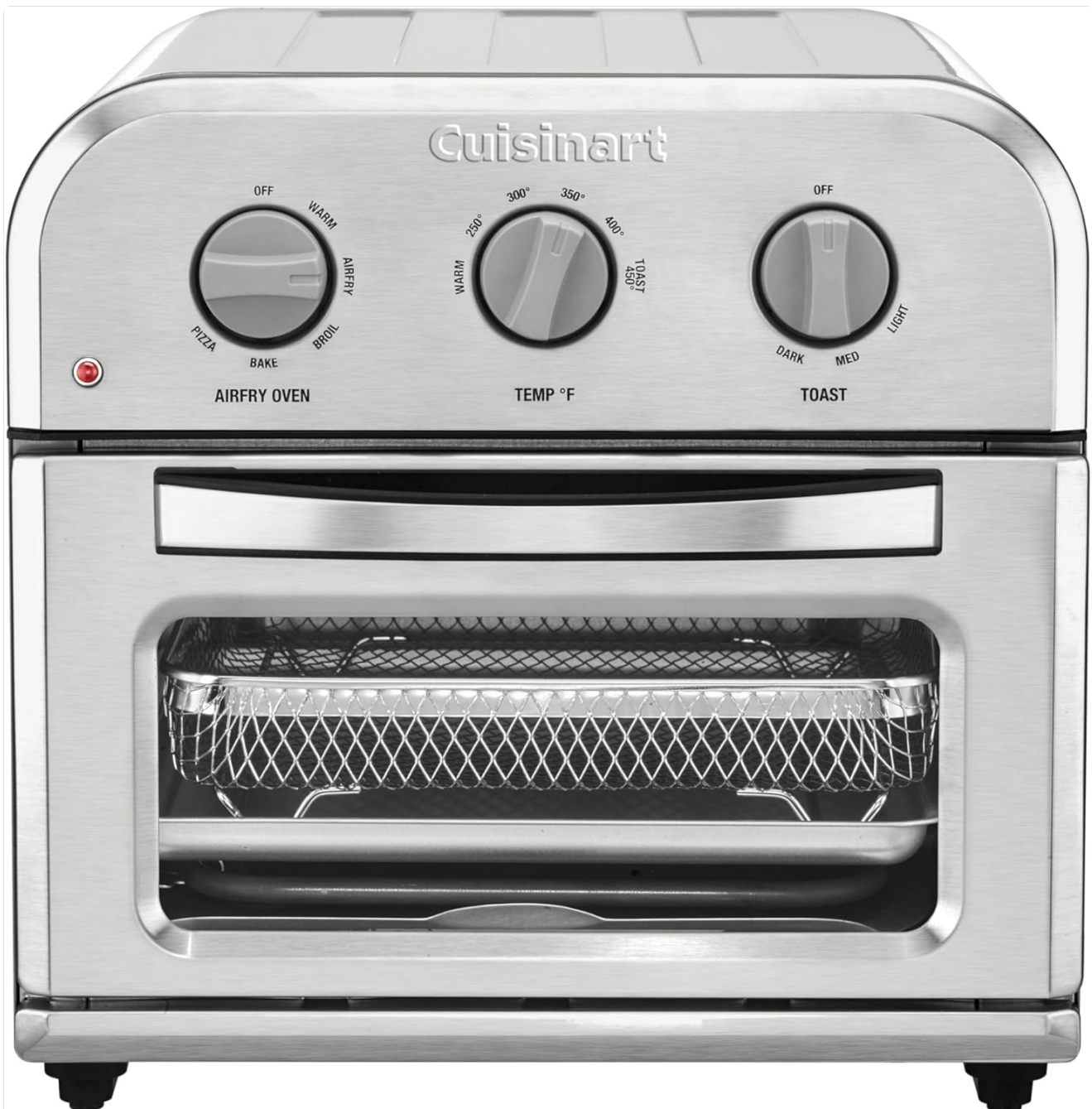
Image: Front view of the Cuisinart Compact Air Fryer Toaster Oven, showcasing its control dials and viewing window.