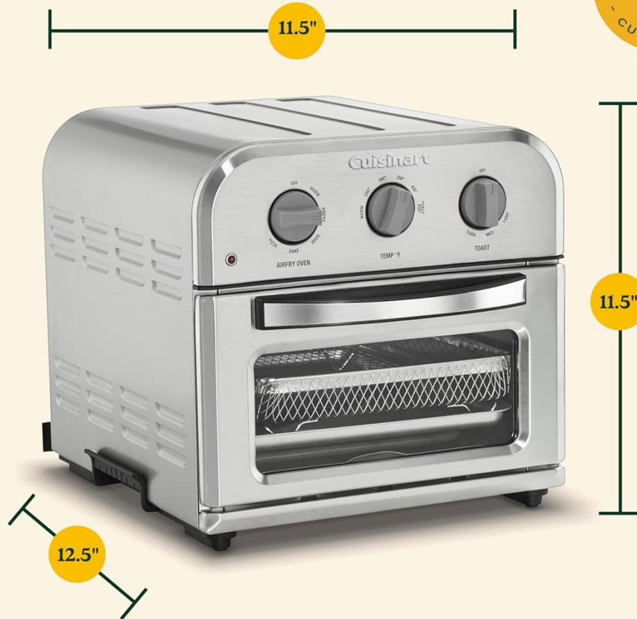
Image: Diagram illustrating the compact dimensions of the Cuisinart Air Fryer Toaster Oven.