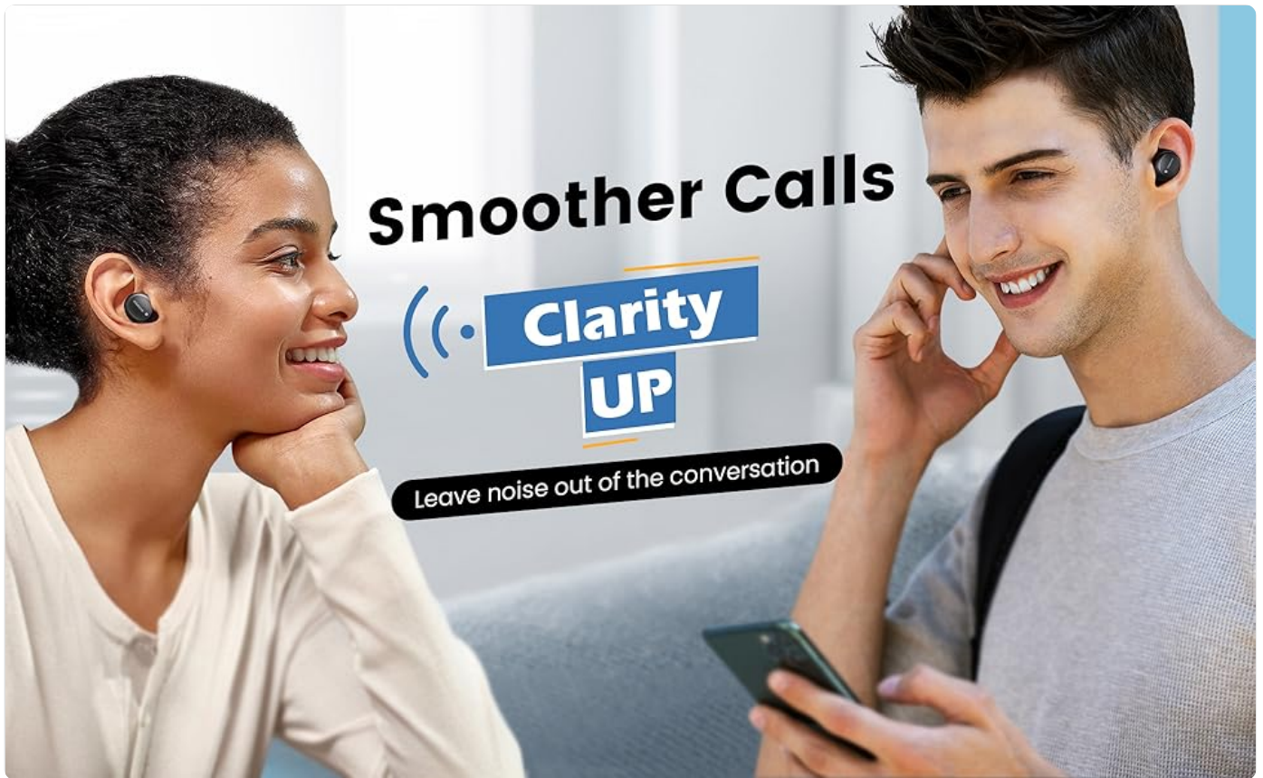
Image: Two people conversing while wearing MIATONE Austin earbuds, emphasizing "Smoother Calls" and "Clarity UP" with CVC8.0 technology.

The earbuds also feature a great noise-isolating seal to block out annoying background noise, further enhancing your listening and call experience.