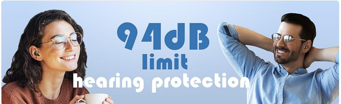
Image: Two individuals wearing MIATONE Austin earbuds, with text highlighting the 94dB hearing protection limit.

The MIATONE Austin earbuds are designed with a 94dB hearing protection limit to safeguard your hearing during extended listening periods. This feature helps prevent potential damage from excessively loud volumes.