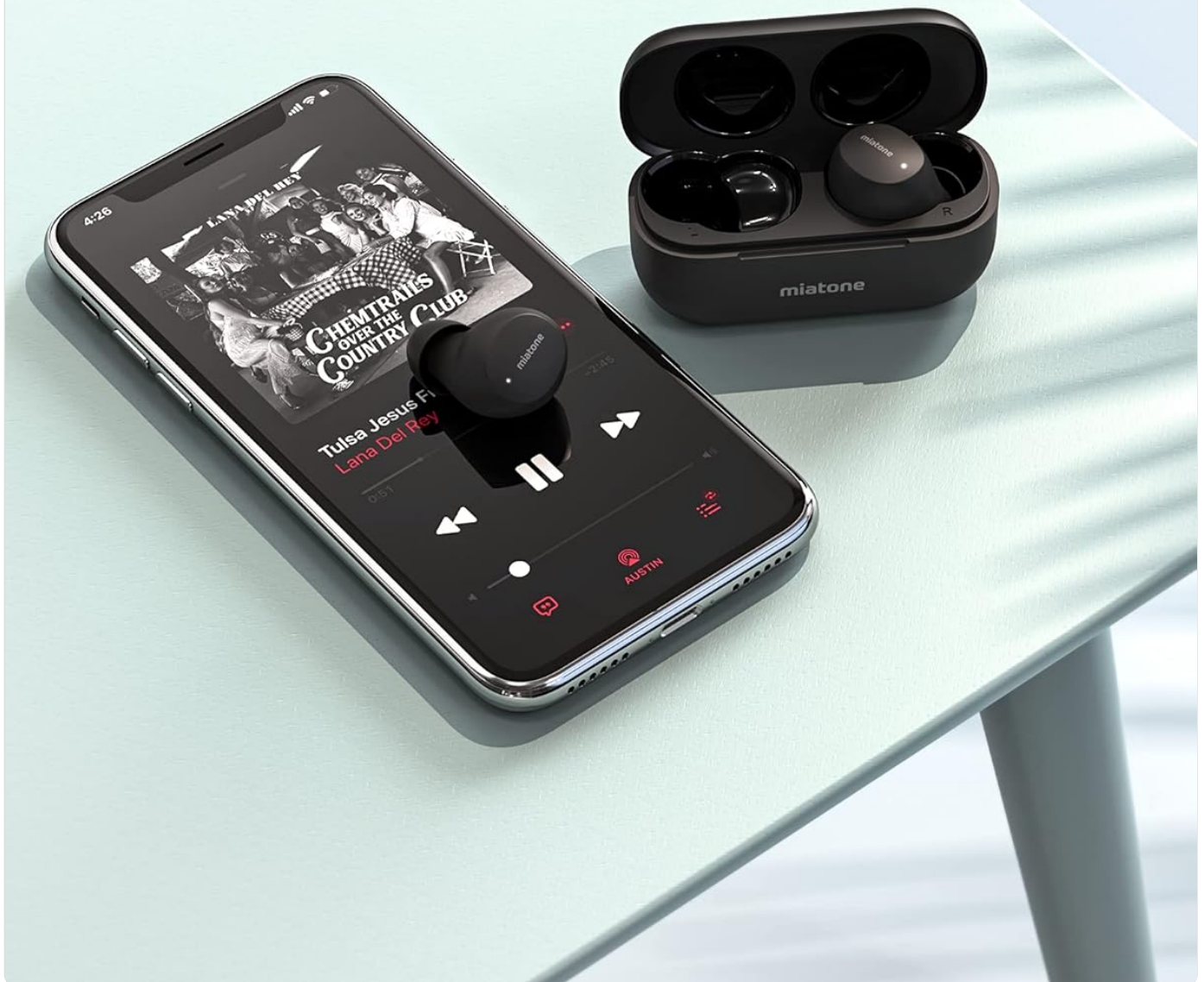
Image: Graphic demonstrating the quick charge feature: 10 minutes of charging provides up to 3 hours of use.

Take out to reconnect automatically, quick access to the music.