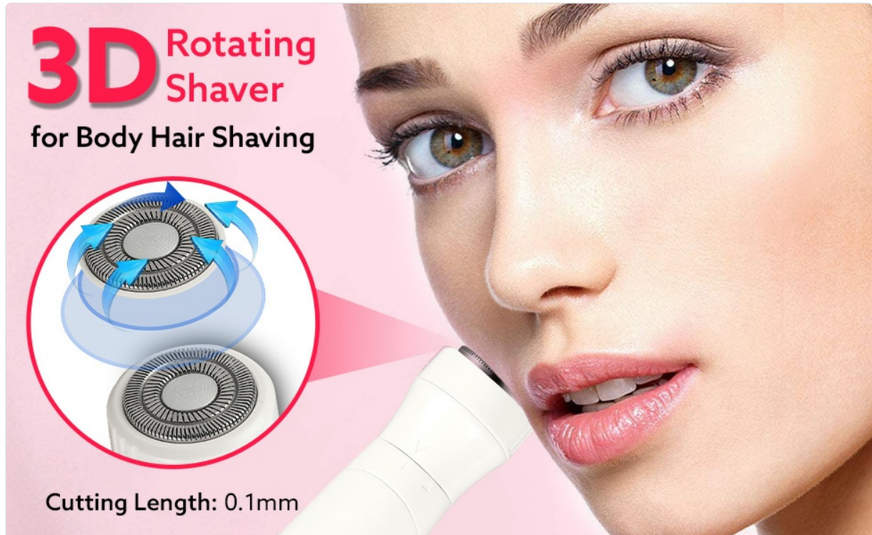
Image: The 3D rotating shaver head in action for facial hair removal.

Attach the rotating shaver head. Gently press the shaver head against your skin and move it in small, circular motions or against the direction of hair growth. This head is ideal for facial hair and other delicate areas, providing a close shave of 0.1 mm.