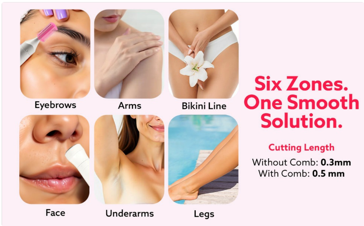
Image: Demonstrating the effectiveness of the trimmer head on underarm hair.