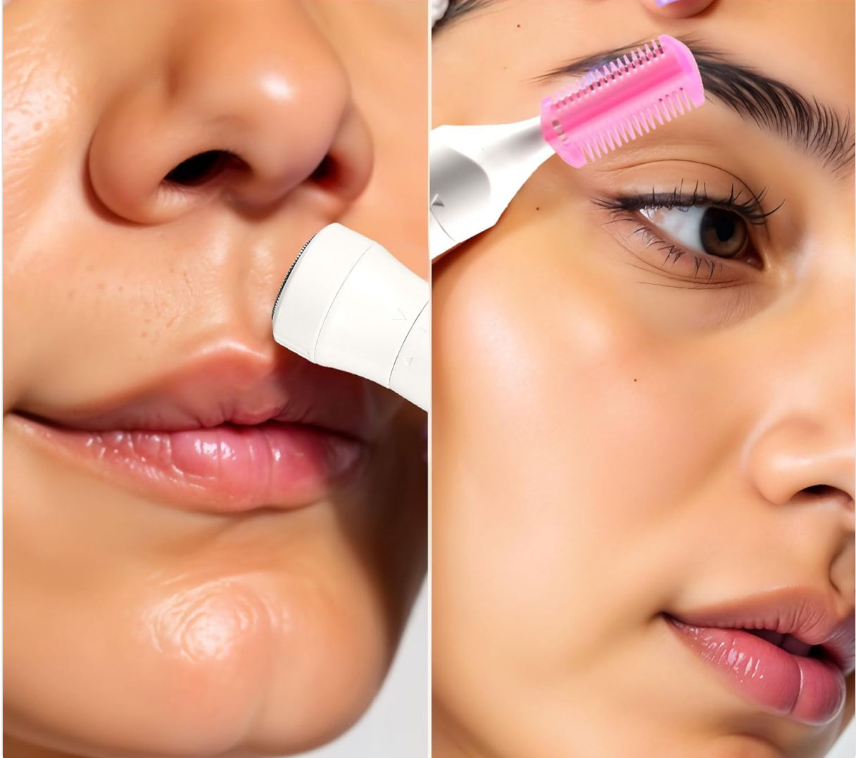
Image: Using the eyebrow trimmer head for precise eyebrow shaping.