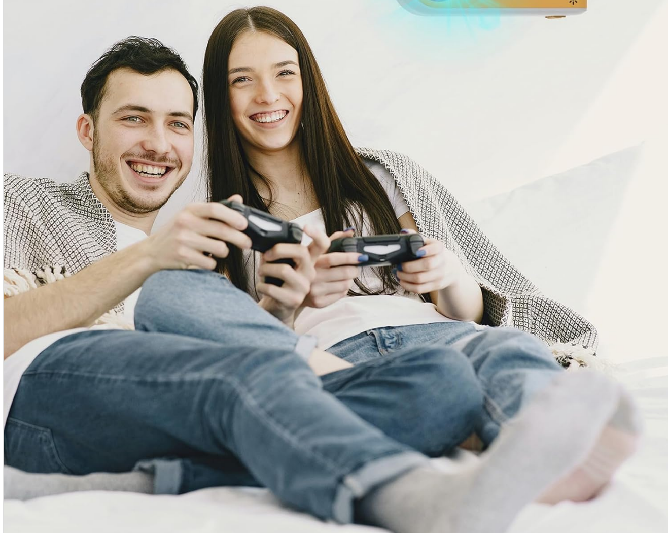
Figure 5.1: Projector in use for gaming.