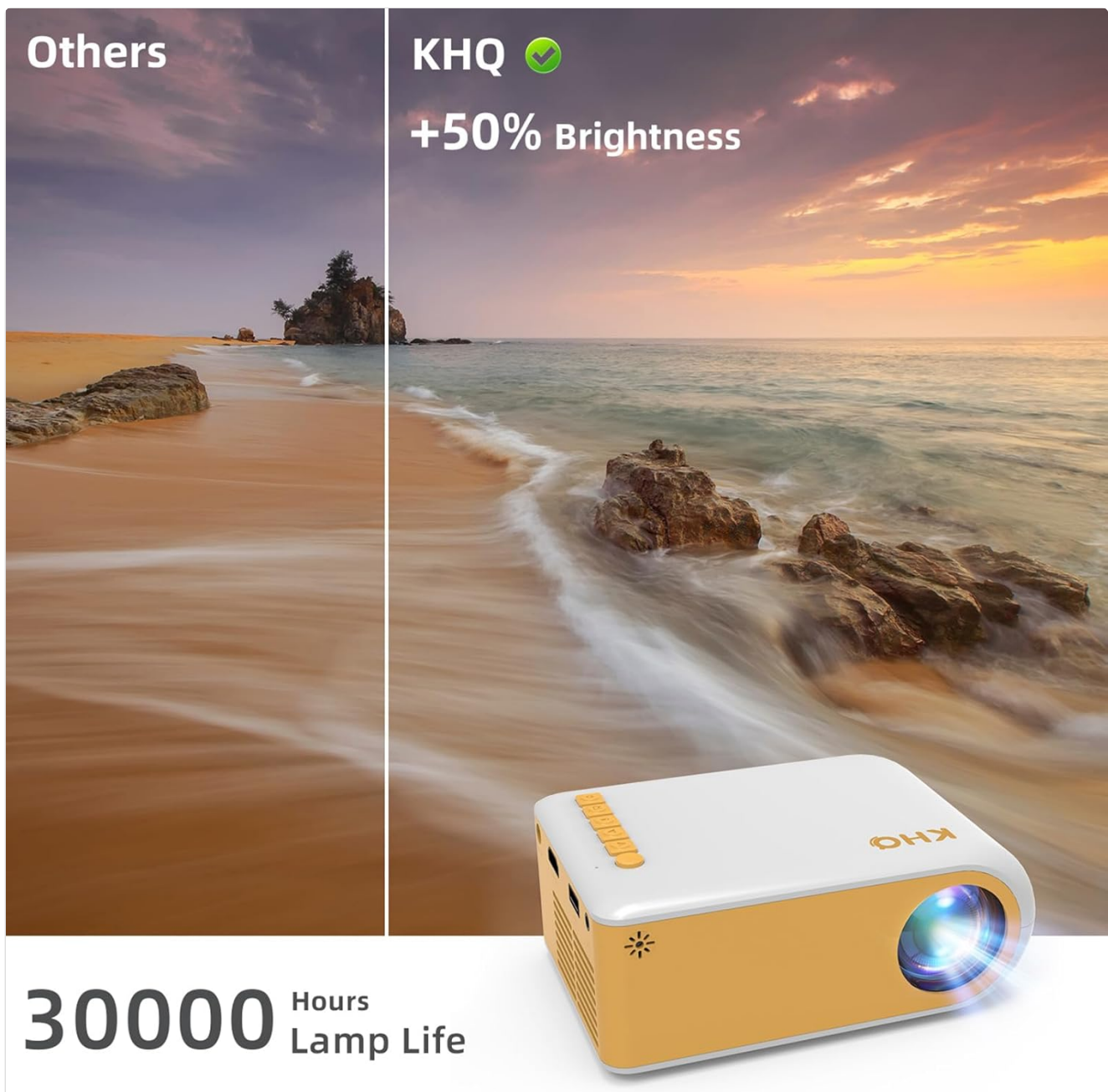
Figure 5.2: Projector used for outdoor cinema.

Your browser does not support the video tag.