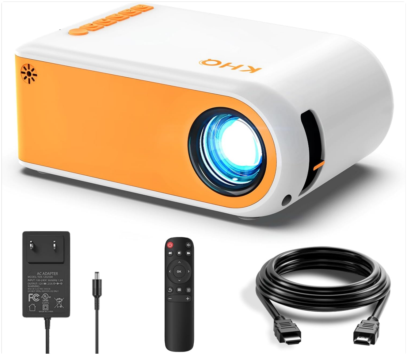
Figure 2.1: KHQ Mini Projector VF260 Pro and its accessories.