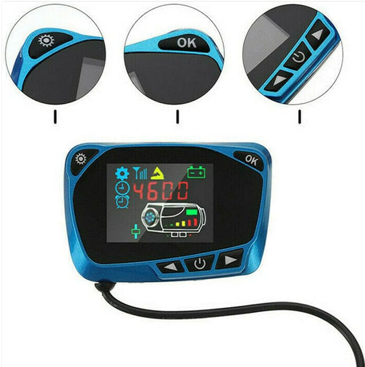
Image 6: Close-up view of the buttons and display on the Riloer LCD Monitor Switch.

remote control to manually manage fuel supply.