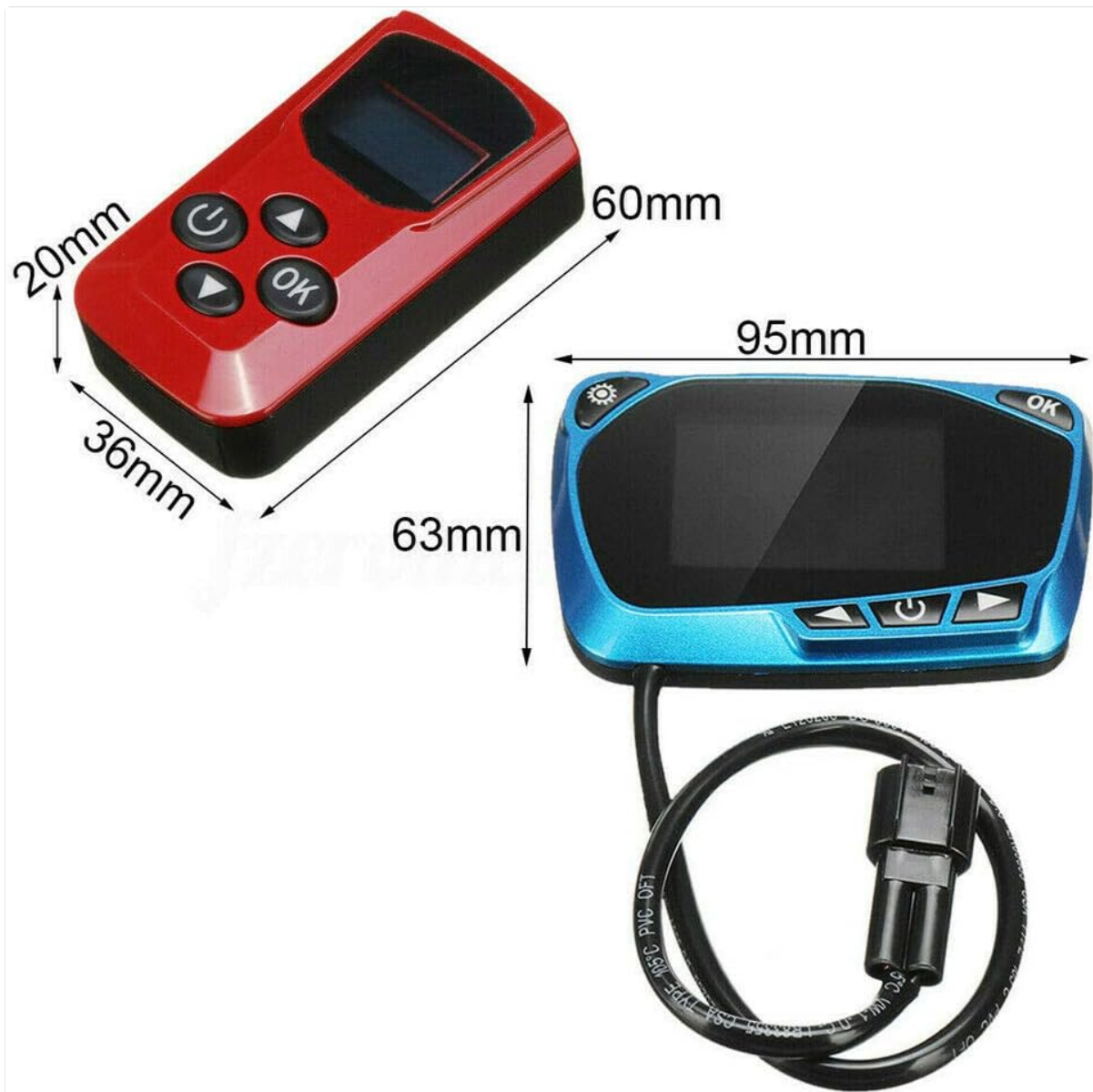
Image 3: Detailed dimensions of the LCD monitor switch and the remote control.