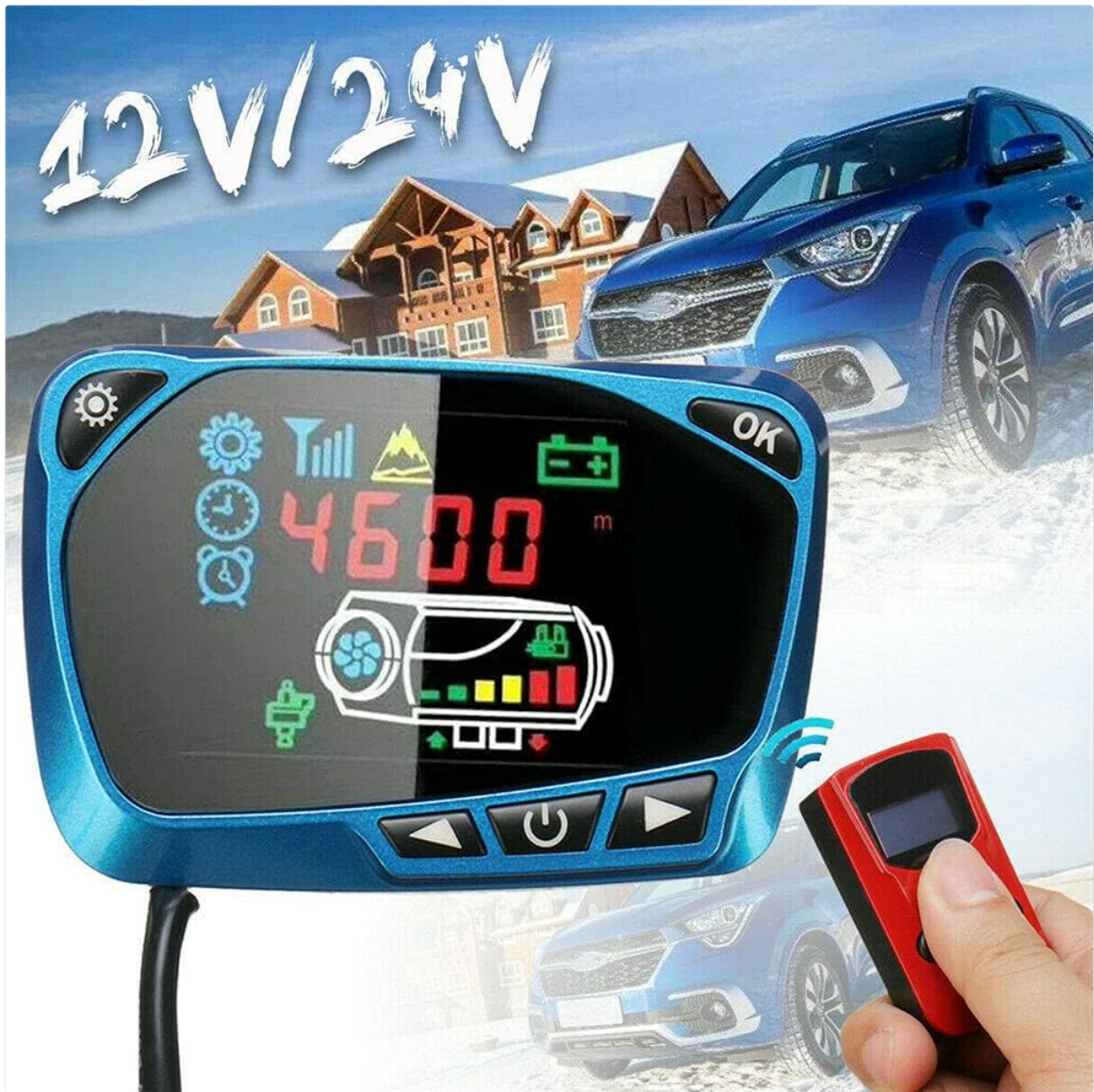
Image 1: Riloeer 12/24V Car Air Diesel Heater LCD Switch and Remote Control. This image shows the blue LCD monitor switch and the red remote control, with a vehicle in the background, illustrating its application.