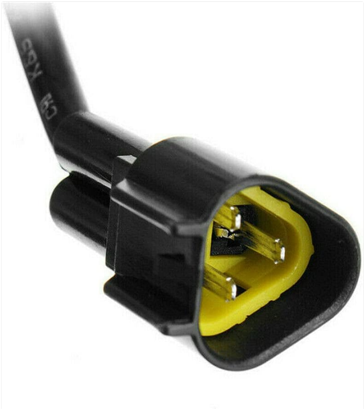
Image 5: Close-up view of the connector for the Rilber LCD Monitor Switch.