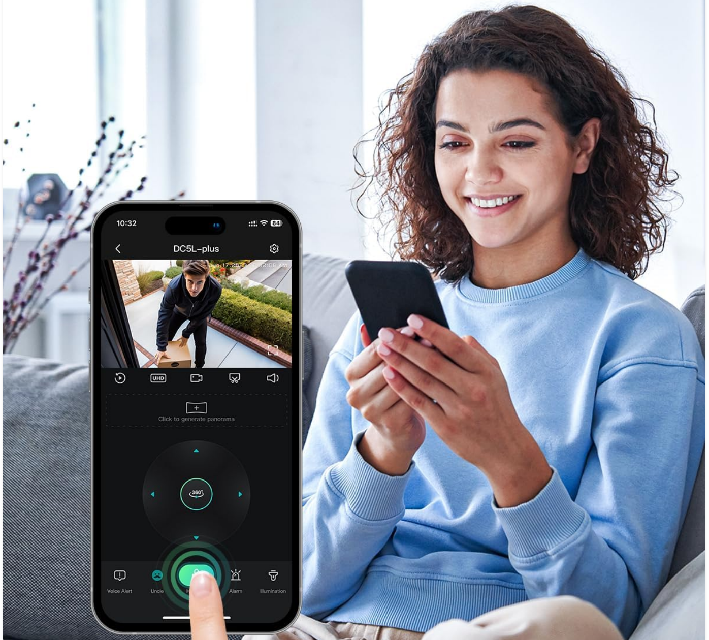
Image: A woman holding a smartphone, displaying the DEKCO app interface with options for instant alerts and voice-changing function, illustrating the two-way audio feature.