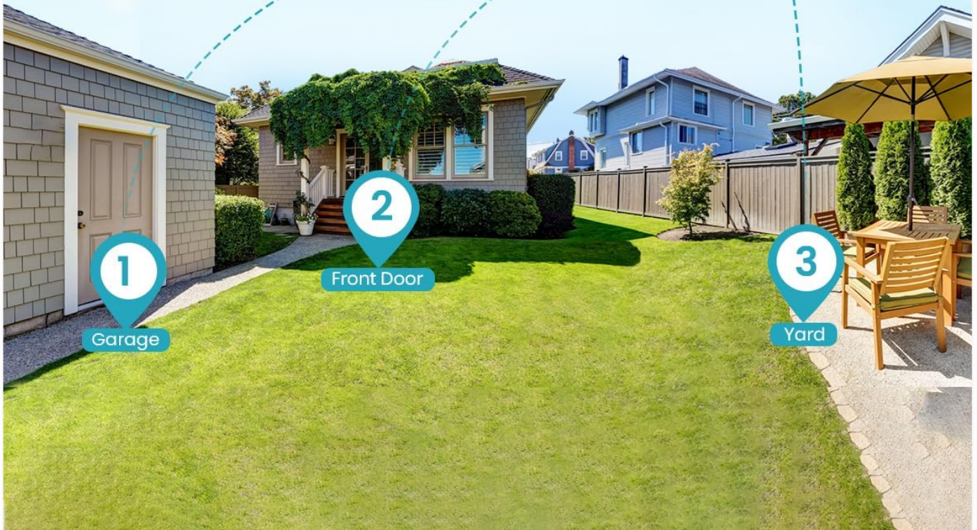
Image: A diagram illustrating the optimal placement of the DEKCO camera to cover a wide area including a garage, front door, and yard, demonstrating its 360-degree viewing capability.