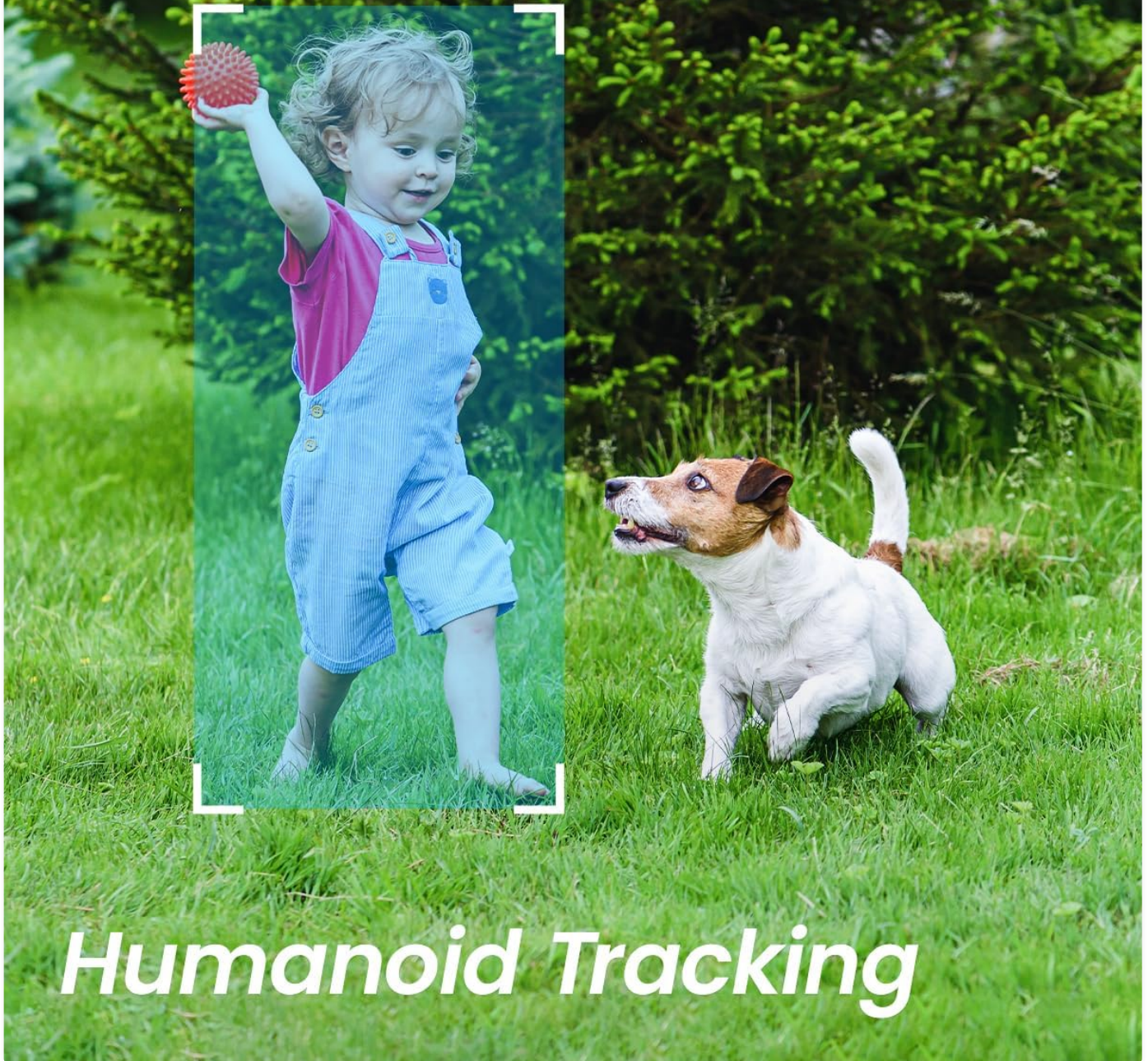
Image: A child and a dog in a grassy area, with a green box highlighting the child, demonstrating the camera's humanoid tracking feature.