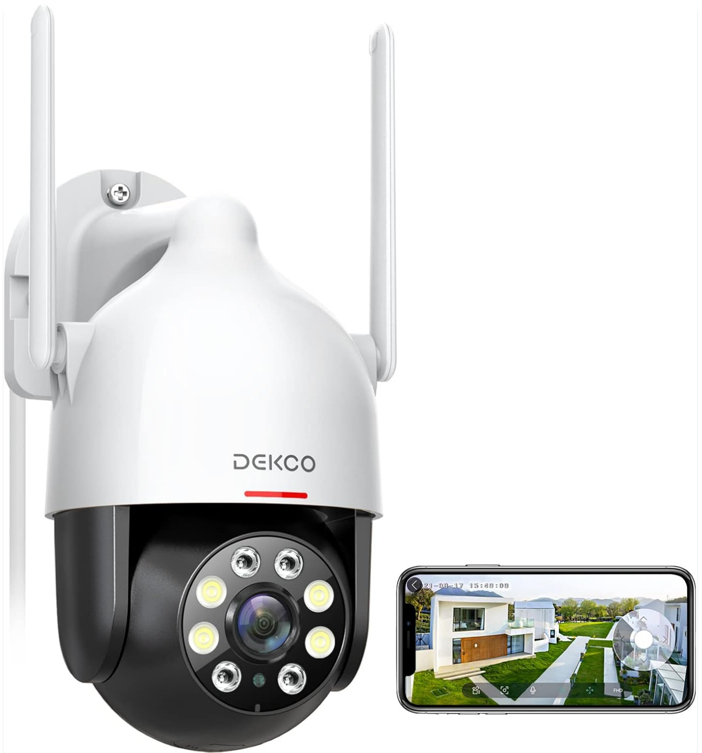
Image: The DEKCO 2K WiFi Surveillance Security Camera, a white and black dome-shaped camera with two antennas, shown next to a smartphone displaying its live feed.