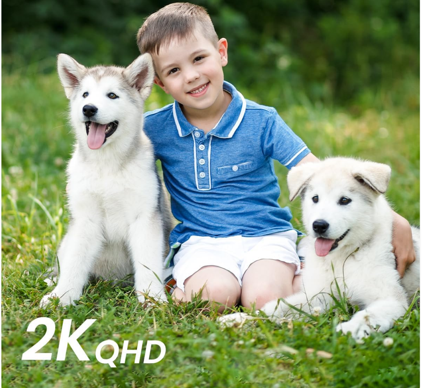
Image: A young boy smiling with two husky puppies in a grassy area, with "2K QHD" overlay, highlighting the camera's ability to capture clear details.