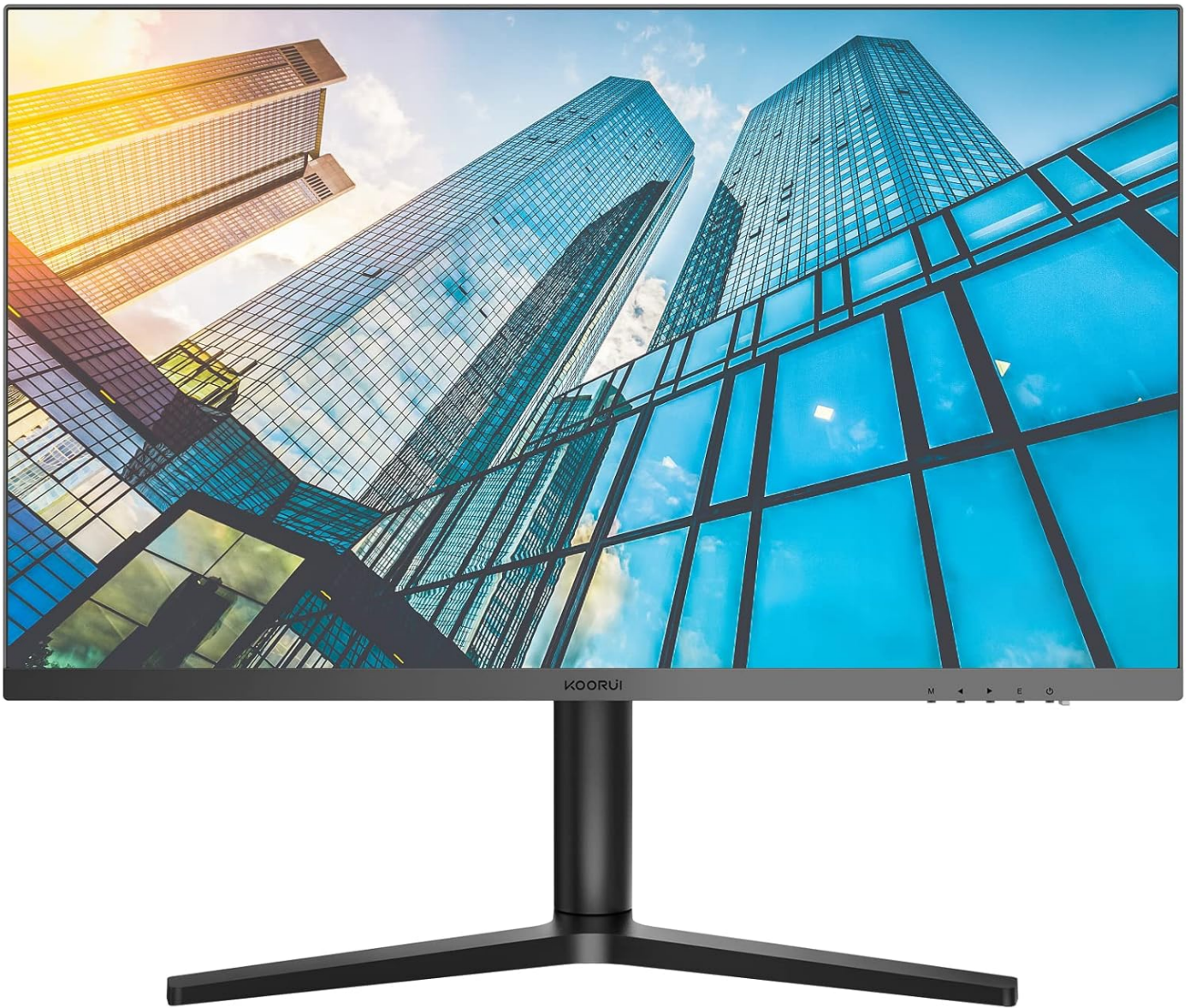
Image: Front view of the KOORUI 27 inch Gaming Monitor, showcasing its thin bezels and vibrant display.