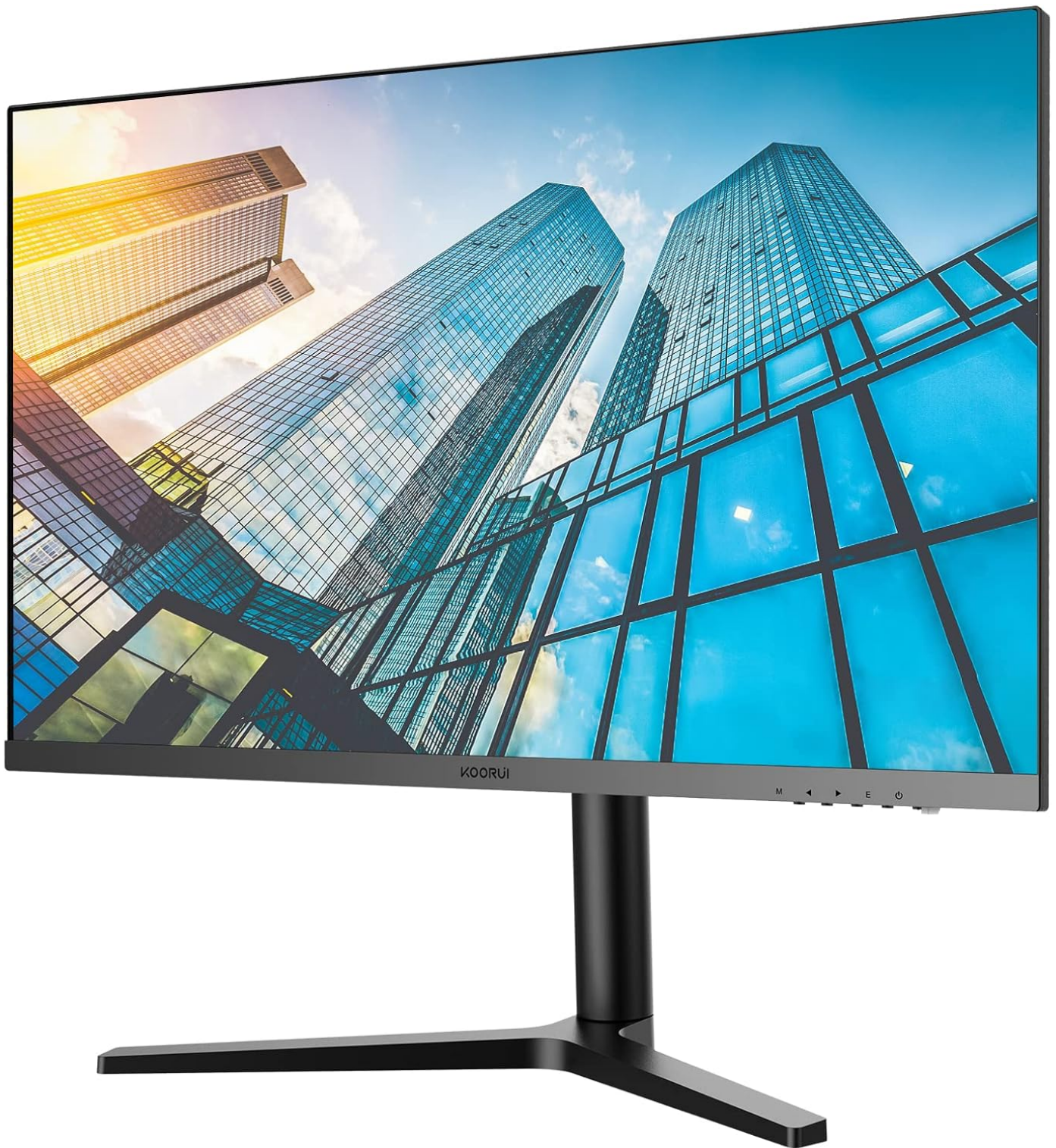
Image: Angled view of the KOORUI monitor with its stand fully assembled, ready for connection.