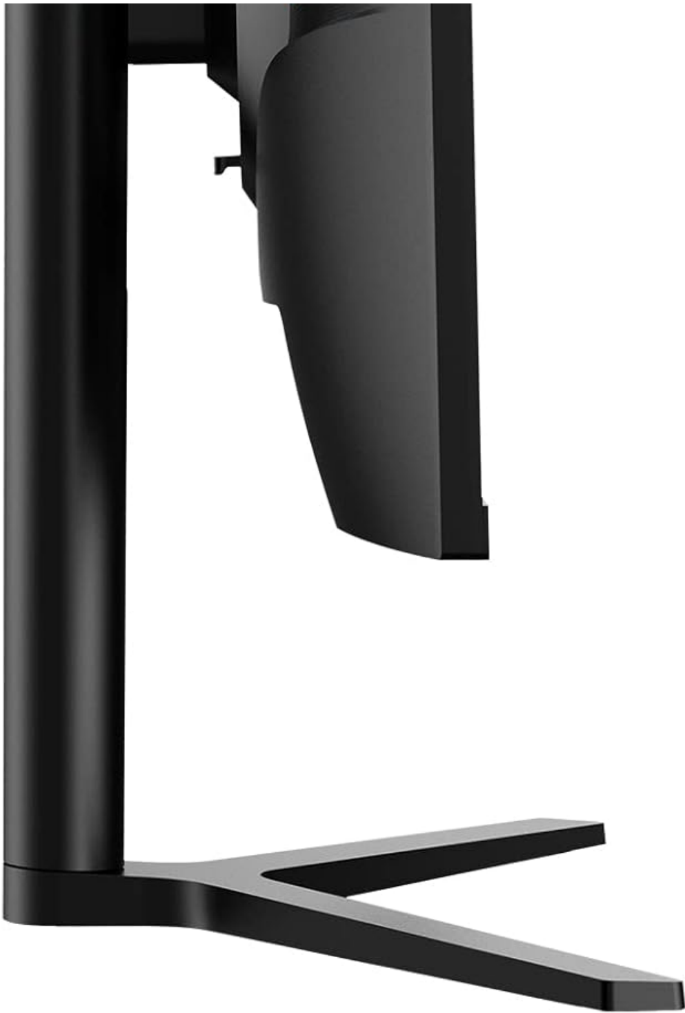
Image: Side view of the KOORUI monitor, illustrating its slim profile and the range of tilt adjustment.