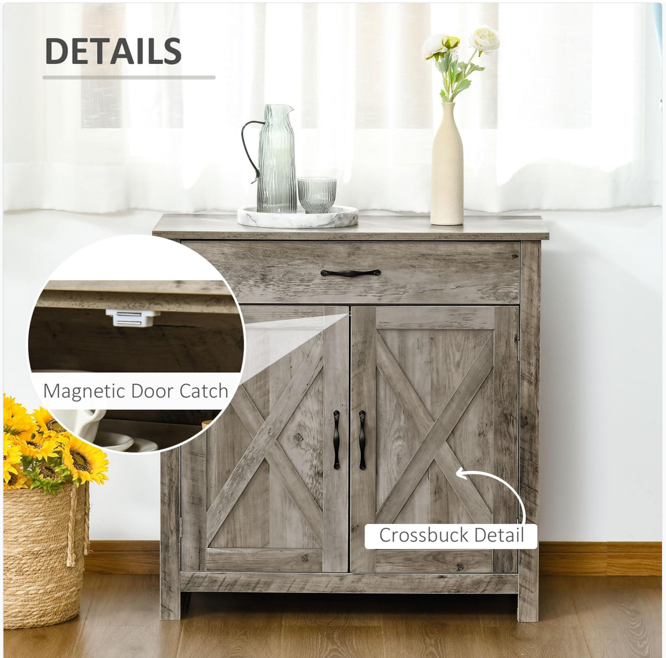
Image: Detailed view highlighting the magnetic door catch mechanism and the decorative crossback design on the barn doors.