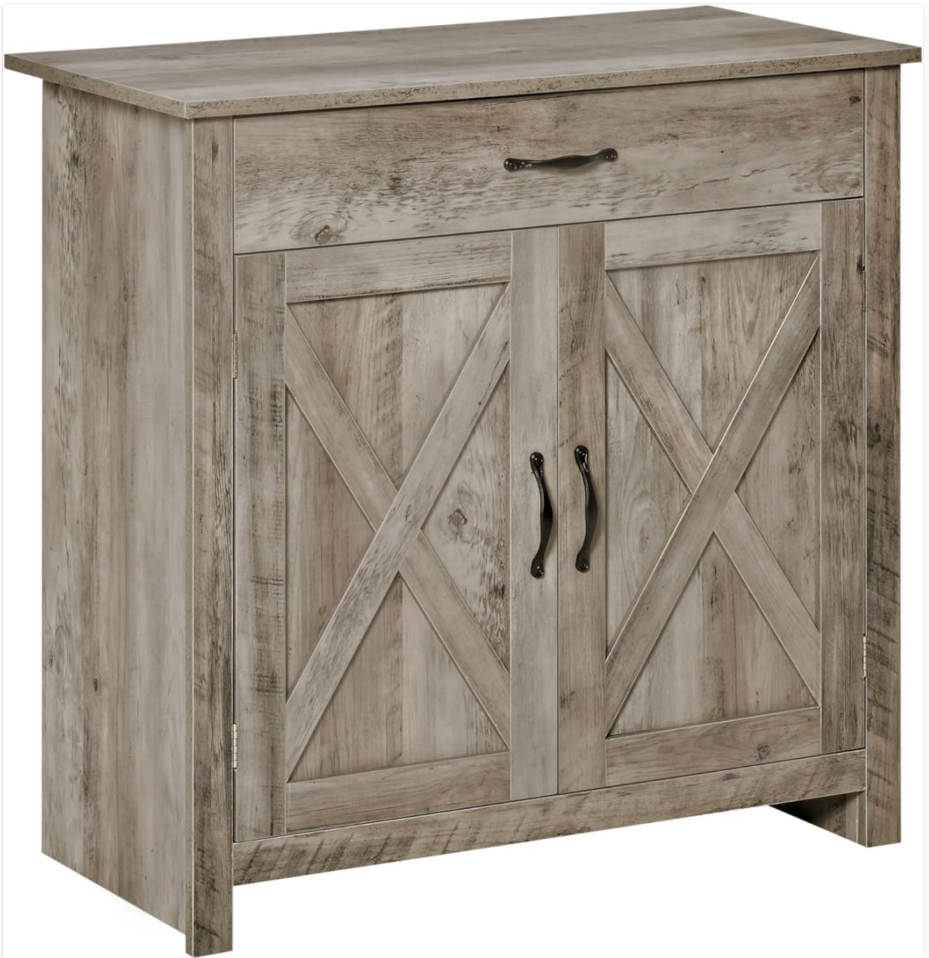
Image: The HOMCOM Farmhouse Sideboard Buffet Cabinet in its grey finish, showcasing its barn door design and top drawer.