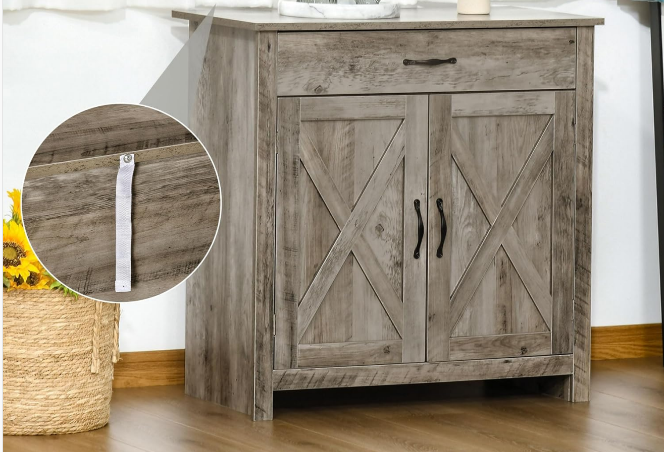
Image: Illustration of the anti-tipping design, showing how the cabinet can be fixed to the wall for safety.