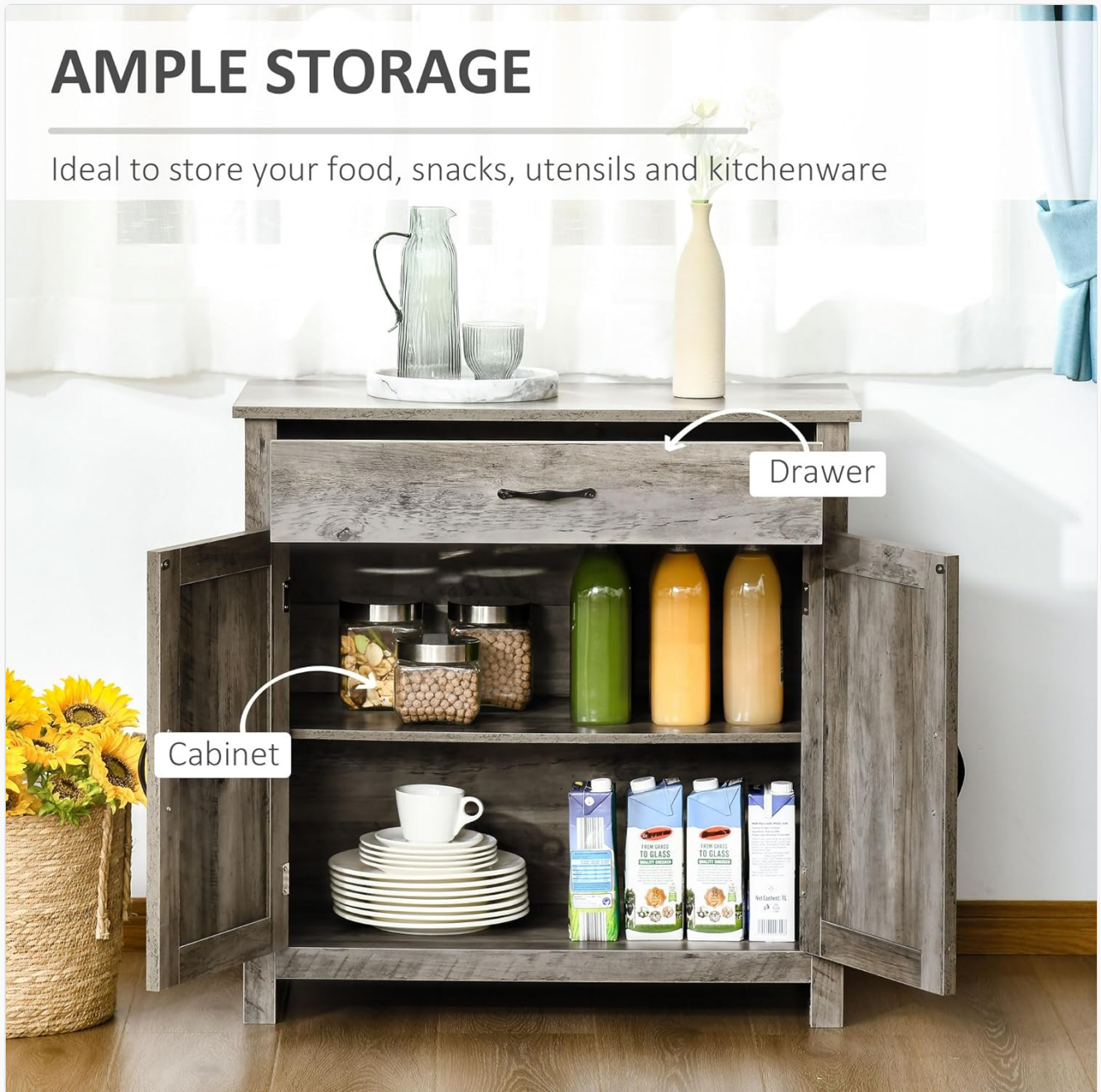
Image: The cabinet with its drawer pulled out and barn doors open, revealing ample storage space for various items like jars, bottles, and plates.

Ideal to store your food, snacks, utensils and kitchenware