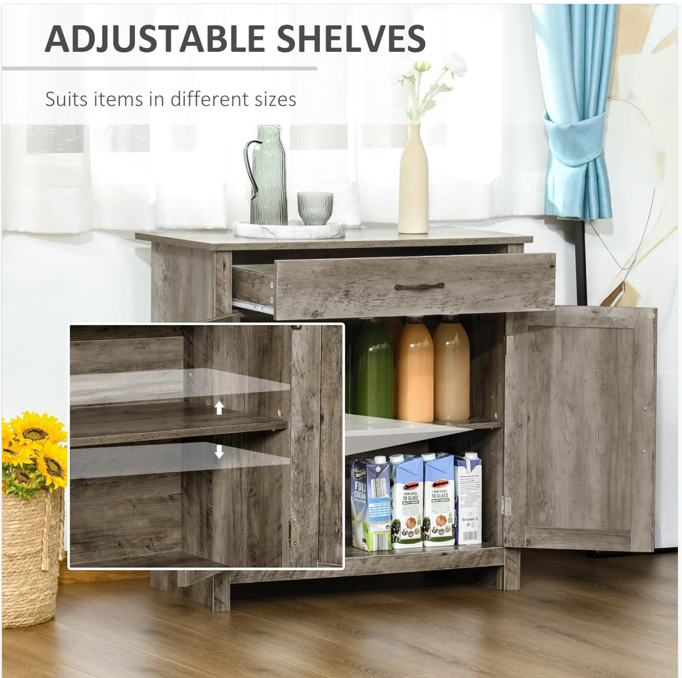
Image: A close-up view demonstrating the adjustable shelf feature, showing how the shelf can be moved to different height levels.