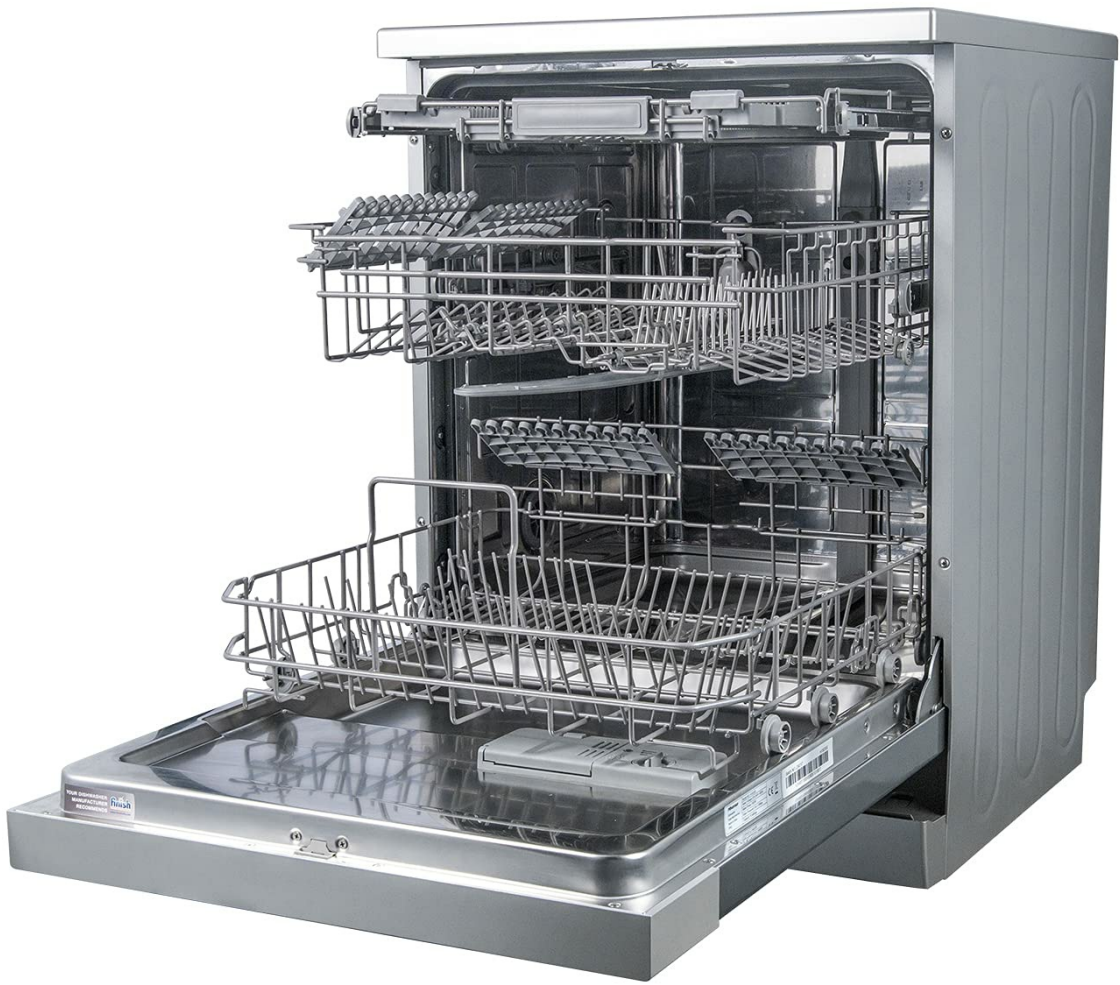
Interior view of the dishwasher, showing the three-layer basket system for versatile loading.