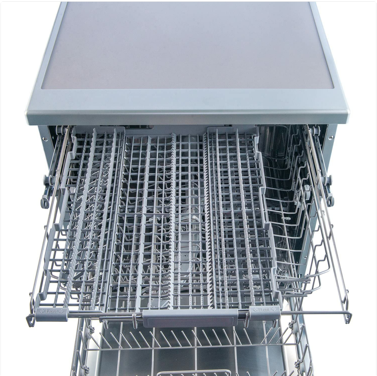
Close-up view of the top basket, demonstrating its design for cutlery and smaller items.