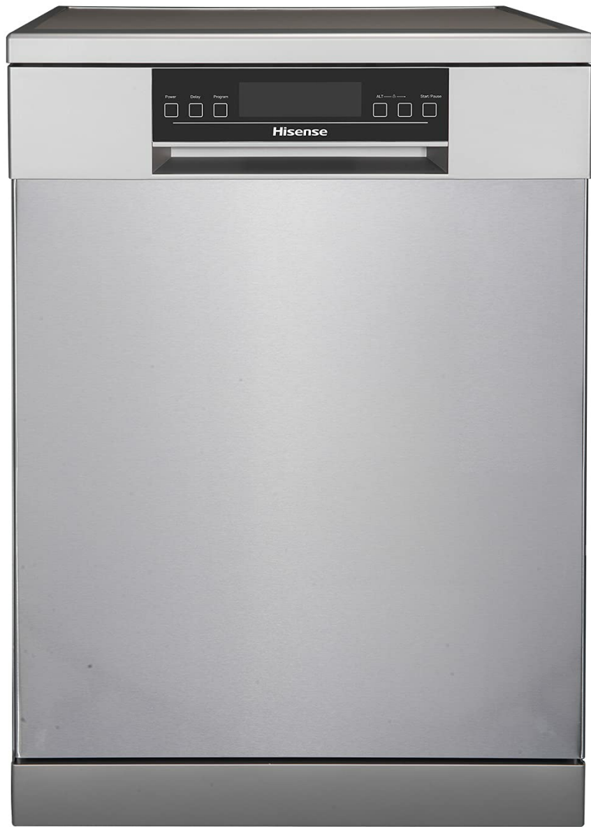
Front view of the Hisense H15DSS Dishwasher, showcasing its sleek stainless steel design and control panel.