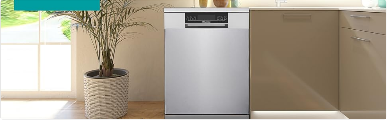
The Hisense H15DSS Dishwasher seamlessly integrated into a modern kitchen environment.

Proper installation is crucial for the dishwasher's performance and longevity. It is recommended to have the appliance installed by a qualified technician.