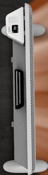
Image: Depiction of the heater's silent operation, emphasizing no fan, no dry air, and no dazzling light for a comfortable environment.