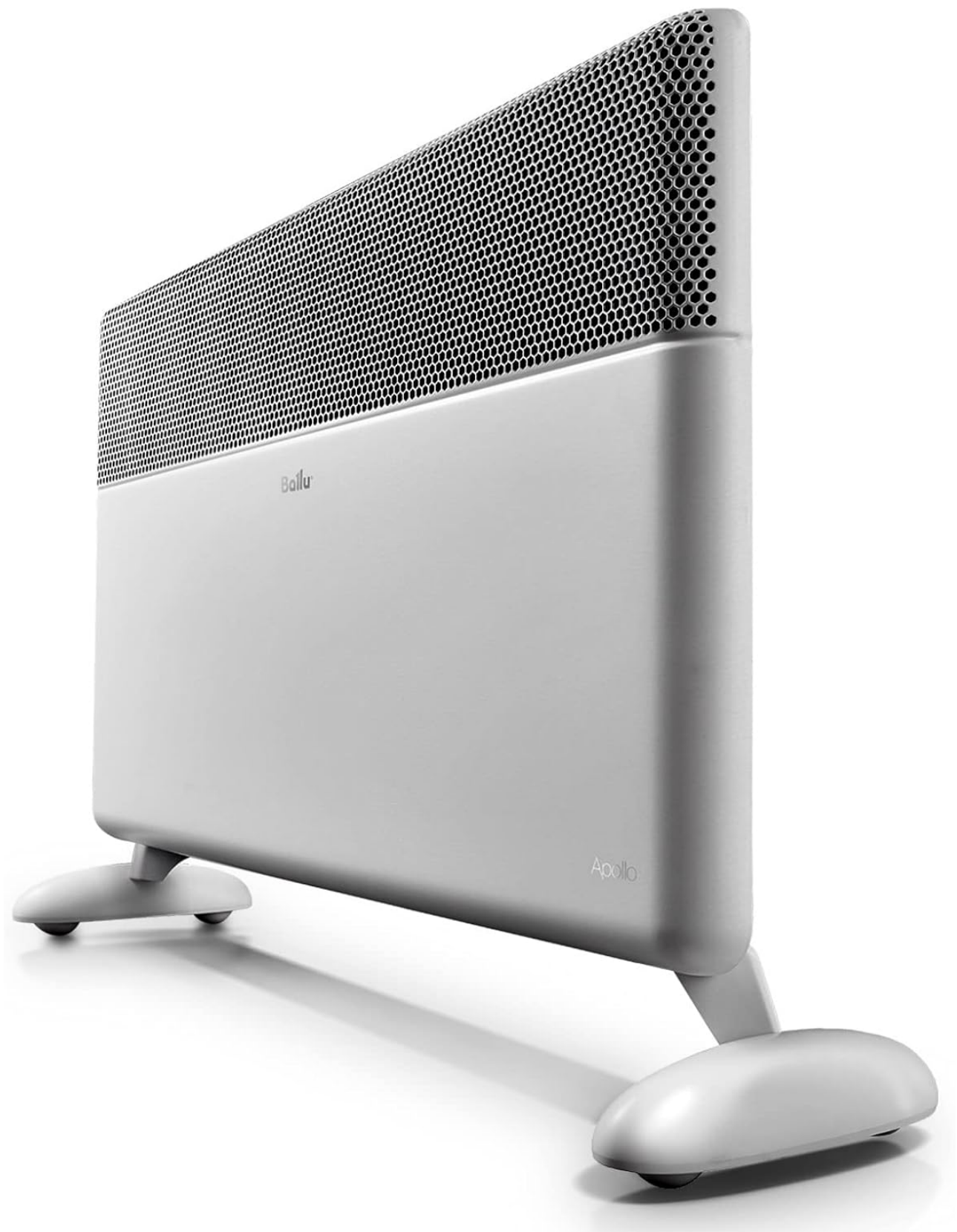
Image: The BALLU Apollo Portable Convection Panel Space Heater, showcasing its sleek white design and freestanding feet.