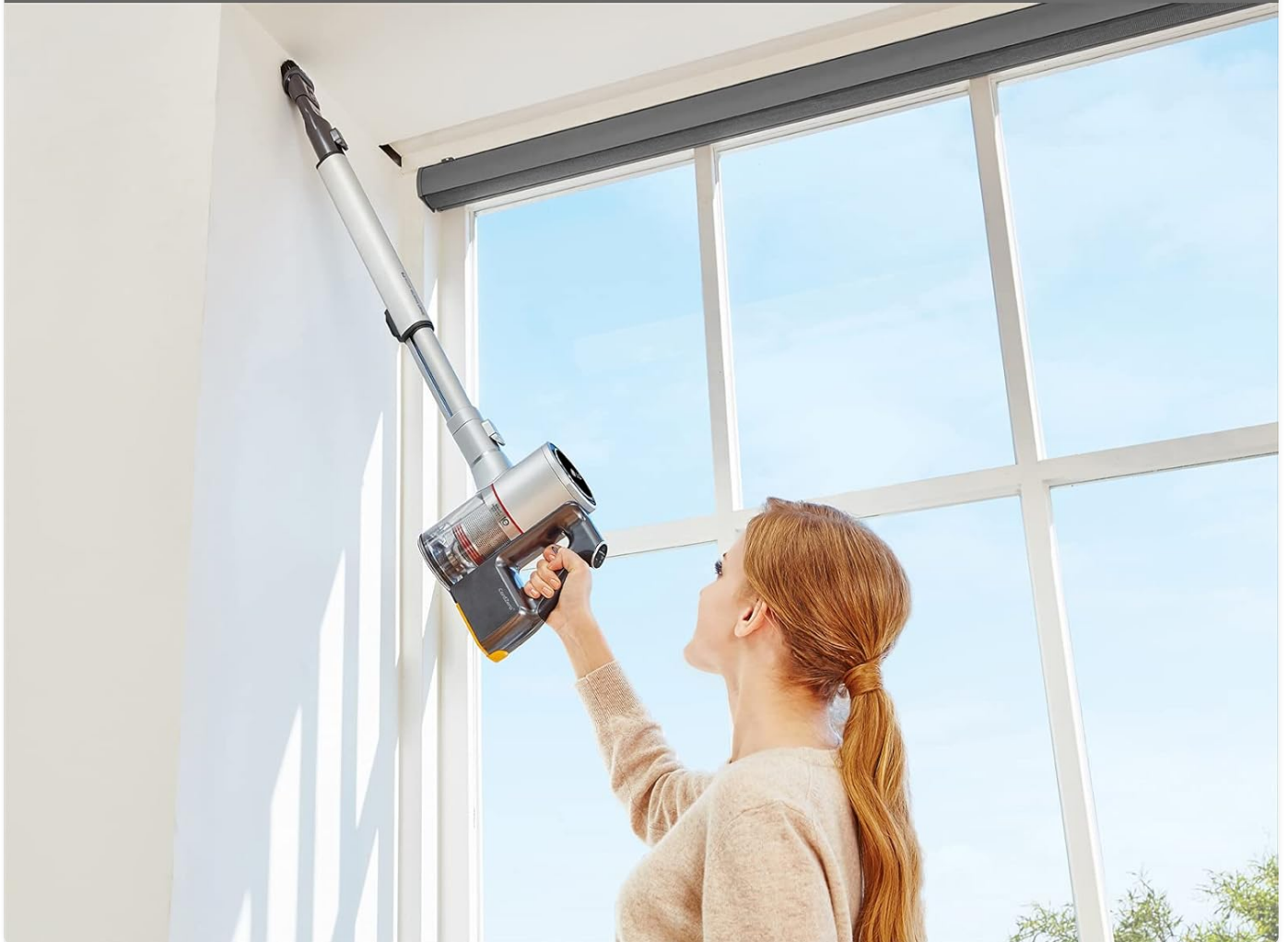
Image 5.2: A user adjusting the telescopic tube of the LG CordZero A9K-CORE1S to clean high areas, demonstrating its adjustable height feature.