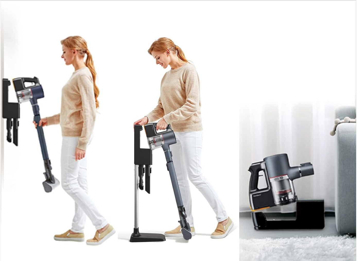
Image 4.2: Visual representation of the three convenient charging and storage options for the LG CordZero A9K-CORE1S: freestanding, wall-mounted, and compact.

Connect the power adapter to the charging stand and plug it into a power outlet. The battery indicator lights will show the charging status.