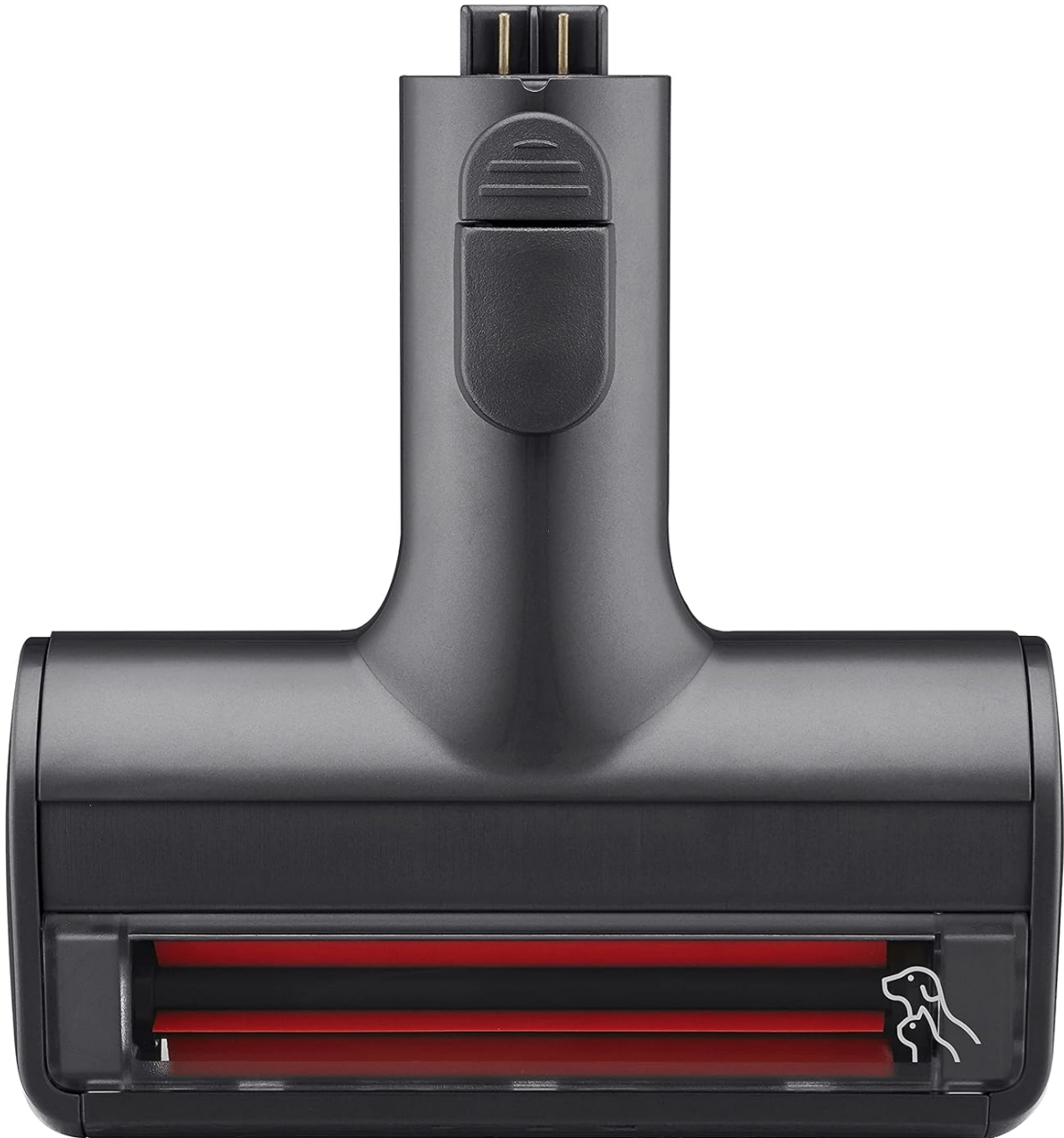
Image 6.4: Close-up of the Power Drive Mini Nozzle, designed for effective cleaning of fabric surfaces and pet hair removal.

Periodically check the brushes for tangled hair or debris. Use scissors to cut away any tangled hair and remove it. The Power Drive Mini Nozzle is particularly effective for pet hair and fabric surfaces.