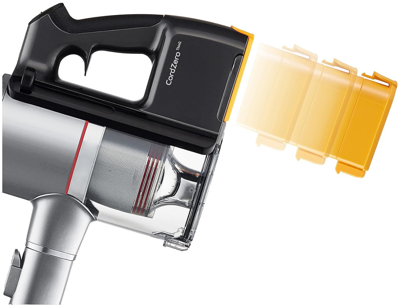
Image 6.1: A visual guide demonstrating how to easily remove the dust bin from the LG CordZero A9K-CORE1S for emptying.