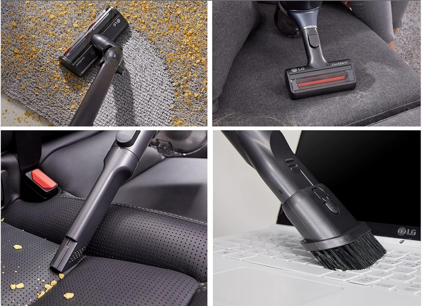
Image 3.1: The two main brushes and two accessory tools included with the LG CordZero A9K-CORE1S, designed for comprehensive cleaning.