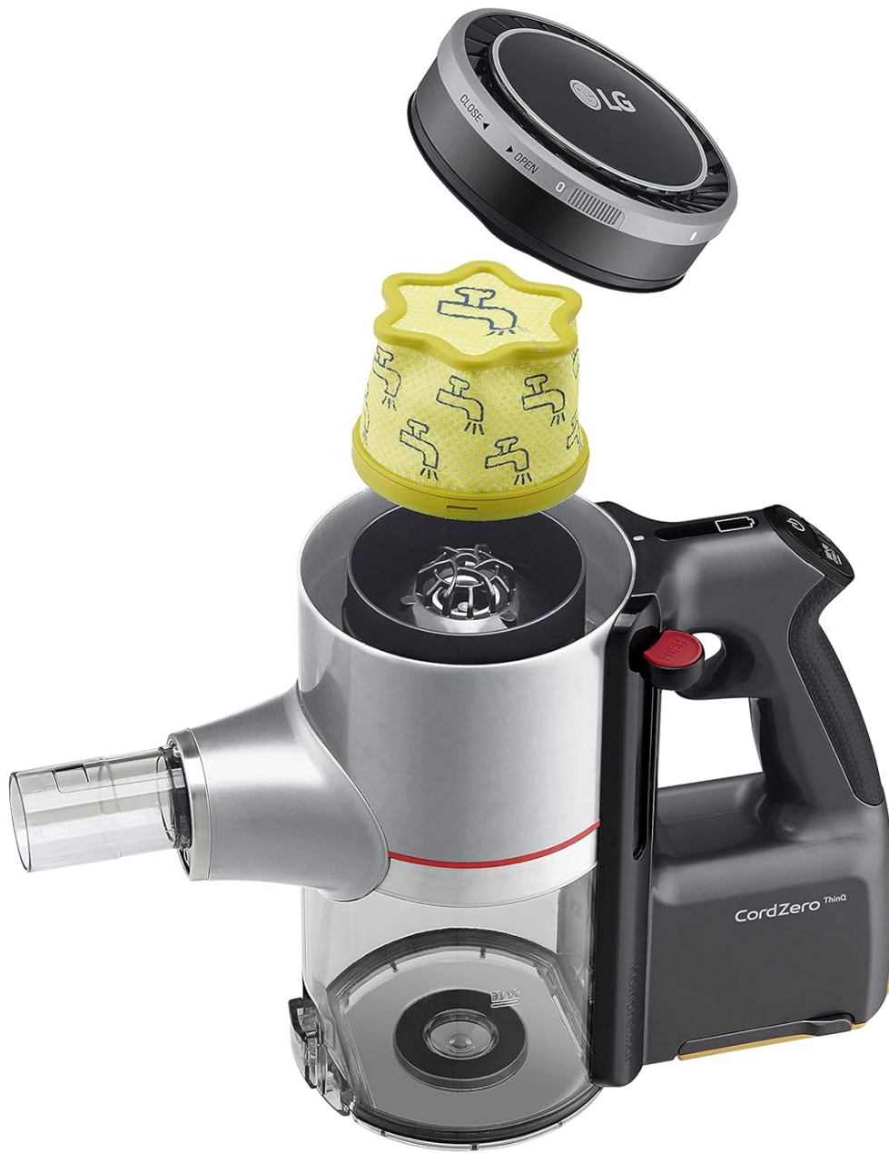
Image 6.2: An exploded view showing the various filter components of the LG CordZero A9K-CORE1S, including the metal filter, pre-filter, and HEPA filter.