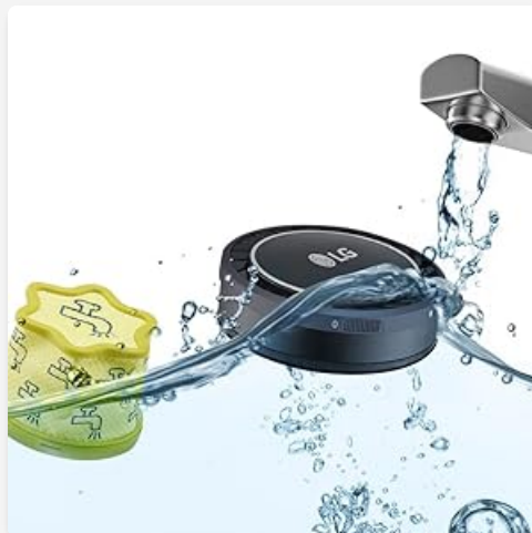
Image 6.3: Demonstration of washing the removable filters of the LG CordZero A9K-CORE1S under running water for easy maintenance.