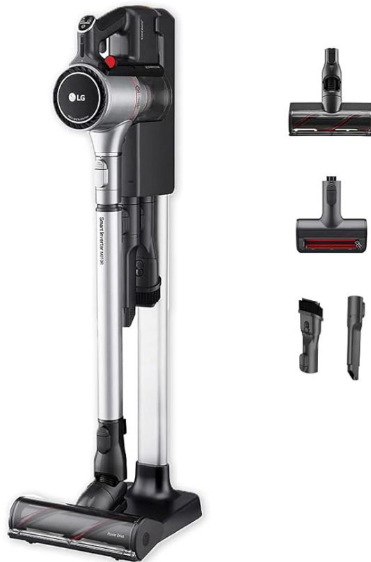
Image 1.1: The LG CordZero A9K-CORE1S cordless vacuum cleaner shown with its included accessories, highlighting its sleek design and comprehensive cleaning tools.

The LG CordZero A9K-CORE1S is a powerful and versatile cordless vacuum cleaner designed for efficient home cleaning. It features a Smart Inverter Motor, Axial Turbo Cyclone technology for strong suction, and a dual battery system providing up to 120 minutes of runtime. This model includes two specialized brushes and two accessories to tackle various cleaning tasks across different surfaces.