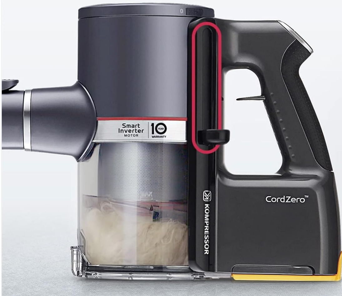
Image 5.3: Close-up view of the Kompressor lever on the LG CordZero A9K-CORE1S, indicating the mechanism for compressing dust within the bin.

comprimi sporco e polvere per una maggiore capacità