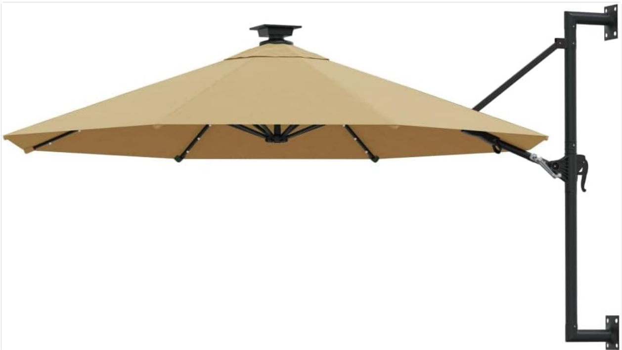
Image 1.1: The vidaXL Wall-mounted Parasol with LED Lights in its fully extended position, showcasing its design and coverage.

Thank you for choosing the vidaXL Wall-mounted Parasol with LED Lights. This manual provides essential information for the safe assembly, operation, and maintenance of your parasol. Please read these instructions carefully before installation and retain them for future reference.