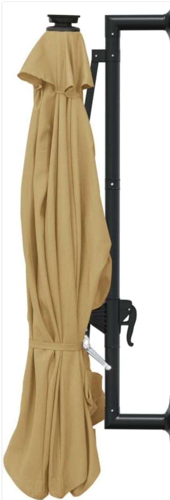
Image 5.2: The wall-mounted parasol shown in its folded and secured closed position, ready for storage or protection from weather.