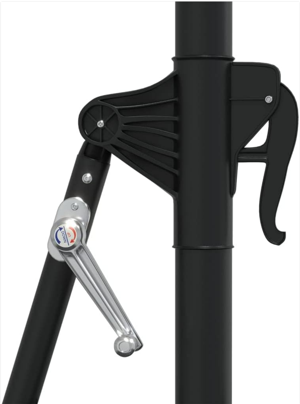
Image 5.1: A close-up view of the crank lift mechanism, used for opening and closing the parasol, and the lever for adjusting the canopy angle.