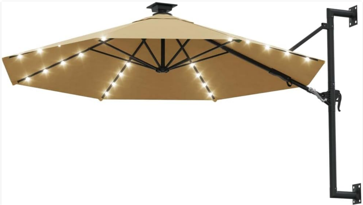
Image 5.3: The wall-mounted parasol with its integrated LED lights illuminated, providing ambient lighting.

dusk or via a manual switch, if present (check your specific model for a switch location, usually near the solar panel or on the main pole).