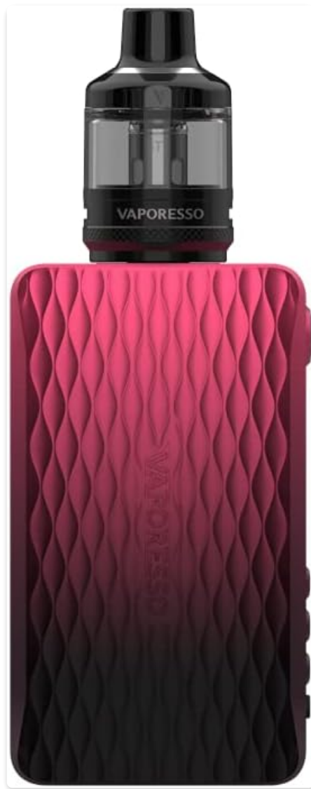
Image: The Vaporesso Gen 160 E-Cigarette Set, featuring the pink and black textured mod with the black GTX Pod 26 Clearomizer attached at the top.