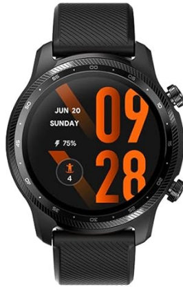
1*TicWatch Pro 3 Ultra GPS