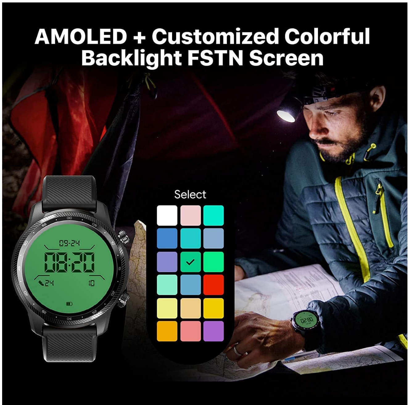
Image: The TicWatch Pro 3 Ultra GPS displaying its FSTN screen with various customizable backlight color options.