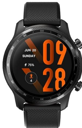
1*TicWatch Pro 3 Ultra GPS