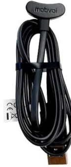
1*USB Charging Cable