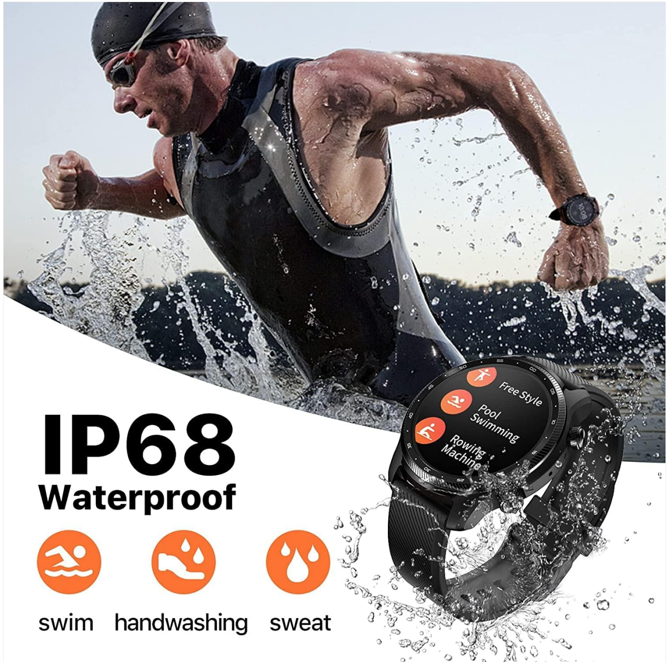
Image: The smartwatch shown in a water-splashed environment, emphasizing its IP68 waterproof capabilities for activities like swimming and handwashing.