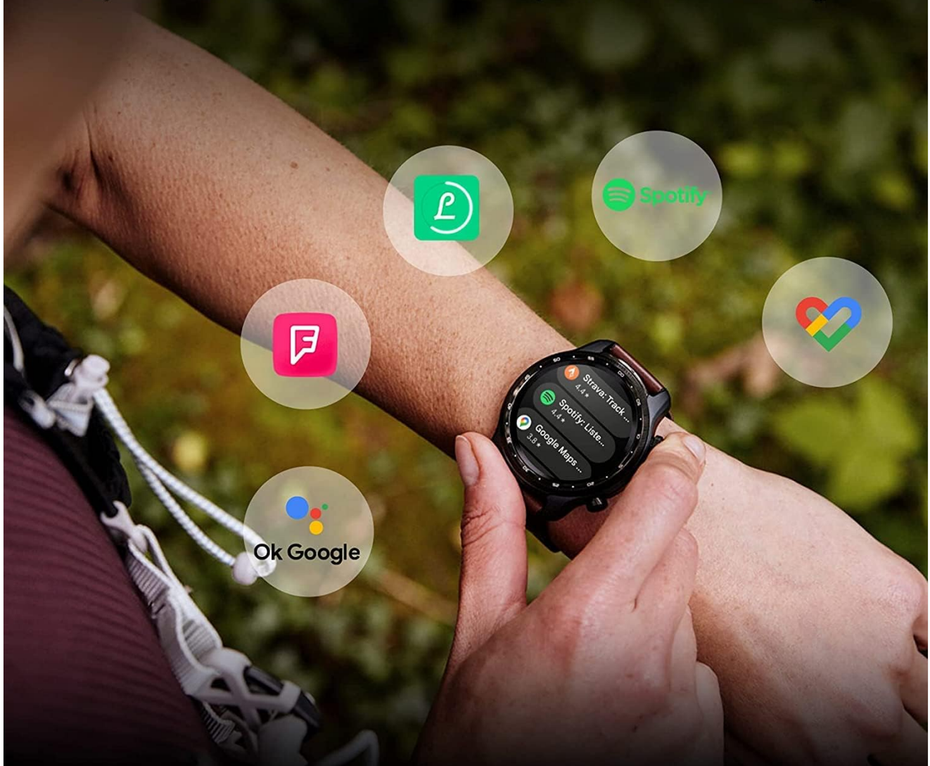
Image: The TicWatch Pro 3 Ultra GPS showing smart notifications from popular applications, keeping you connected.

Stay connected and be notified of calls, texts and SNS messages.