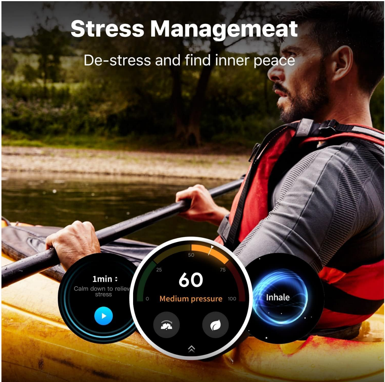
Image: The watch displaying stress management tools, including guided breathing exercises and stress level indicators.