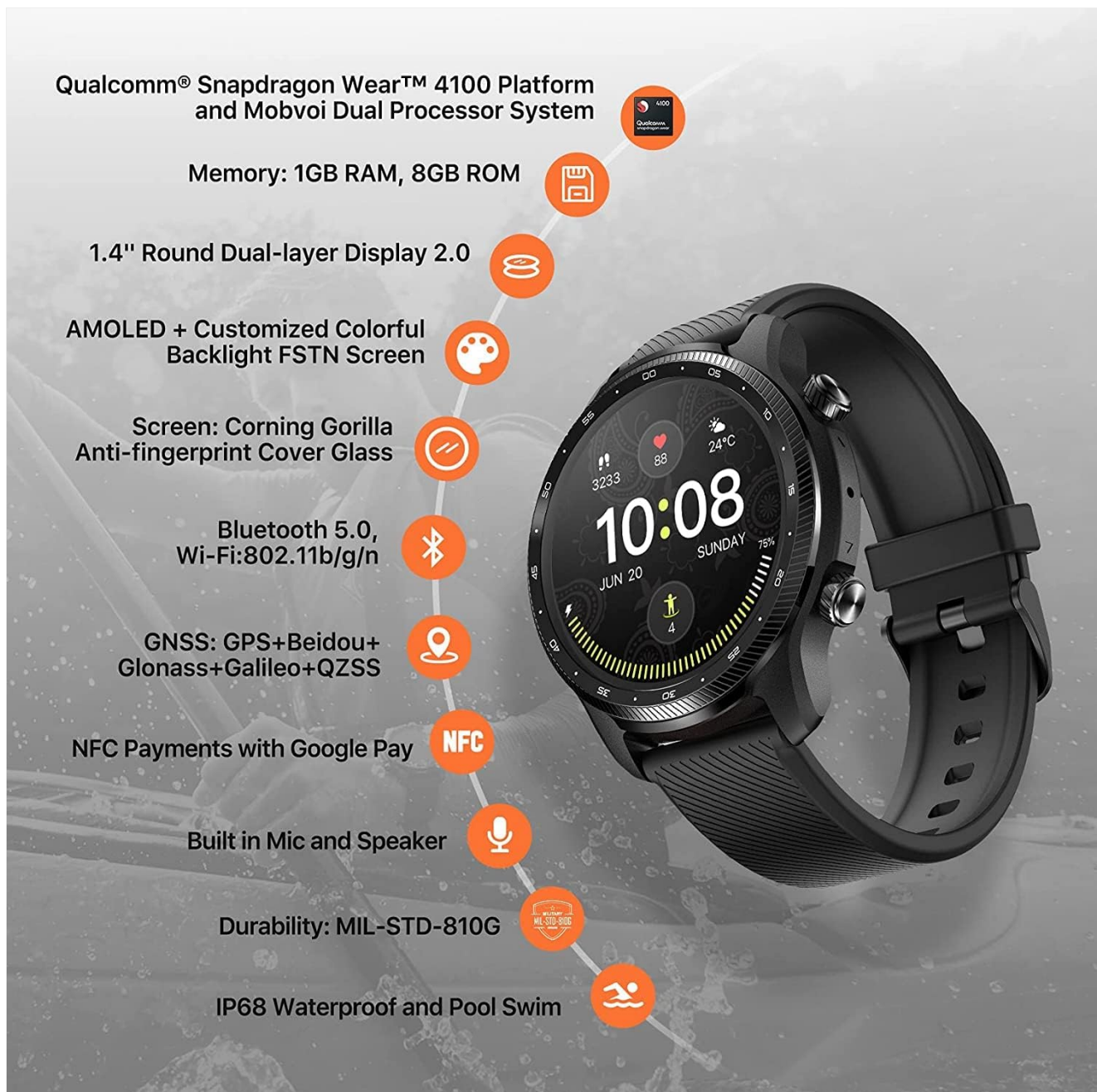
Image: An infographic summarizing key specifications and features of the TicWatch Pro 3 Ultra GPS, including processor, memory, display, and durability.