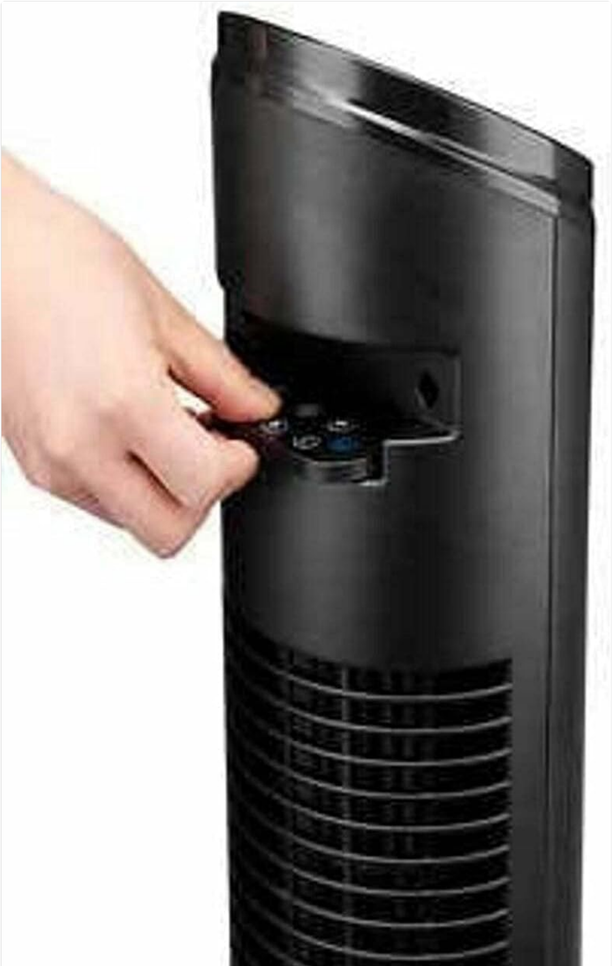
Figure 3: Remote control for the OmniBreeze Tower Fan.