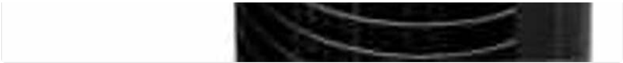
Figure 4: Integrated remote control storage slot on the fan body.