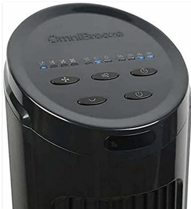
Figure 2: Top control panel with power, speed, mode, oscillation, and timer buttons.