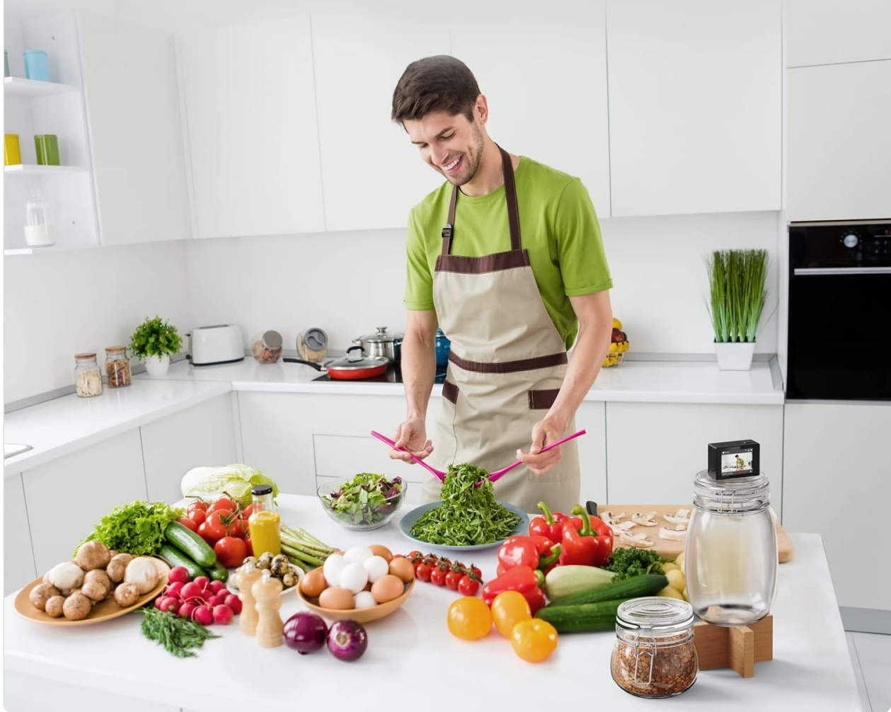
Image: The Surfola SF230 Action Camera positioned on a kitchen countertop, recording a person cooking, highlighting its versatility as a vlogging camera.