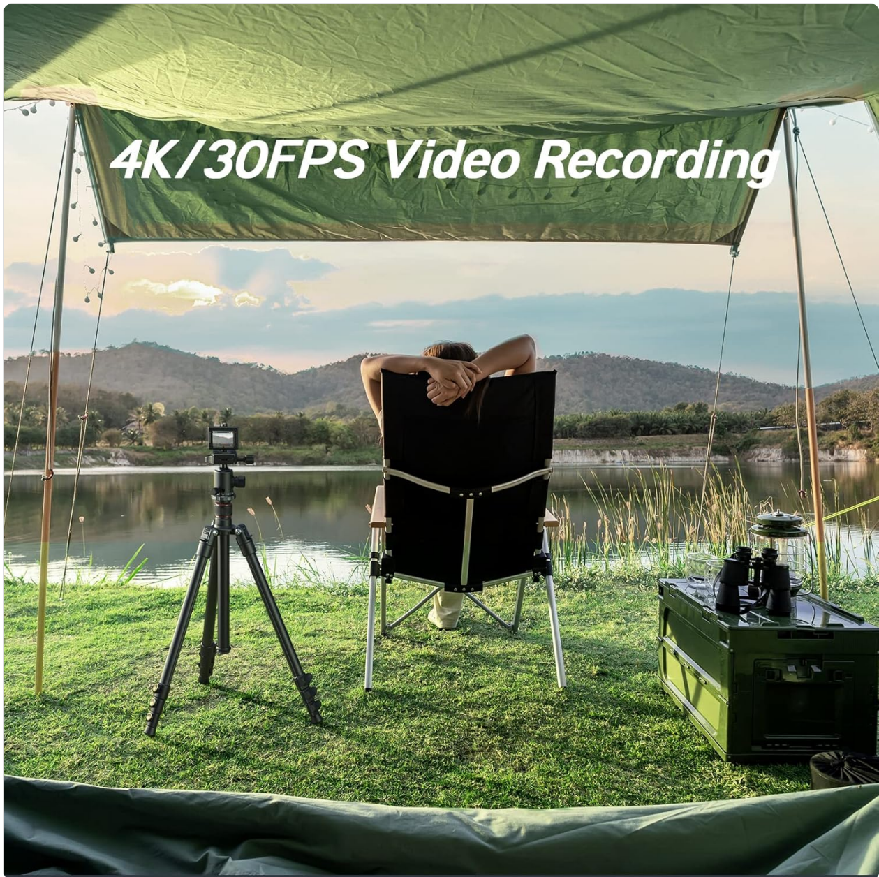
Image: The Surfola SF230 Action Camera set up on a tripod, capturing a scenic outdoor view, demonstrating its use for stable video recording.