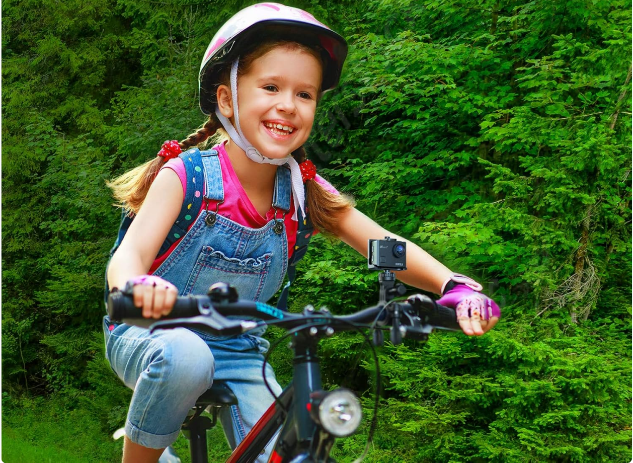
Image: A child riding a bicycle with the Surfola SF230 Action Camera mounted on the handlebars, demonstrating its suitability as an entry-level sports camera for biking.