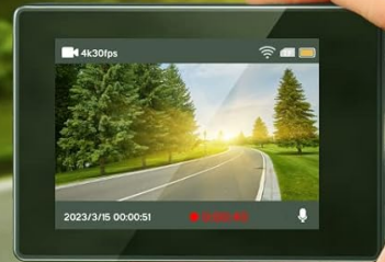
Image: The Surfola SF230 Action Camera mounted on a car dashboard, functioning as a dash camera to record driving scenery.