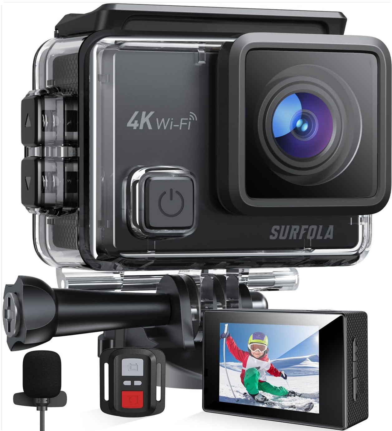
Image: The Surfola SF230 Action Camera, showcasing its compact design, waterproof housing, external microphone, and remote control.