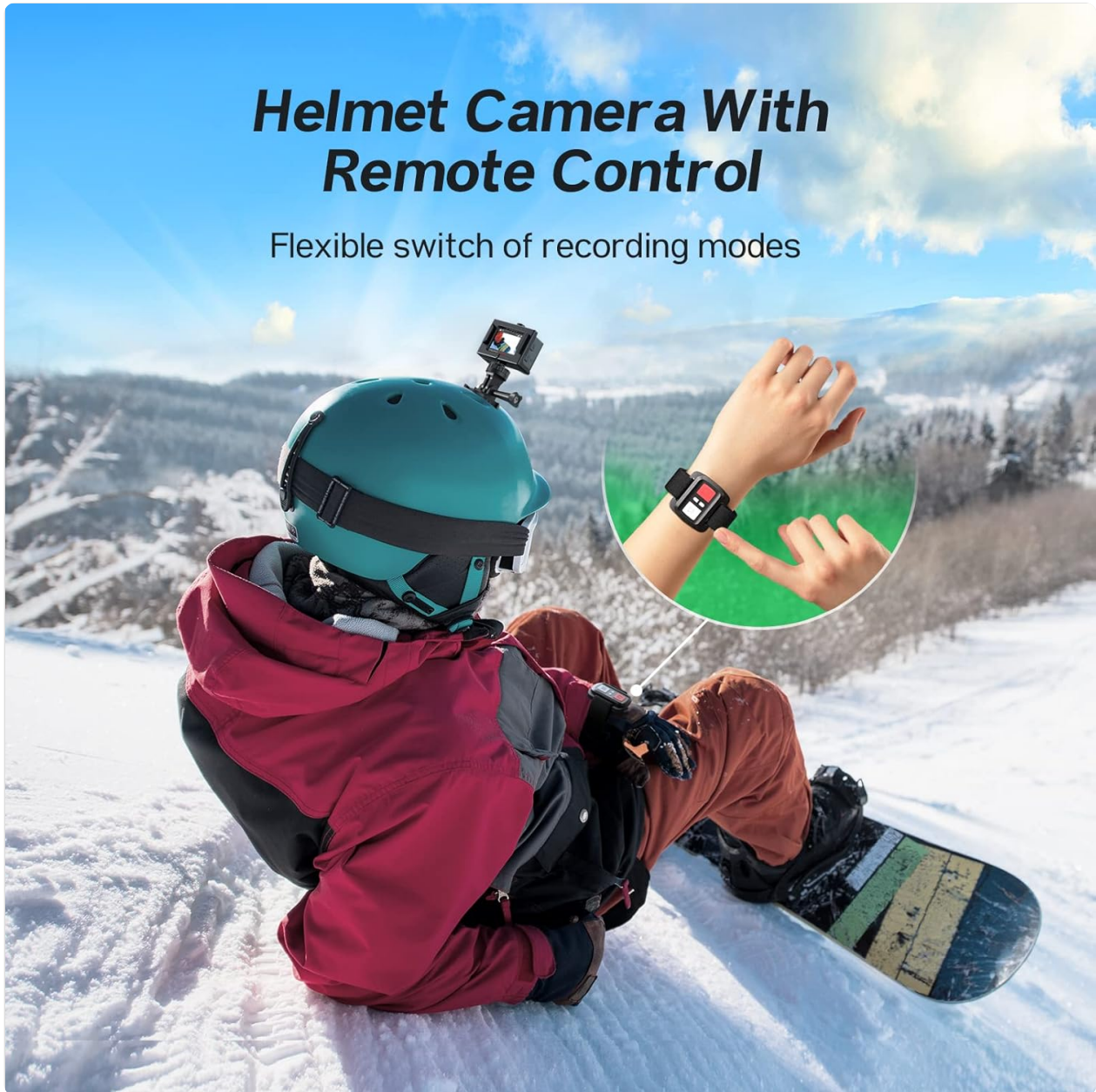
Image: A snowboarder with the Surfola SF230 Action Camera mounted on their helmet, illustrating its use as a helmet camera for winter sports.

The camera is designed for diverse activities, from water sports like swimming and diving (with waterproof case) to land-based adventures like cycling, hiking, and vlogging.