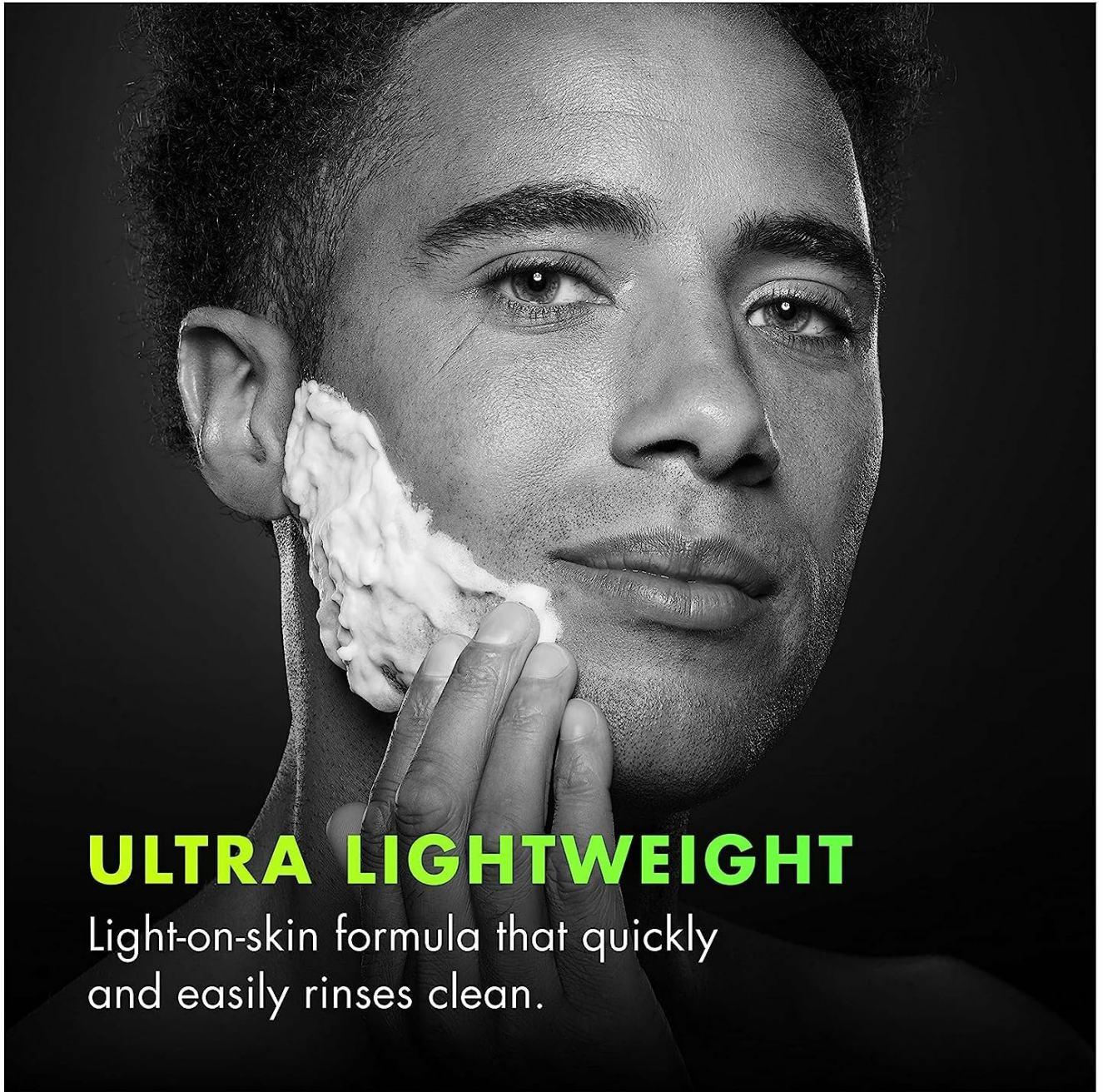
Image: Applying shave foam to the face.