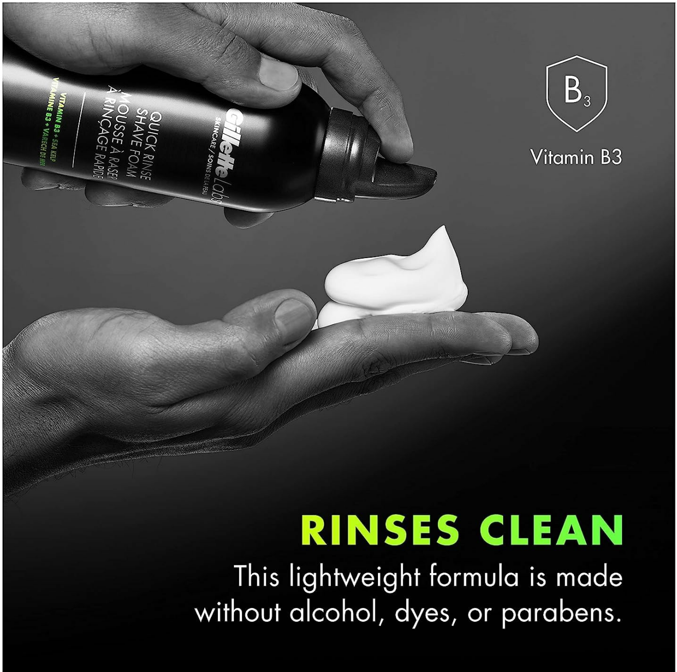
Image: Dispensing foam into hand.