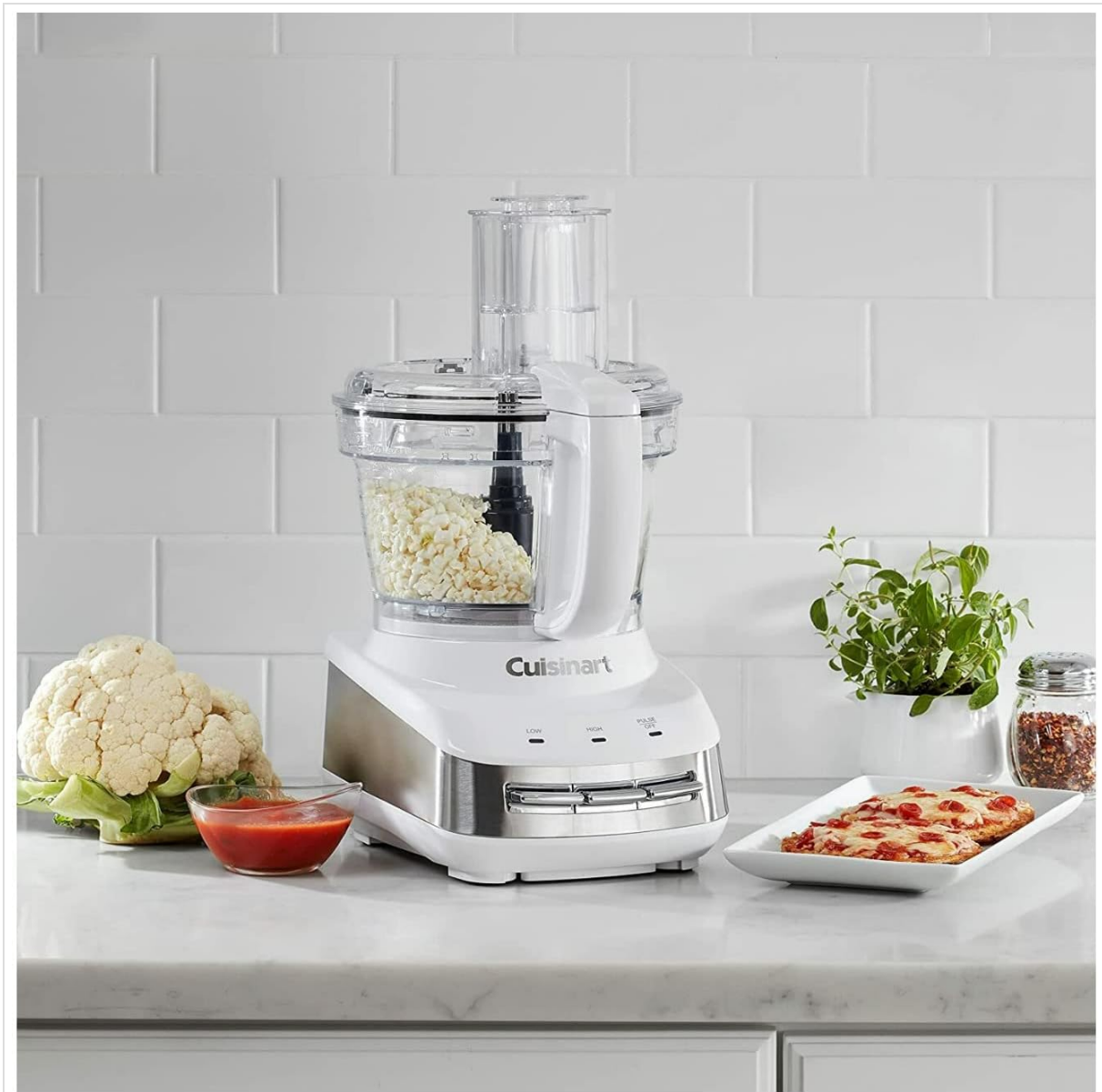
Image: The Cuisinart FP-110 Food Processor displayed in a kitchen setting with various food items and accessories, highlighting its versatility.