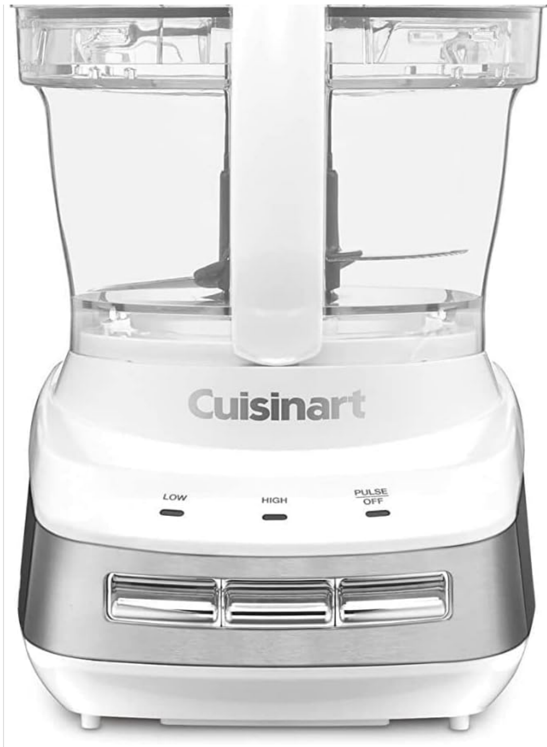
Image: Front view of the Cuisinart FP-110 Core Custom 10-Cup Food Processor in white and stainless steel.