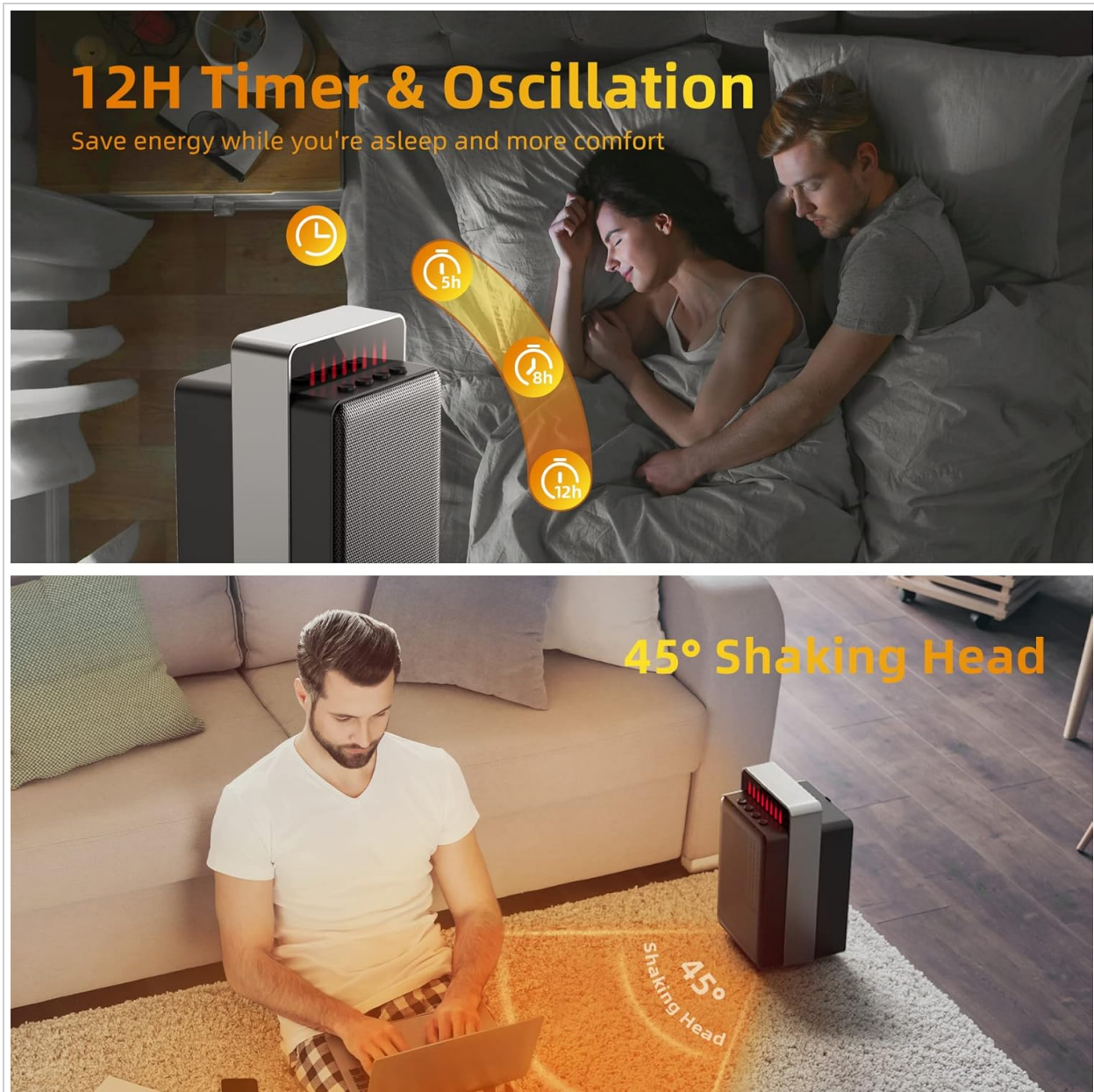
Figure 3.2: 12-hour timer and 45° oscillation feature.