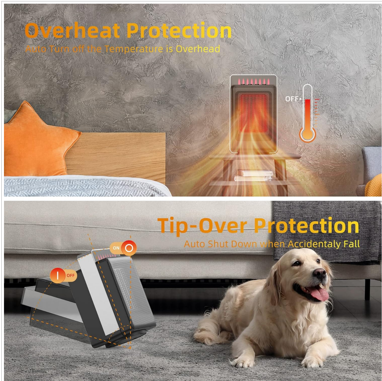
Figure 2.1: Overheat and Tip-Over Protection features.