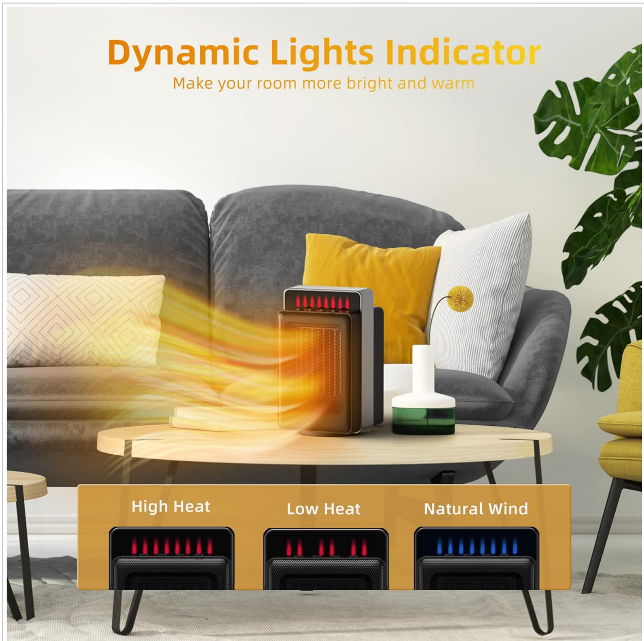
Figure 5.1: Dynamic light indicators for different modes.