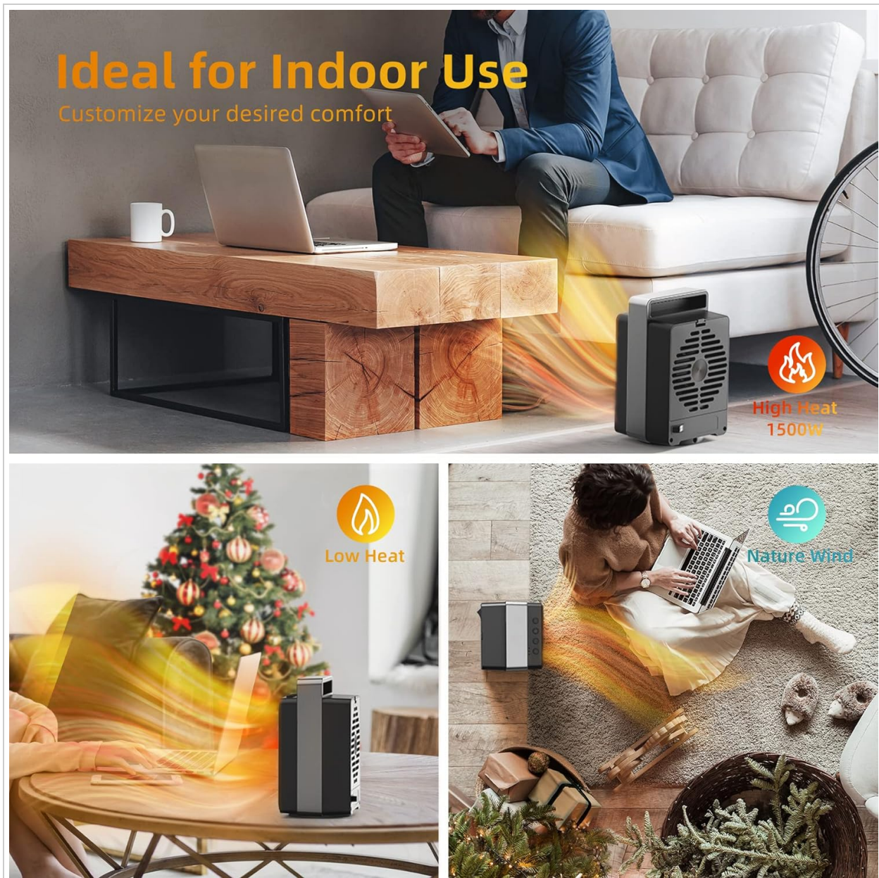
Figure 3.1: Heater modes for indoor use.