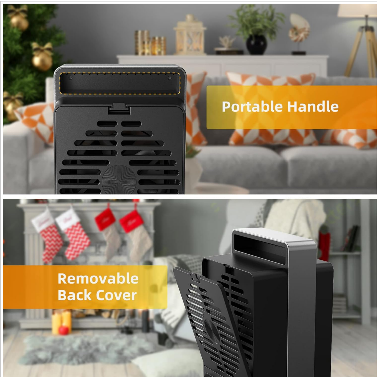
Figure 3.3: Portable handle and removable back cover.