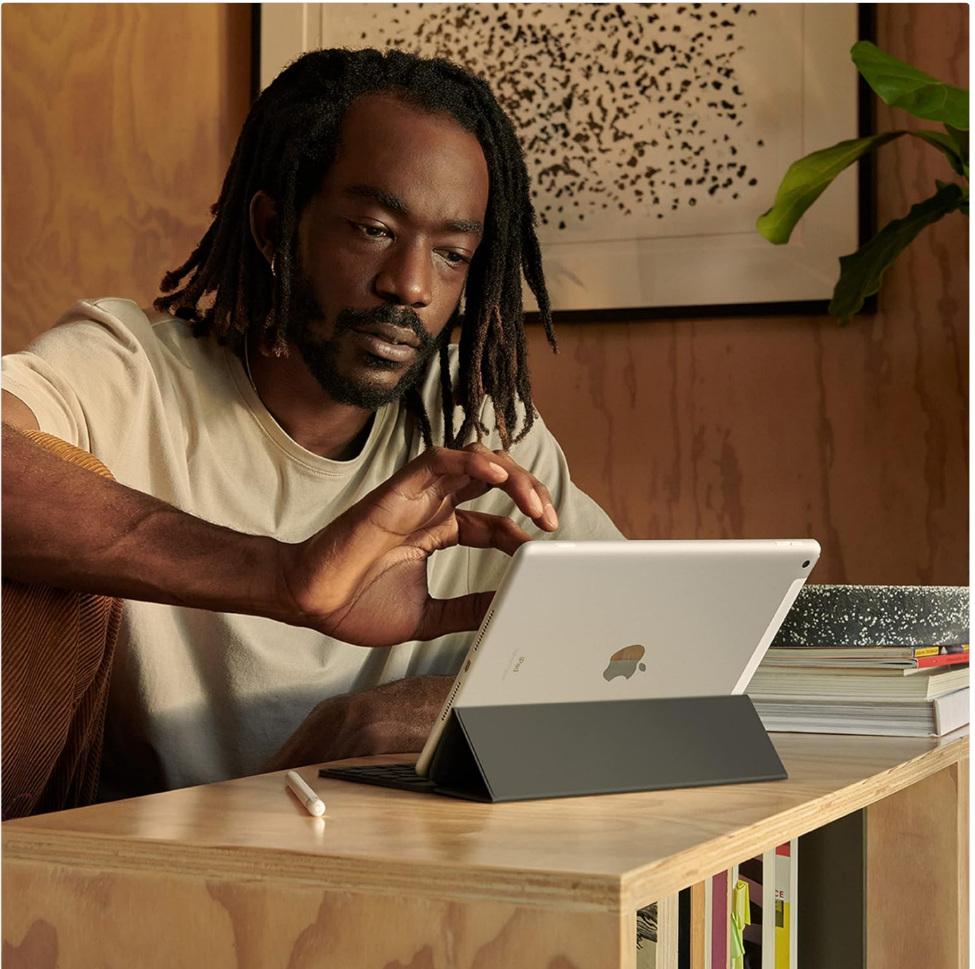
Image: A person using the Apple iPad (9th Generation) with a Smart Keyboard attached, demonstrating its use for productivity.