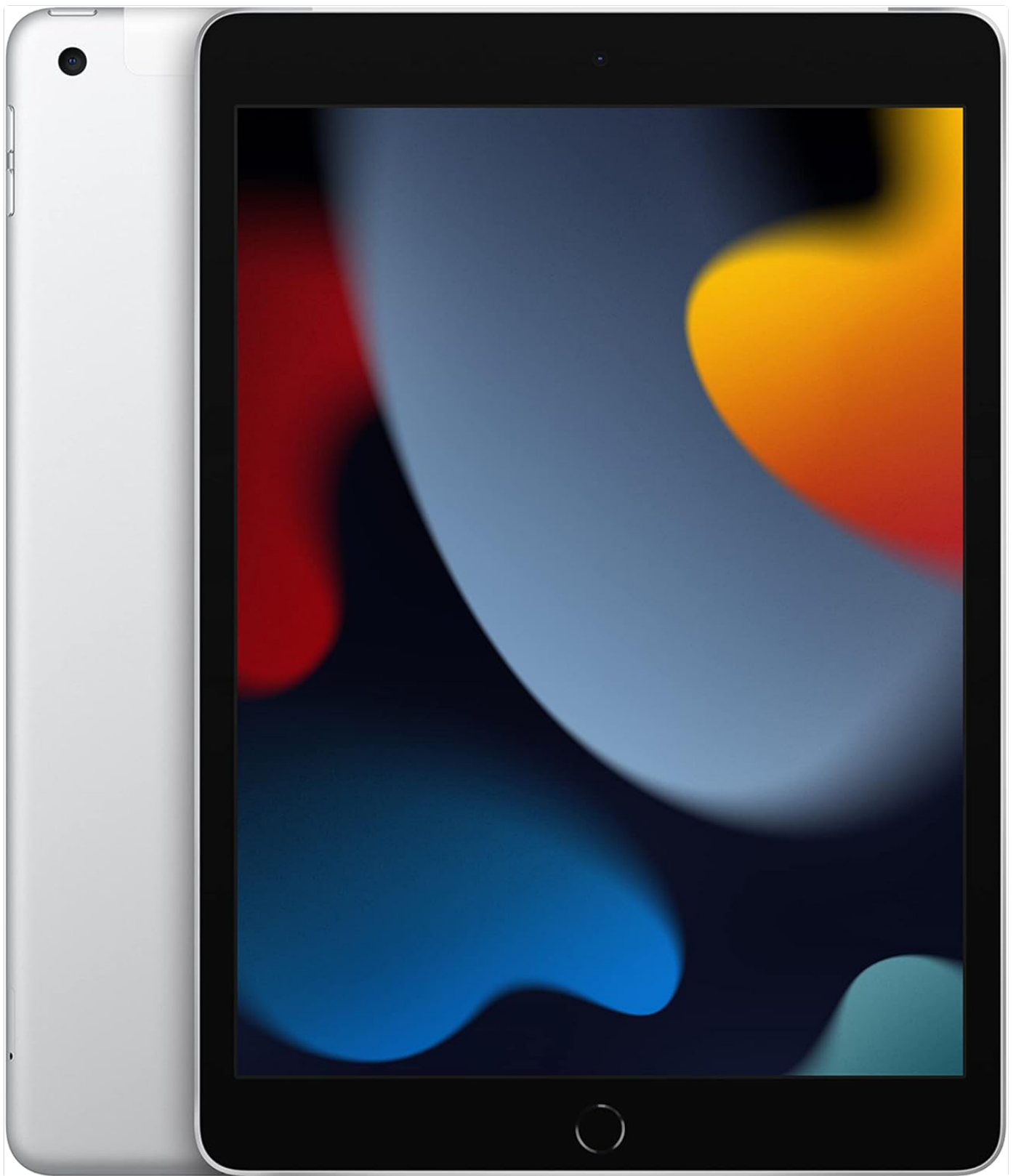
Image: Front view of the Apple iPad (9th Generation) displaying its screen, and a partial view of the back showing the silver casing and rear camera.