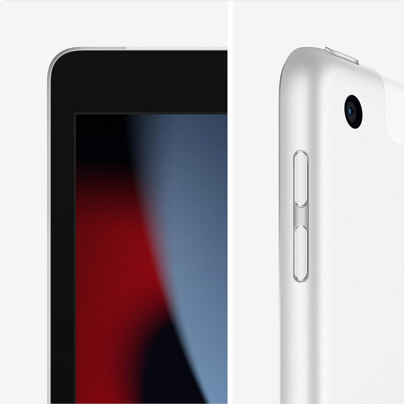
Image: Close-up detail of the top edge of the iPad, showing the rear camera lens and the power/sleep button.

Image: Angled view of the Apple iPad (9th Generation), highlighting the side profile with the volume buttons, power button, and cellular tray slot.