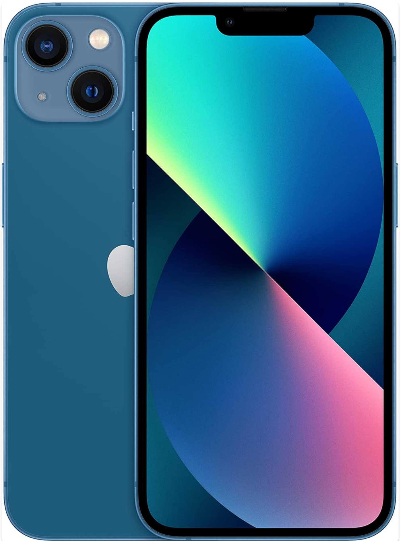
Image: Front and back view of the Apple iPhone 13 in Blue. This image showcases the device's sleek design and dual camera system.