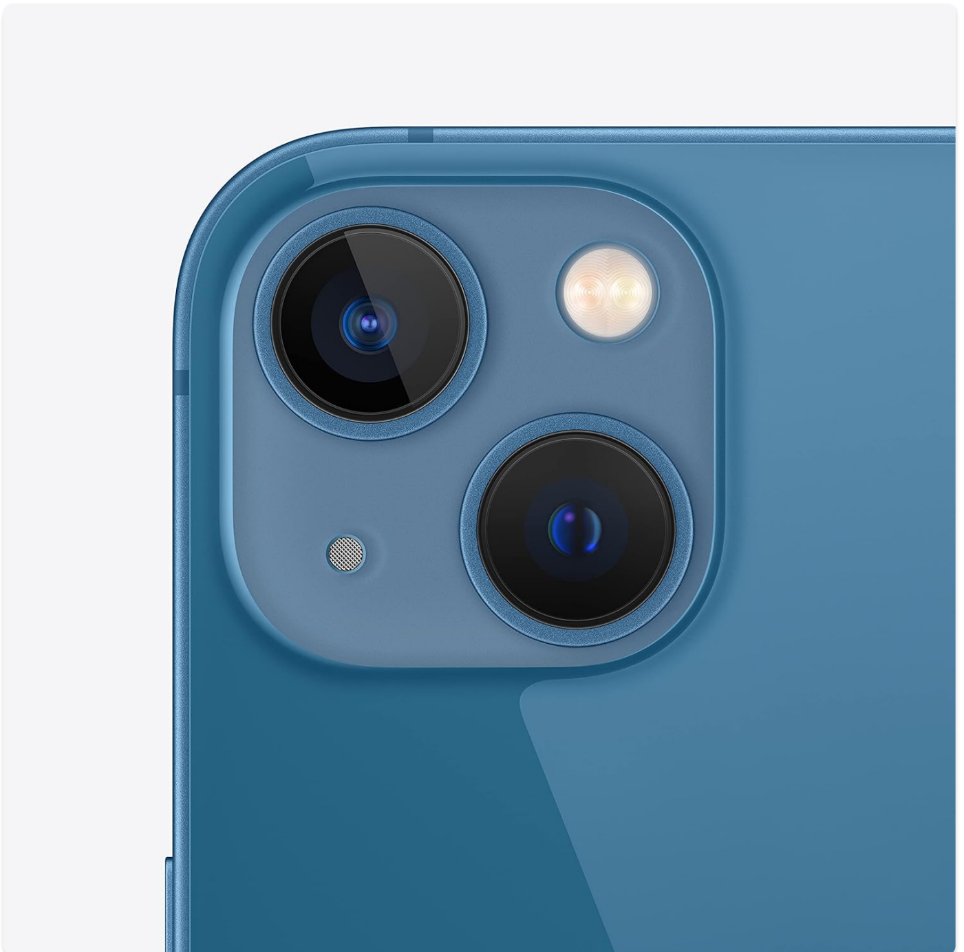
Image: Detailed close-up of the iPhone 13's dual camera system. This highlights the two lenses and flash, emphasizing the advanced photographic capabilities.