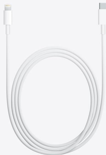
USB-C to Lightning Cable

Image: Contents of the iPhone 13 box, showing the iPhone and USB-C to Lightning Cable. This illustrates what users should expect to find when opening their new device.