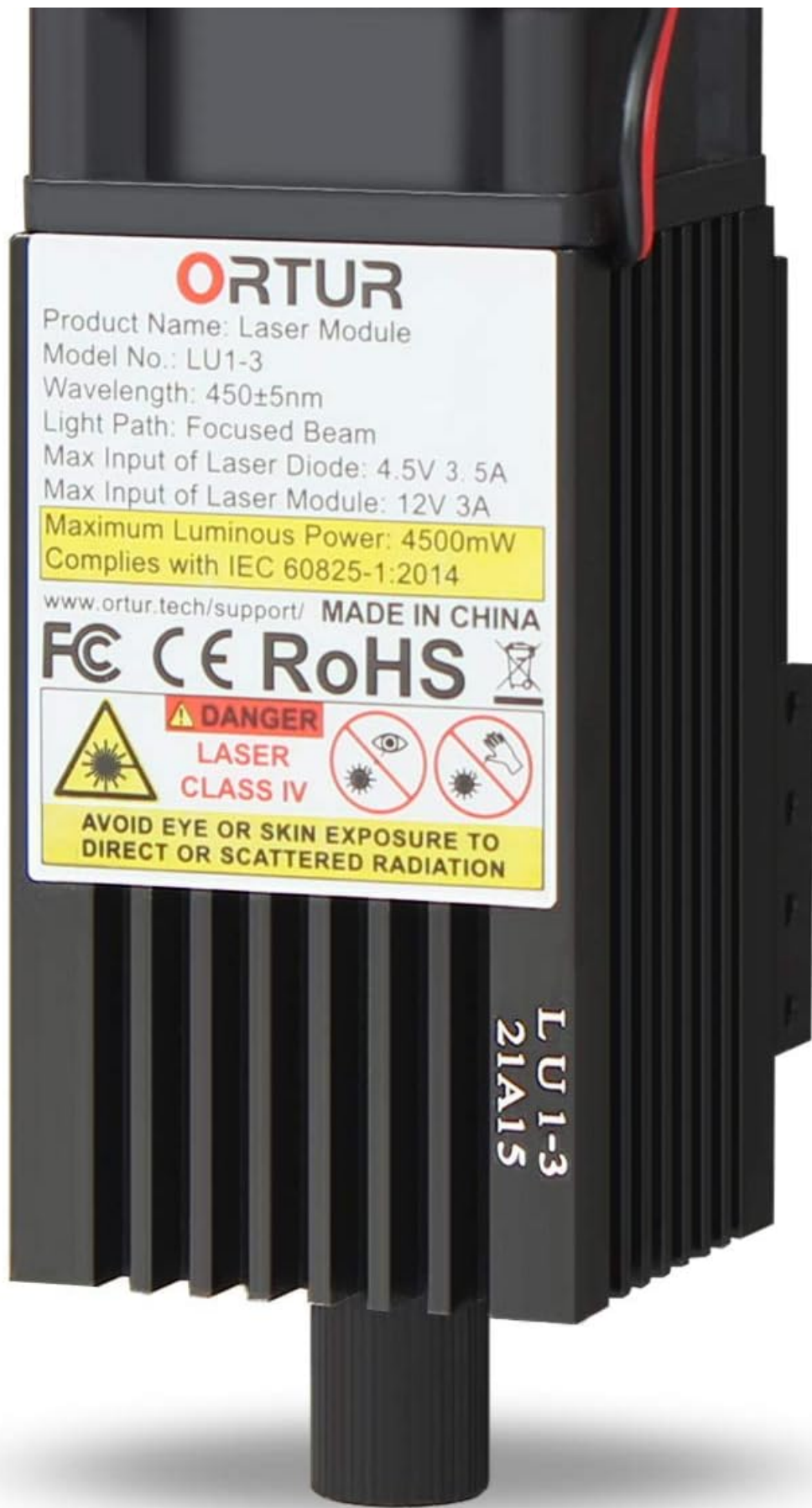
Image: The Ortur LU1-3 laser module, showing its fixed focus design and key specifications such as wavelength and power output.