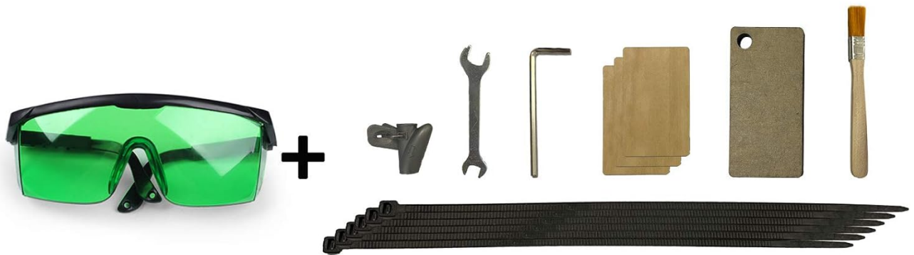
Image: The Ortur Laser Master 2 laser engraving machine, showcasing its main components and included accessories such as safety glasses, wrenches, and material samples.