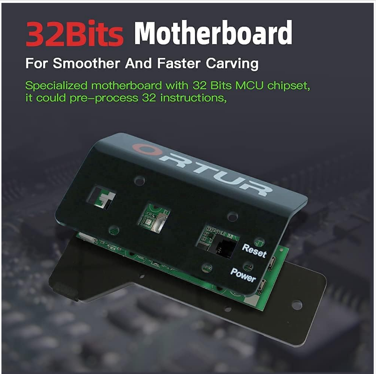
Image: A close-up view of the Ortur 32-bit motherboard, highlighting its advanced processing capabilities for smoother and faster carving.

Specialized motherboard with 32 Bits MCU chipset, it could pre-process 32 instructions,