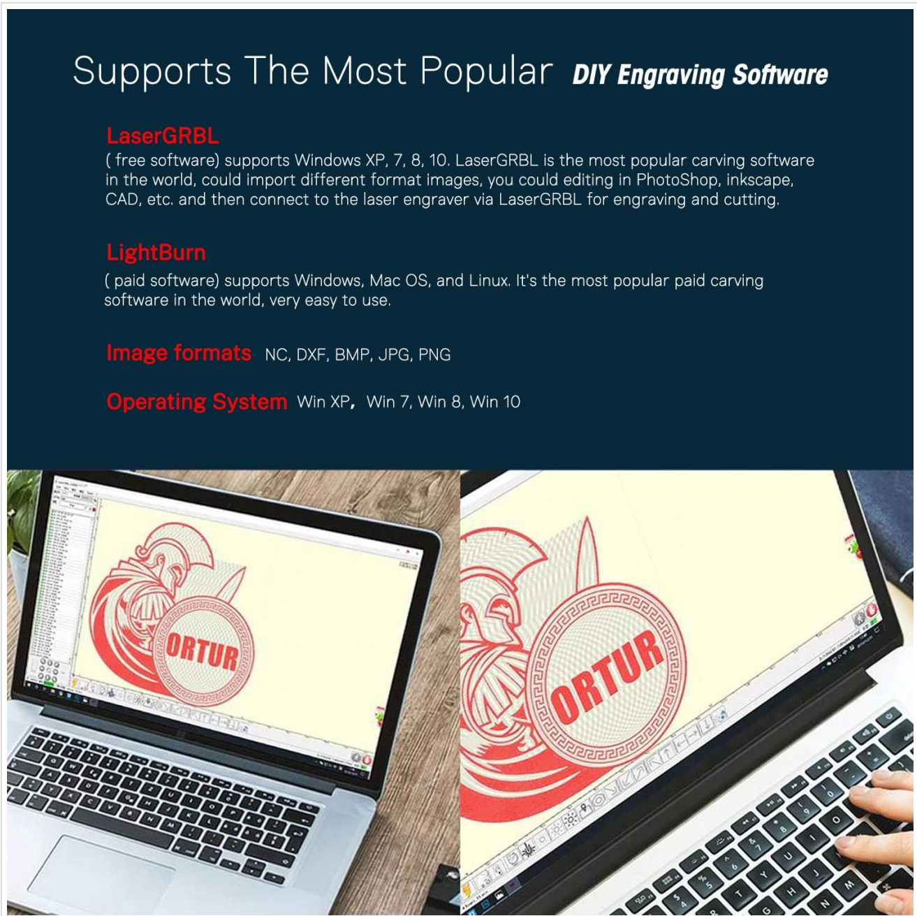
Image: Displays the user interfaces of LaserGRBL and LightBurn, two popular software options compatible with the Ortur Laser Master 2.

The Ortur Laser Master 2 supports widely used engraving software. It is recommended to use either LaserGRBL (free) or LightBurn (paid).