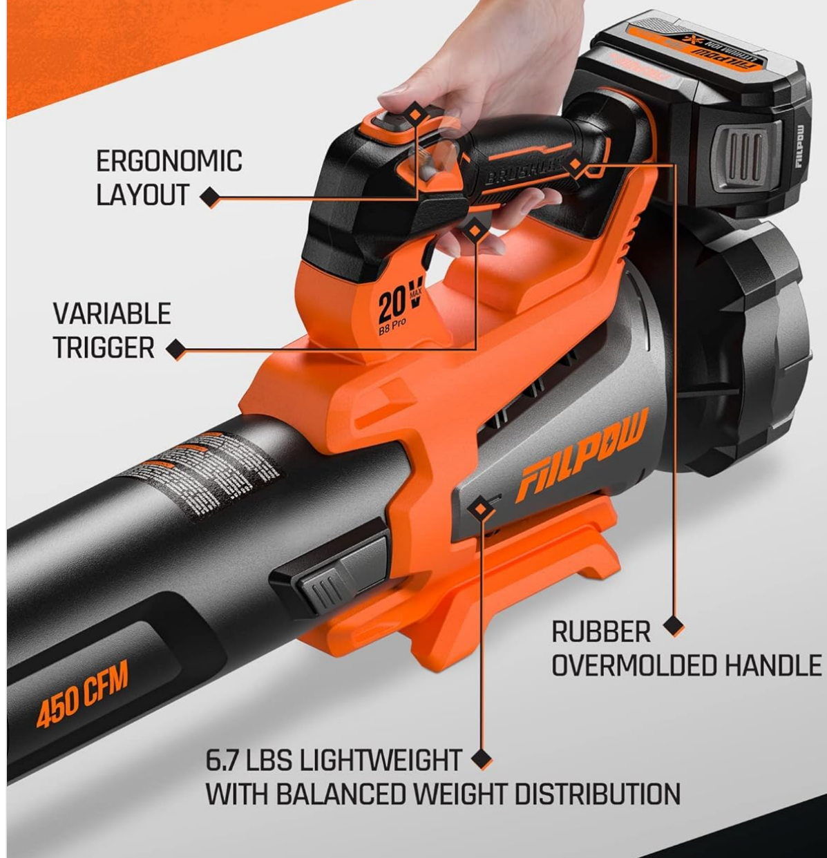
Image: Illustration of the blower's ergonomic layout, rubber overmolded handle, and variable trigger for easy control.