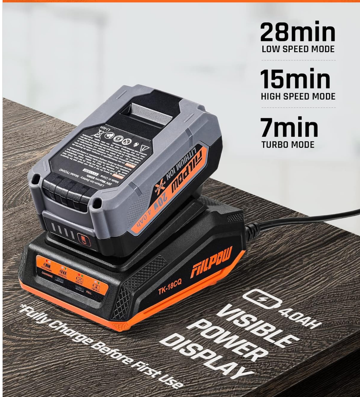
Image: The 4.0AH battery and charger, showing the LED power display. Fully charge before first use.