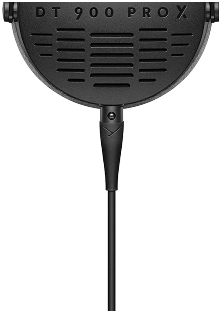
Image: The DT 900 PRO X headphones showcasing the detachable cable and adapter for versatile connectivity.

Your browser does not support the video tag.