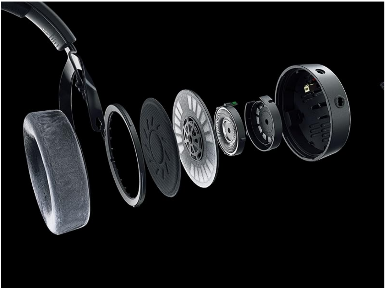
Image: An exploded view of the DT 900 PRO X headphones, illustrating their modular and serviceable design.