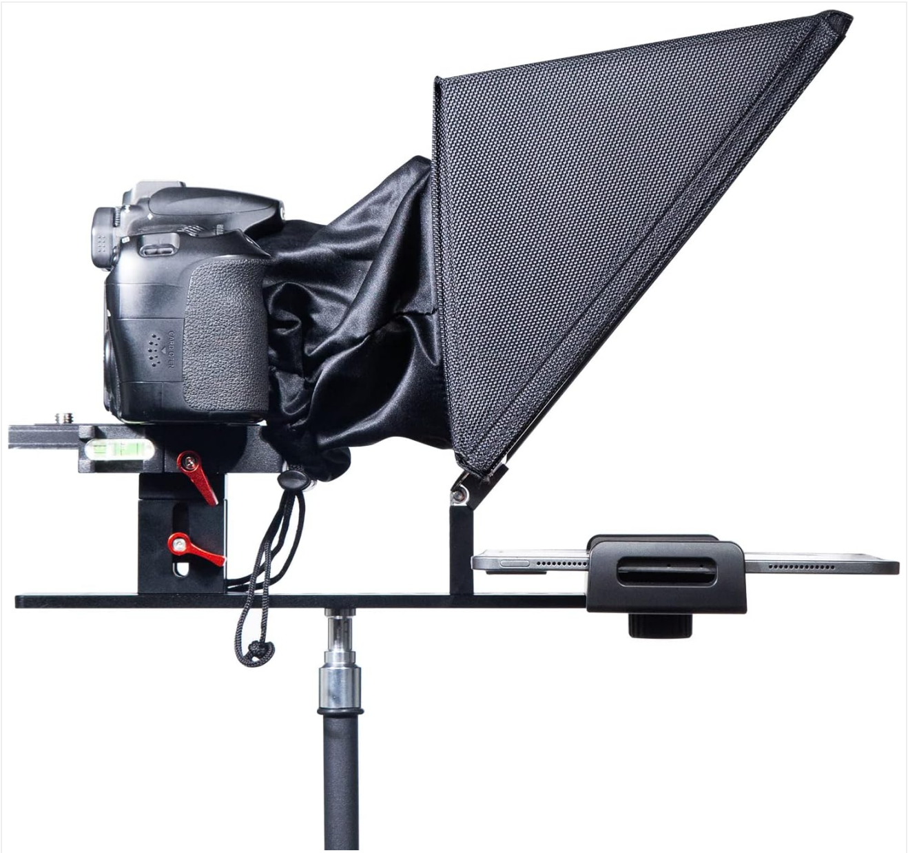
Image: Side view of the Desview T12 teleprompter, illustrating how a camera is mounted and positioned to record through the teleprompter's glass.

Mount your DSLR or mirrorless camera onto the camera mounting plate. Ensure the lens is positioned correctly to shoot through the teleprompter's glass. Adjust the camera's position to prevent vignetting.