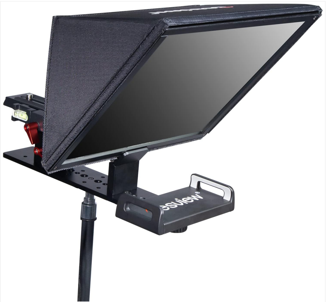
Image: Front view of the Desview T12 teleprompter, demonstrating the clarity of the 70/30 beam splitter glass and how the tablet's screen content is reflected for the presenter to read.