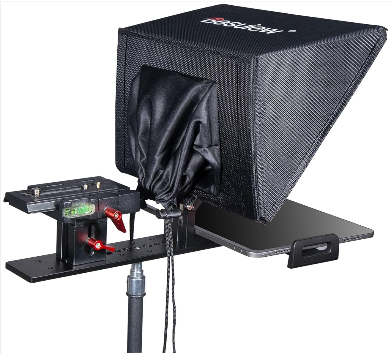
Image: Top-down perspective of the Desview T12 teleprompter, highlighting the camera mounting area and the adjustable tray designed to securely hold a tablet or smartphone.