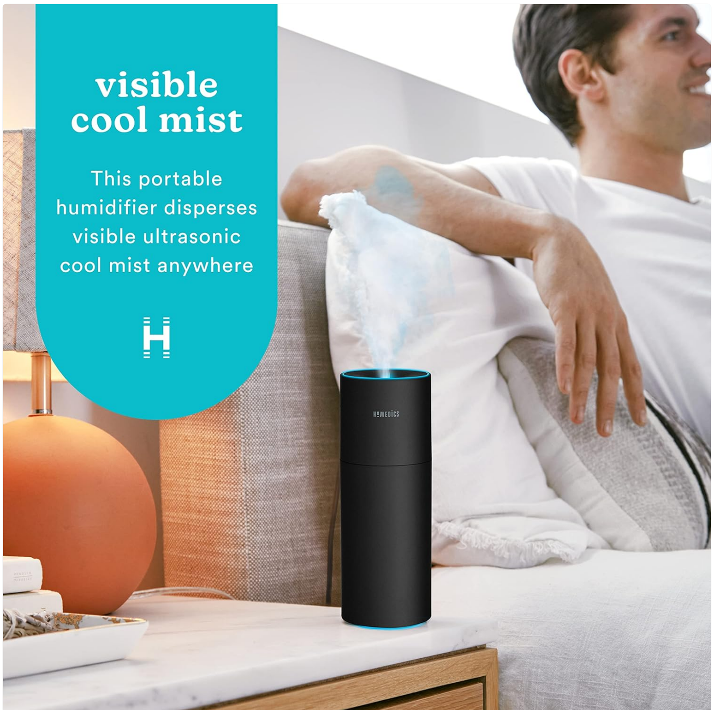
Figure 3: The humidifier dispersing visible cool mist, ideal for personal spaces.