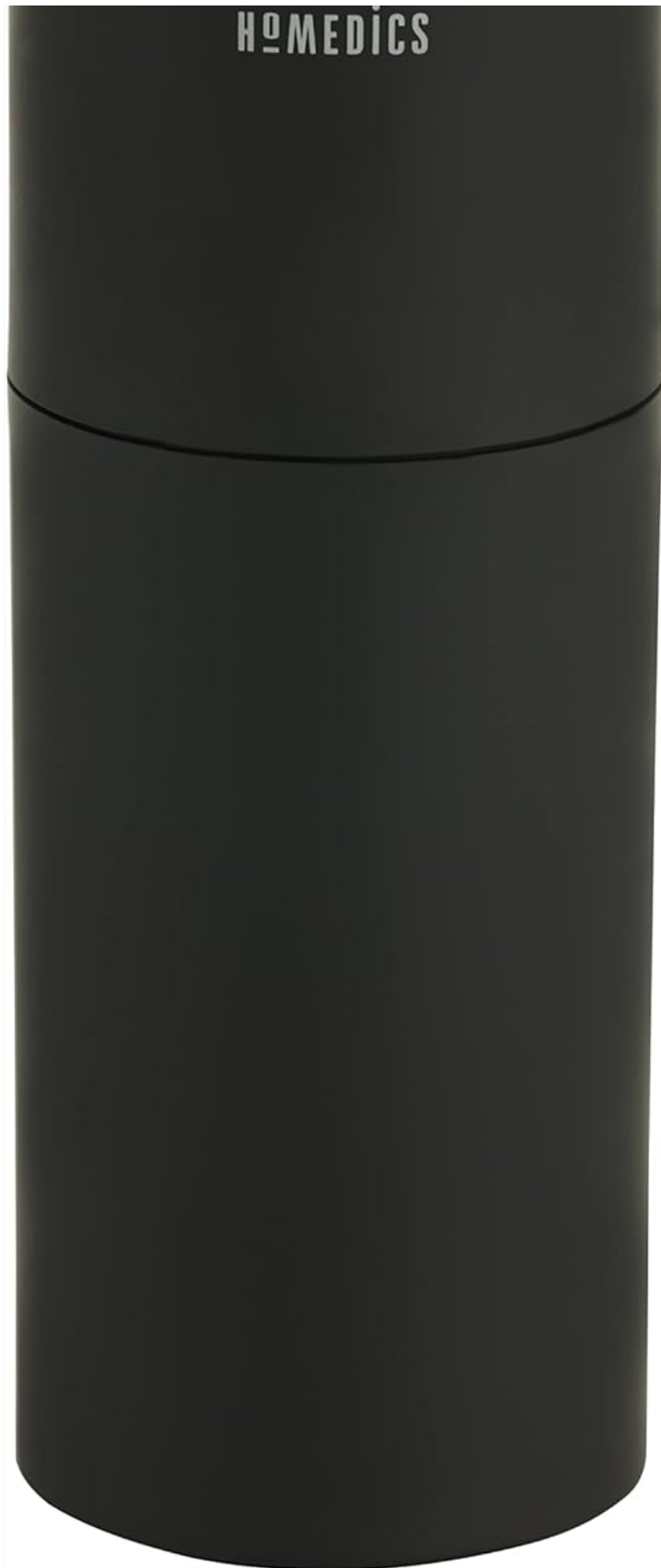
Figure 1: The HoMedics TotalComfort Portable Ultrasonic Humidifier in its sleek black design.