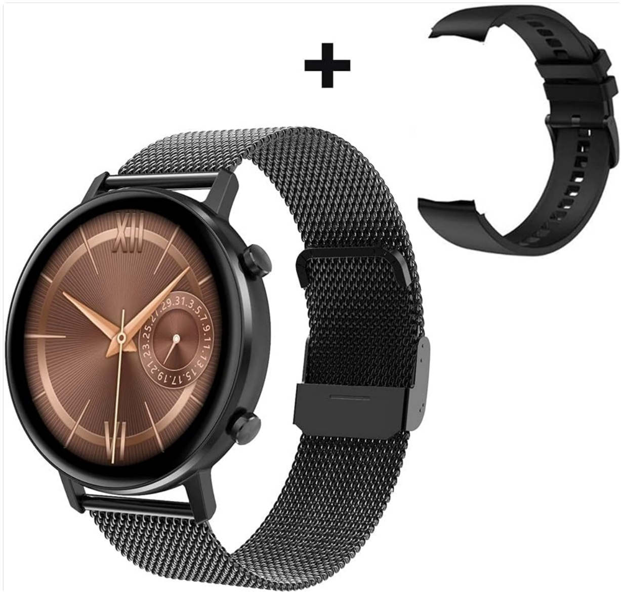
Image: The DT96 Smartwatch unit shown with both the included stainless steel mesh strap and an additional black silicone strap.