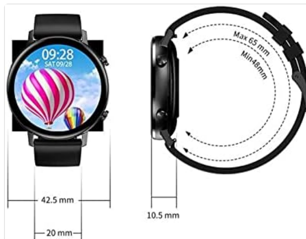
Image: Technical diagram illustrating the dimensions of the DT96 Smartwatch, including watch face diameter, thickness, strap width, and recommended wrist circumference.