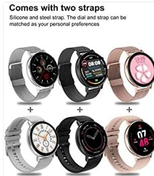
Image: Examples of the DT96 Smartwatch fitted with different strap types, including silicone and steel, demonstrating customization options.