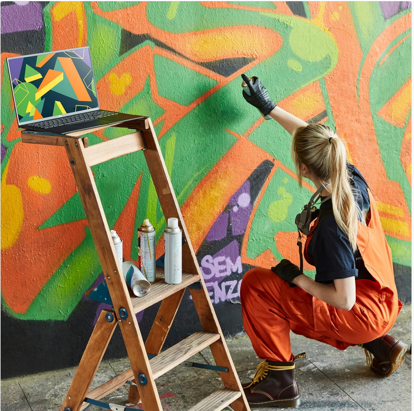
Figure 9: Intel Evo platform ensures responsive performance and long battery life.