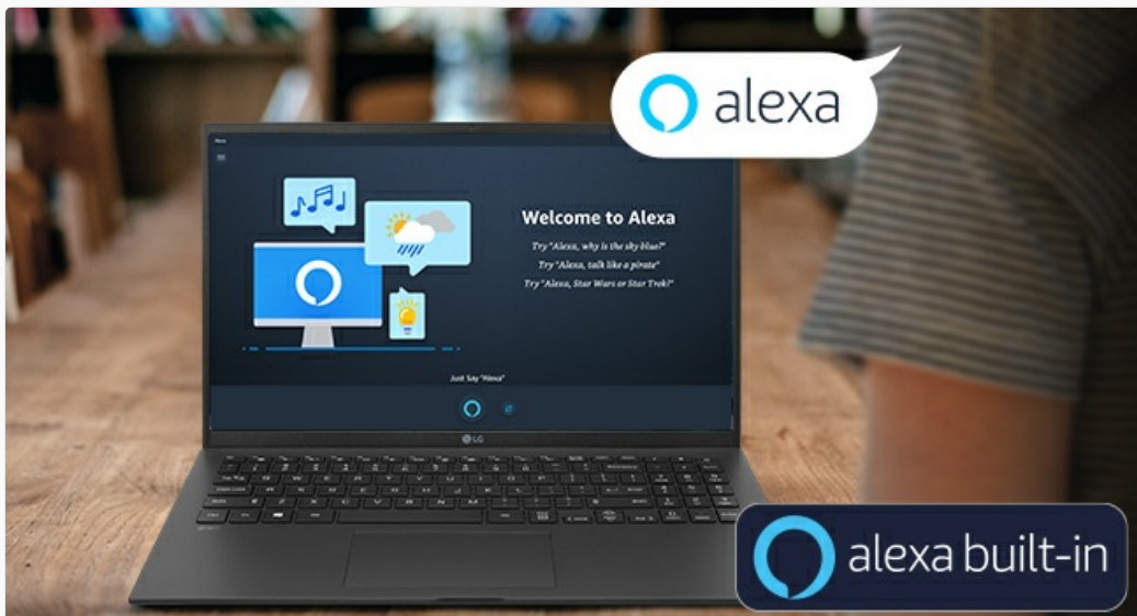
Figure 5: Alexa Built-in feature on the LG gram laptop.

The laptop also features Alexa Built-in. During setup, you may be prompted to configure Alexa for voice commands and smart home integration.