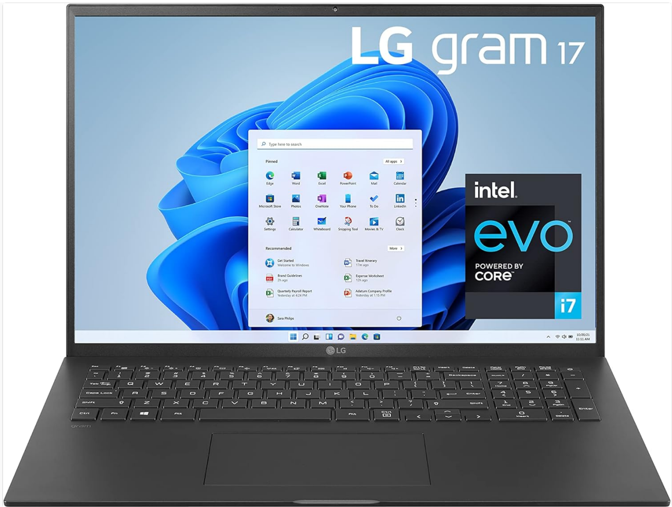
Figure 1: LG gram 17Z95P Laptop. Ensure the power cord is securely connected to the laptop and a wall outlet.