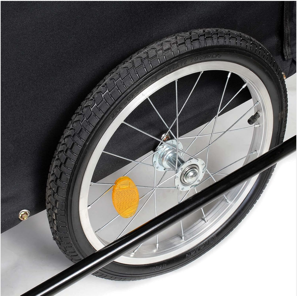
Image: Detail of the wheel assembly, showing the tire and yellow reflector.