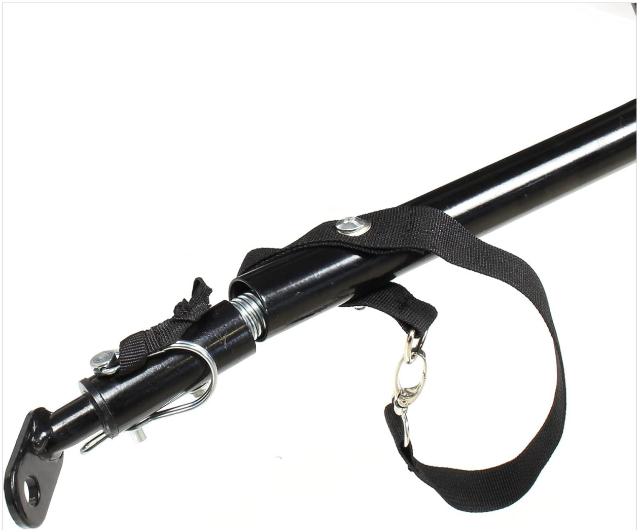
Image: Detail of the drawbar and quick coupling attachment point.