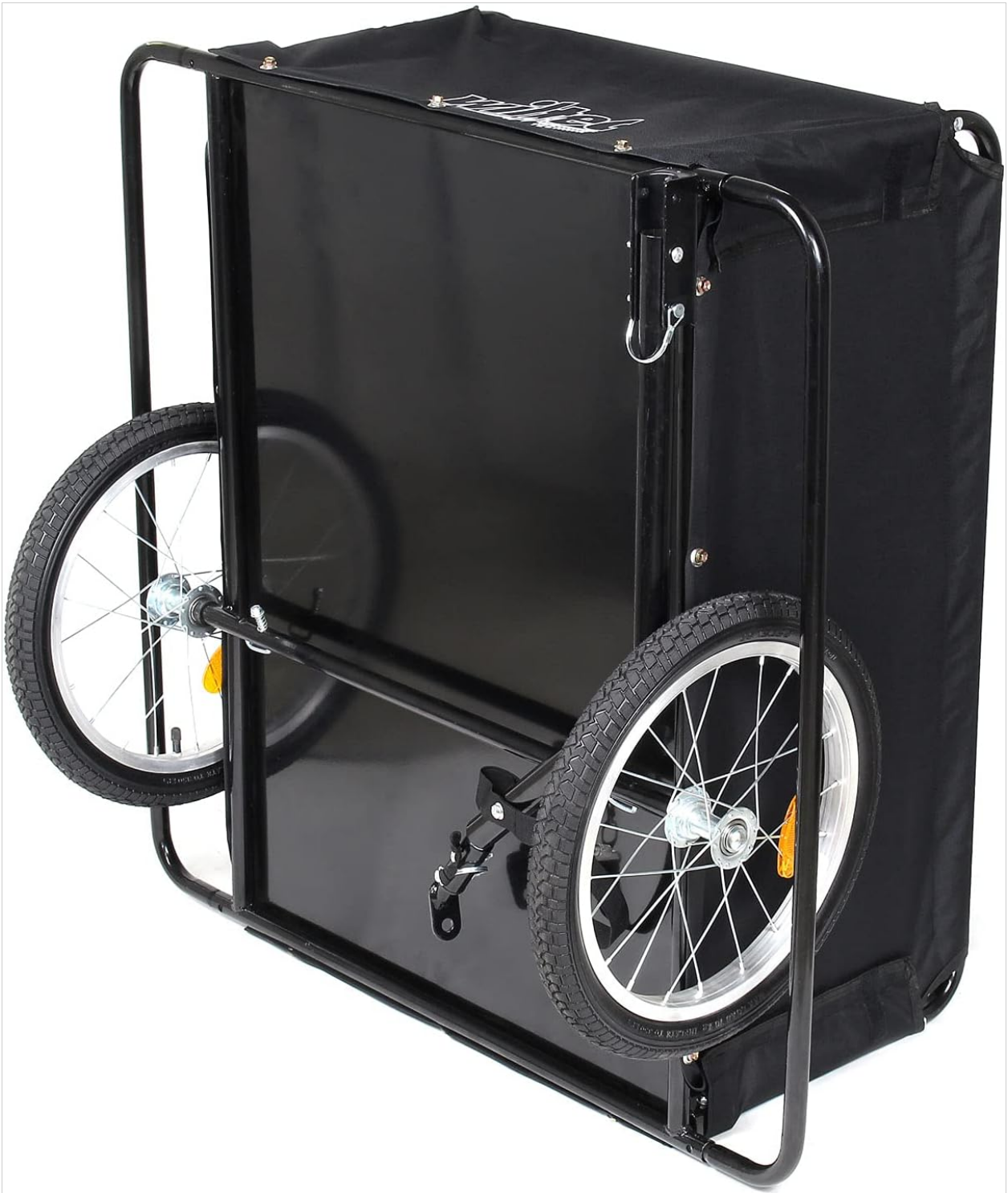
Image: The trailer shown in a compact, folded configuration for storage.