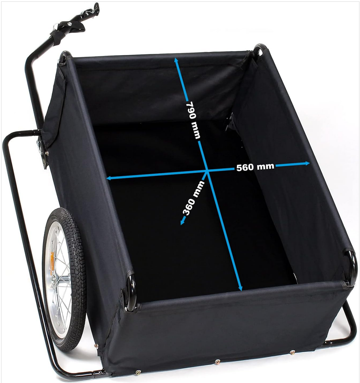
Image: Interior view of the cargo area with approximate dimensions for loading.