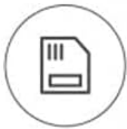
Micro SD Card

In addition to support micro SD card local storage and NAS storage but also added a cloud storage function, after opening the mobile detection from start to finish video stored in the cloud, support for real-time sharing between family and friends, share funny pictures of pets