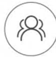
Share With Friend