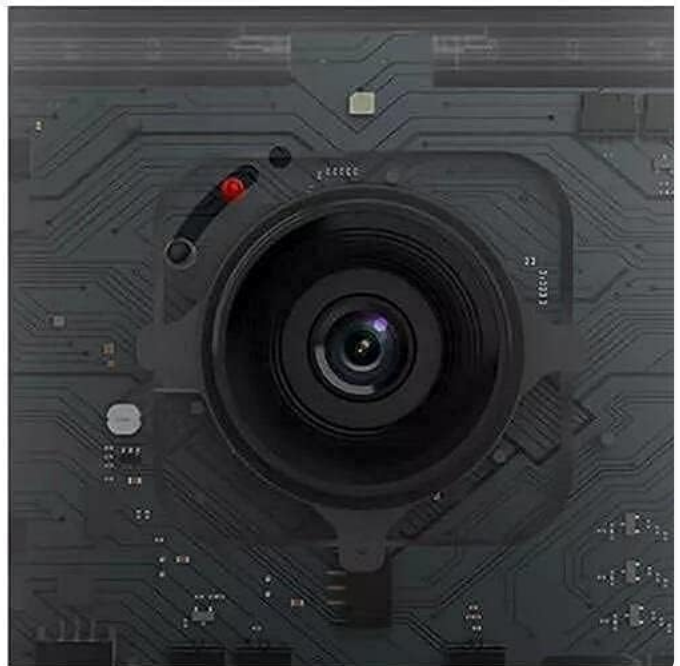
Image: Details of the hidden speaker and HD camera.