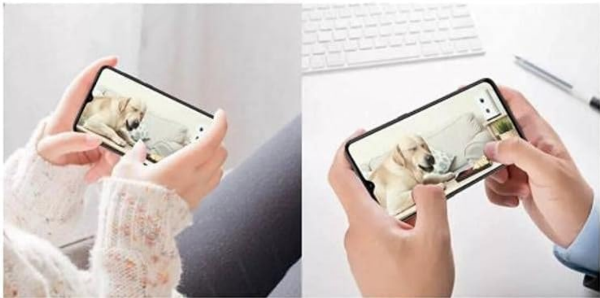
Image: Cloud storage and sharing features.