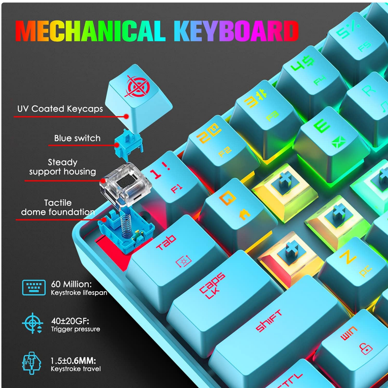
An exploded view illustrating the components of a mechanical blue switch, including the UV coated keycap, steady support housing, and tactile dome foundation.