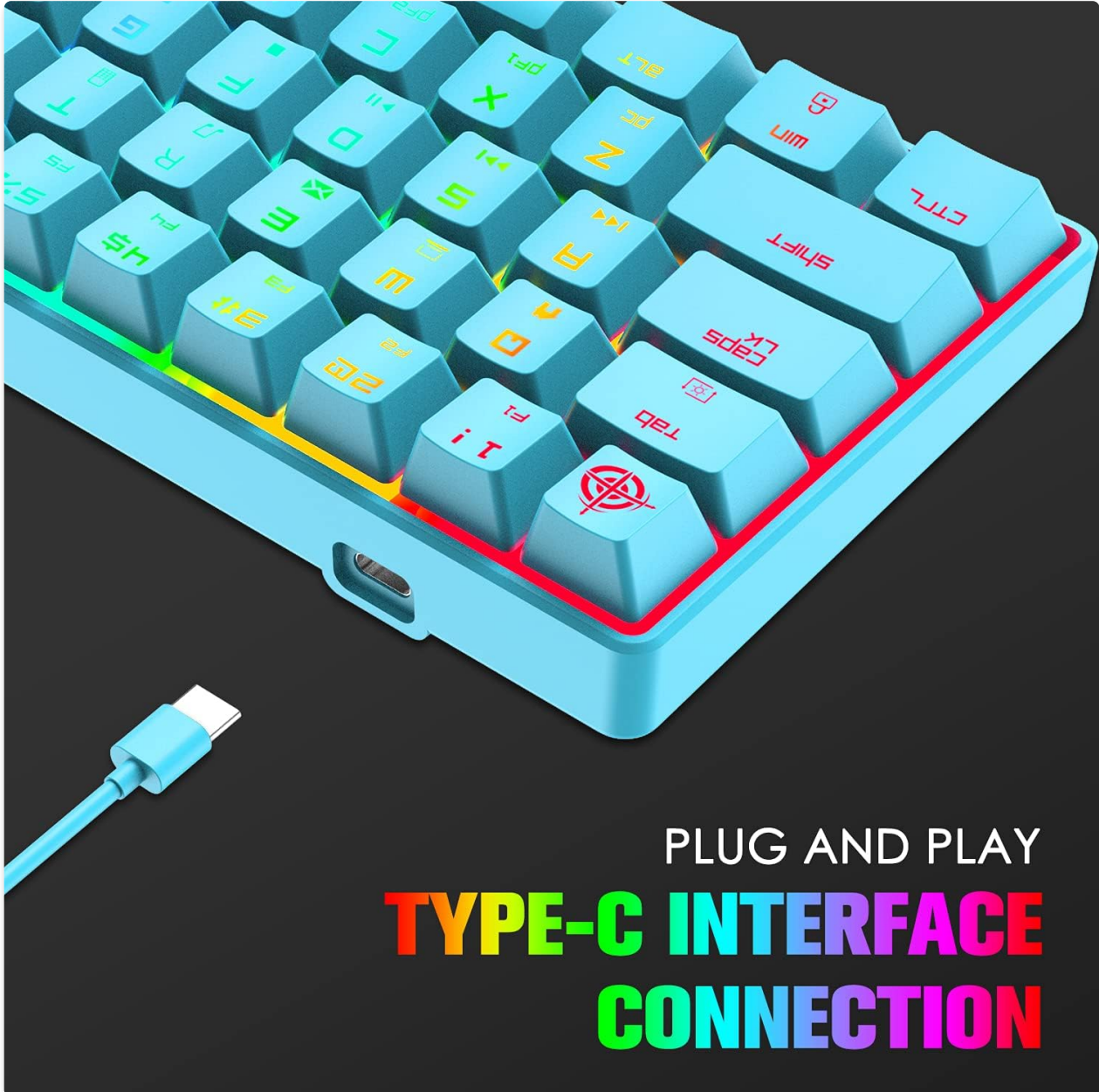
Image showing the USB Type-C port on the keyboard and the detachable cable, highlighting the plug-and-play connection.