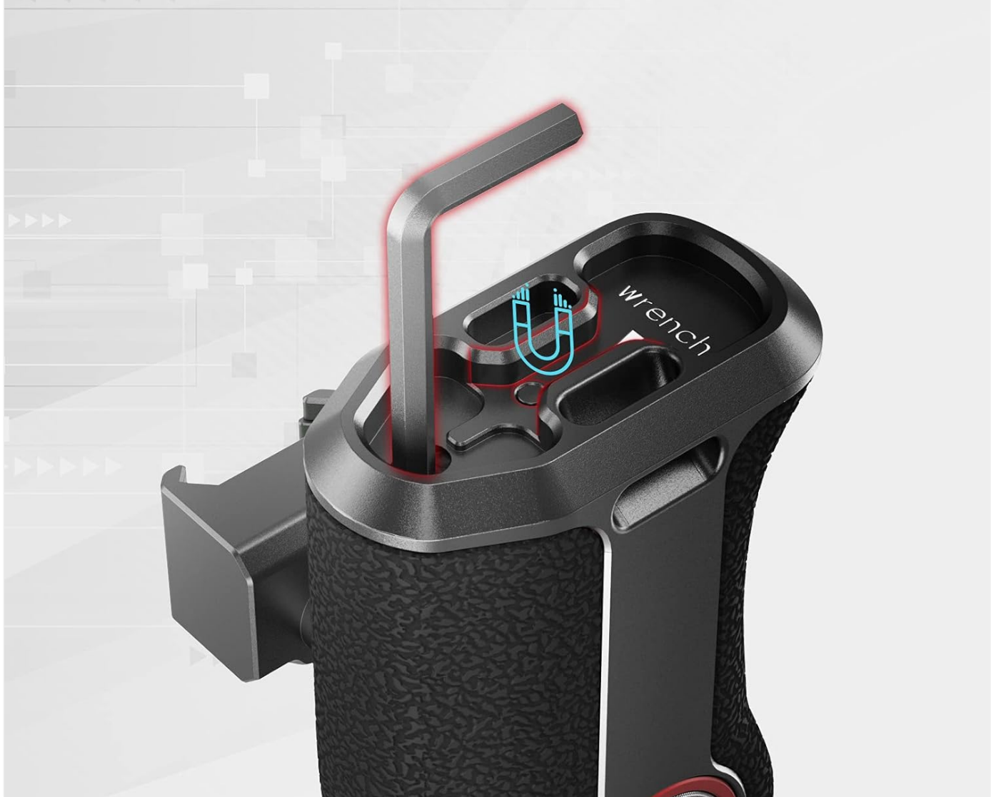
Image: The SmallRig 3260 NATO Handle featuring a built-in magnetic hex wrench at the bottom for convenient adjustments and maintenance.

Built-in magnetic spanner at the bottom for always-ready use and anti-lose