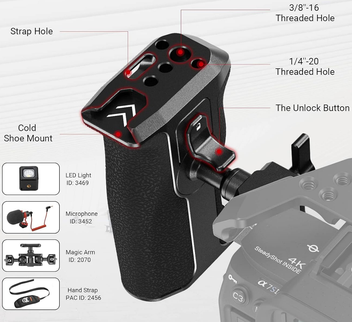
Image: Close-up of the SmallRig 3260 NATO Handle showing the 1/4"-20 and 3/8"-16 threaded holes, cold shoe mount, and strap holes for accessory attachment.