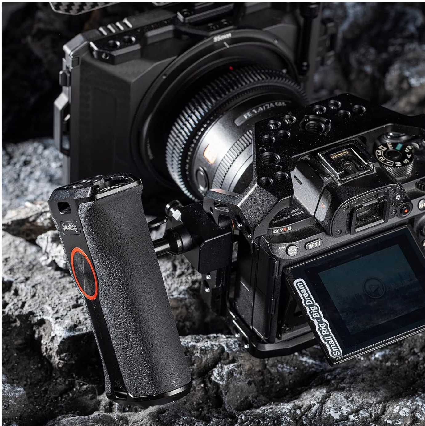
Image: SmallRig 3260 NATO Handle attached to a camera cage, showcasing its ergonomic design and integration with camera equipment.