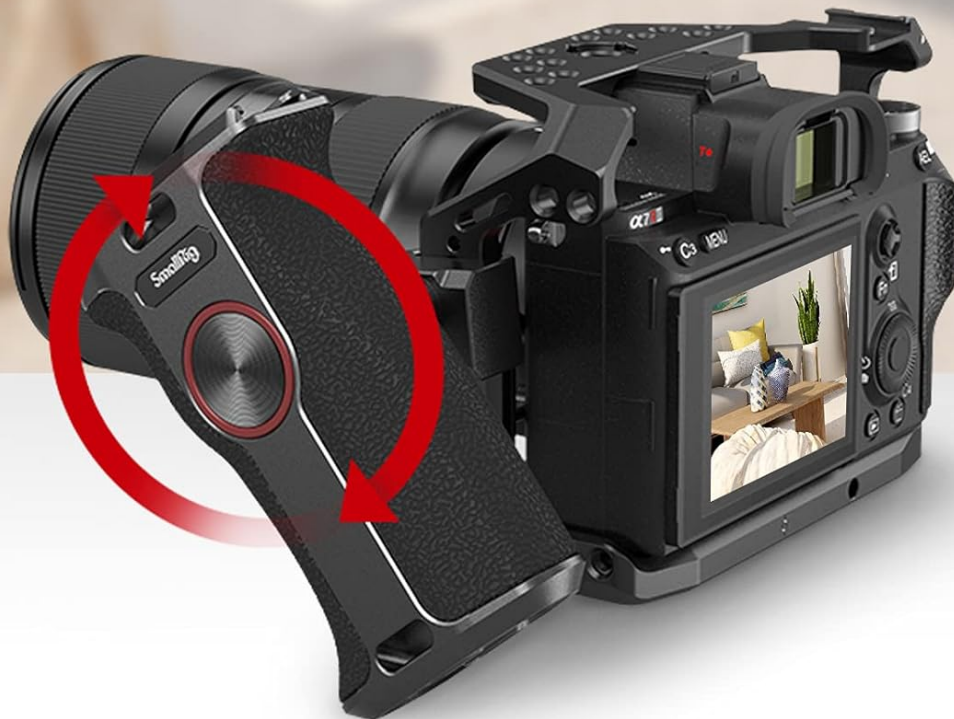
Image: Demonstrates the 360-degree adjustment feature of the SmallRig 3260 NATO Handle by pressing the unlock button.