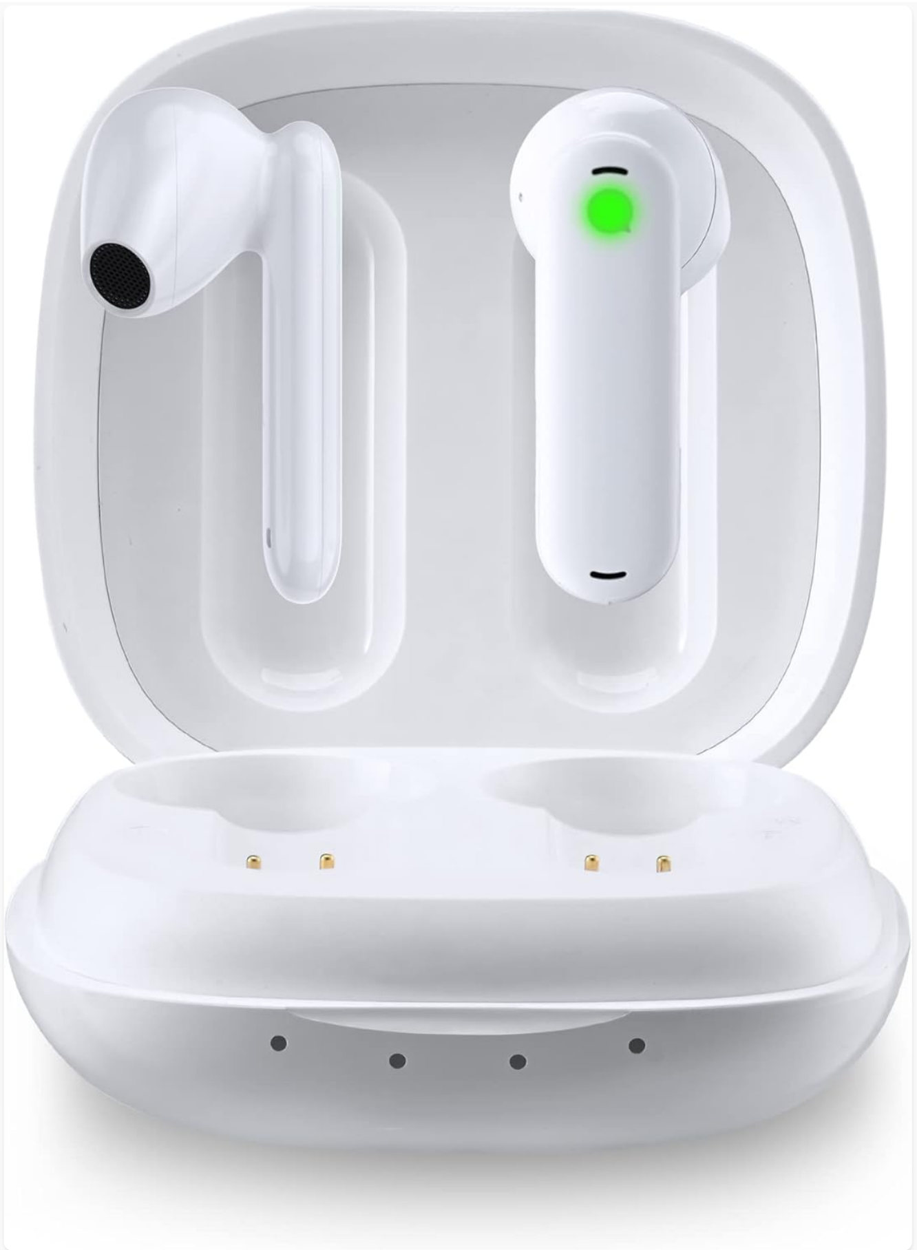
Image: The Timekettle WT2 Edge W3 translator earbuds resting in their open charging case. One earbud shows a green indicator light, signifying power or charging status.