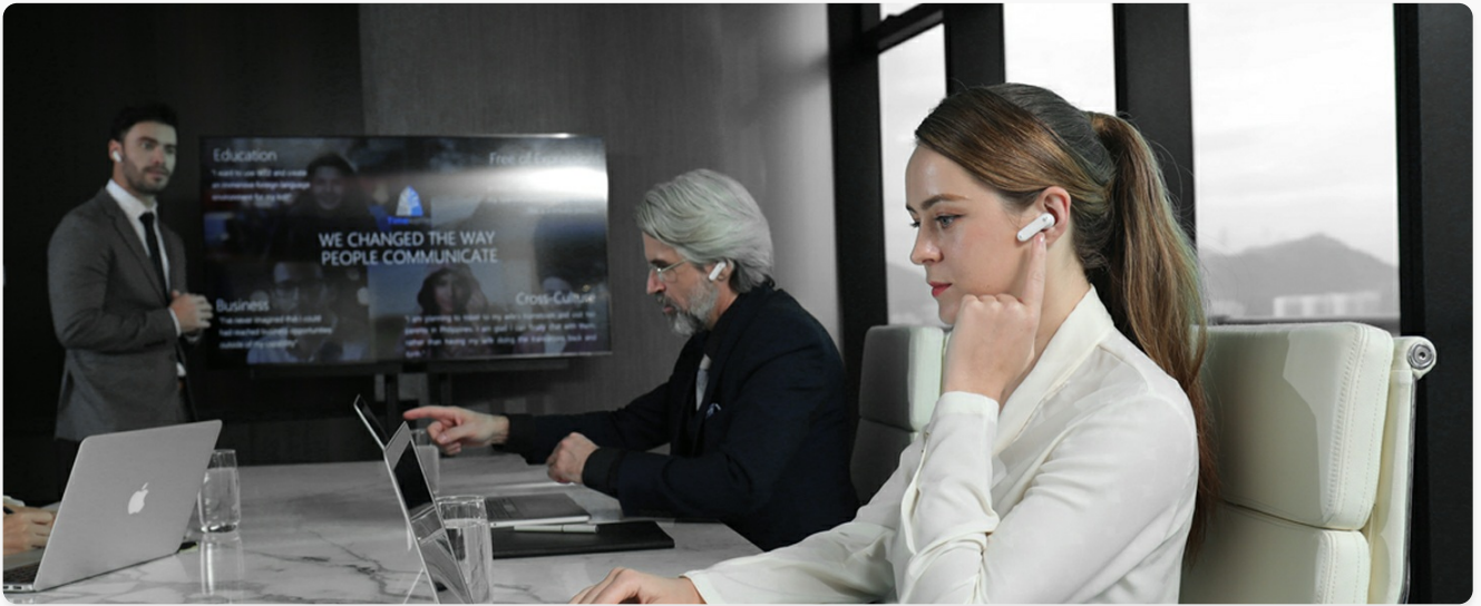
Image: Two men in business attire, each wearing a Timekettle earbud, engaged in a conversation, demonstrating the simultaneous translation capability.