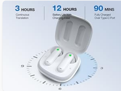
Image: An illustration showing the Timekettle WT2 Edge W3 charging case with earbuds, indicating 3 hours continuous translation, 12 hours with charging case, and 90 minutes for full charge.