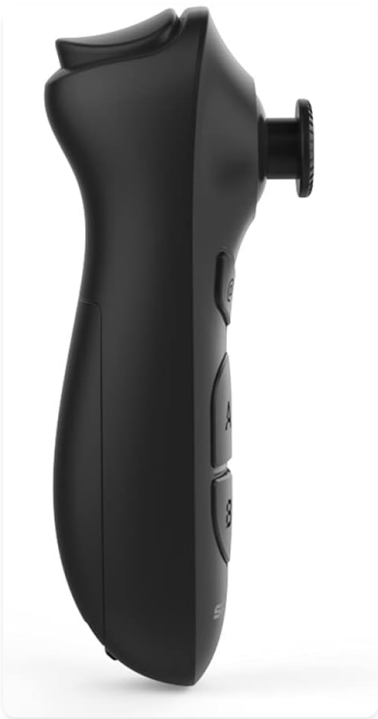
Side view of the remote control.