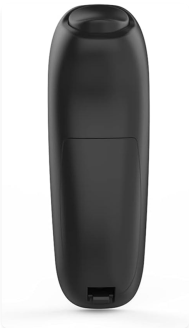
Back view of the remote control, indicating the battery compartment.