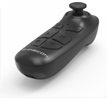
Top view of the remote control with joystick and action buttons.