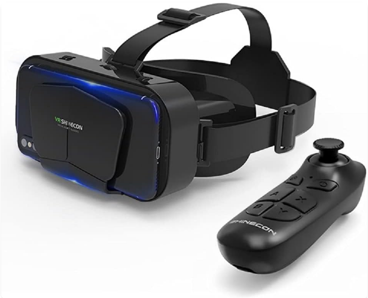
The BASERY VR Headset and its accompanying remote control.