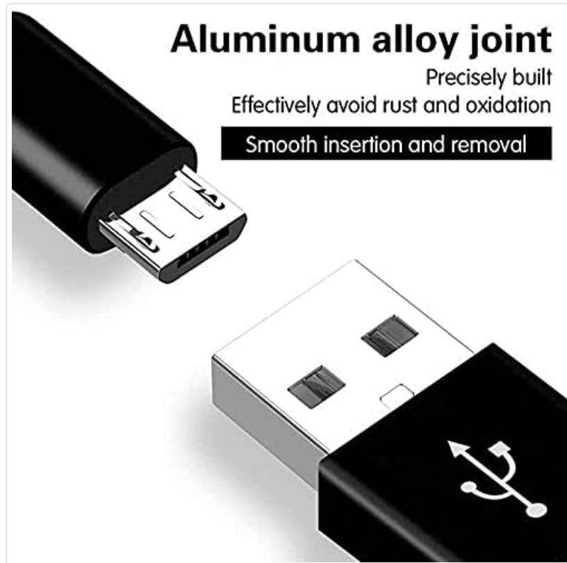
Image 2: Close-up view of the Micro USB connector and the USB-A connector, highlighting the aluminum alloy joints designed for durability and resistance to rust and oxidation. This image illustrates the precise build quality.