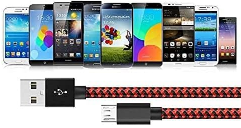
Image 3: Visual representation of the USB-A and Micro USB connectors, illustrating their compact design and the braided cable structure. This image helps in identifying the correct orientation for connection.

Samsung Galaxy J7 J3 S7, S7 Edge, Edge, S4, S3, Samsung Note 5, 4; PS4, Play station 4 pro, PS Vita, Xbox one, Xbox One Slim, Xbox One X; Google Nexus 7 tablets, Motorola Nexus 6, LG Nexus 5, LG Nexus 4; HTC One, M8, M9, M9+, E8, A9, Desire 10 Pro, 828; LG G4, G3, G2, V10, Any device with a Micro charger adapter hub, Micro USB port tablets and phones