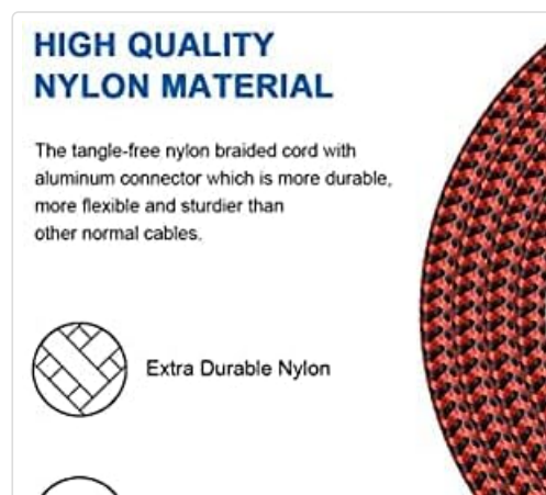
Image 5: Close-up view of the cable's high-quality nylon braided material. This material is designed to be tangle-free, durable, and flexible, offering enhanced longevity compared to standard cables.