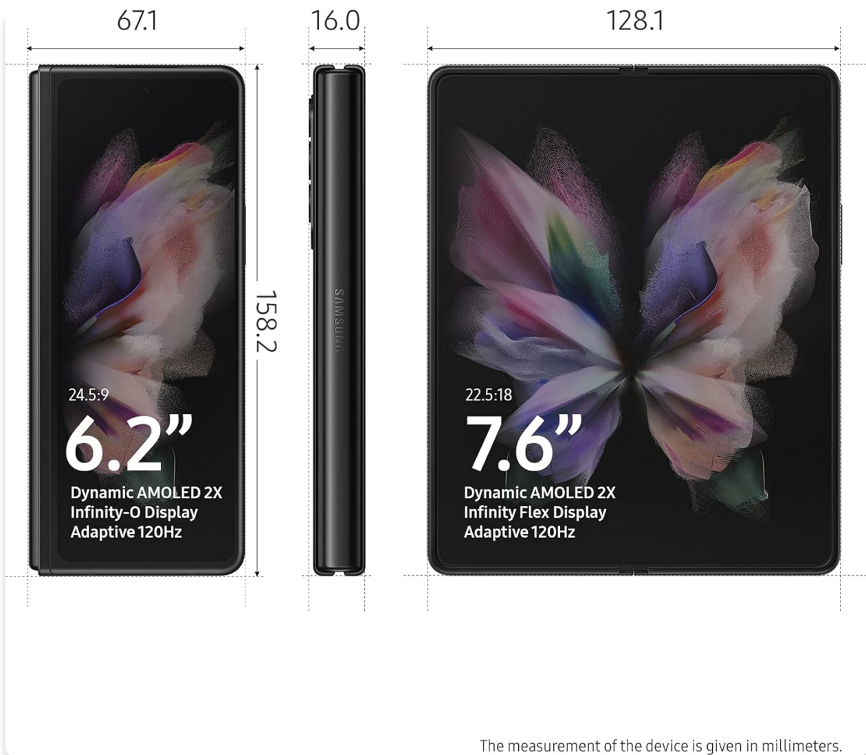
Figure 3: Detailed dimensions of the Galaxy Z Fold 3, highlighting its compact folded form and larger unfolded display.

Video 3: A review demonstrating the folding and unfolding mechanism, and the benefits of having both a phone and tablet in one device (Creator: Alex The REVIEWER, Influencer).