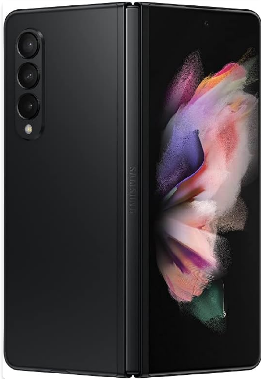
Figure 5: The rear camera array of the Galaxy Z Fold 3 when folded.