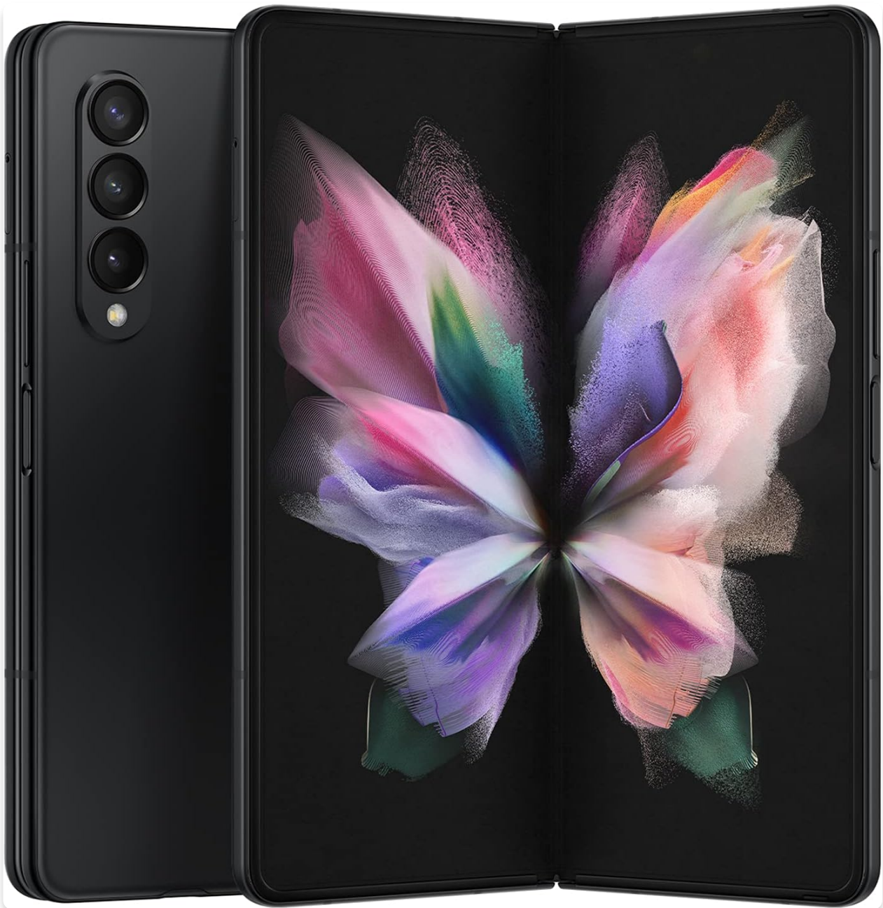
Figure 1: SAMSUNG Galaxy Z Fold 3 5G, showcasing its unique foldable design.