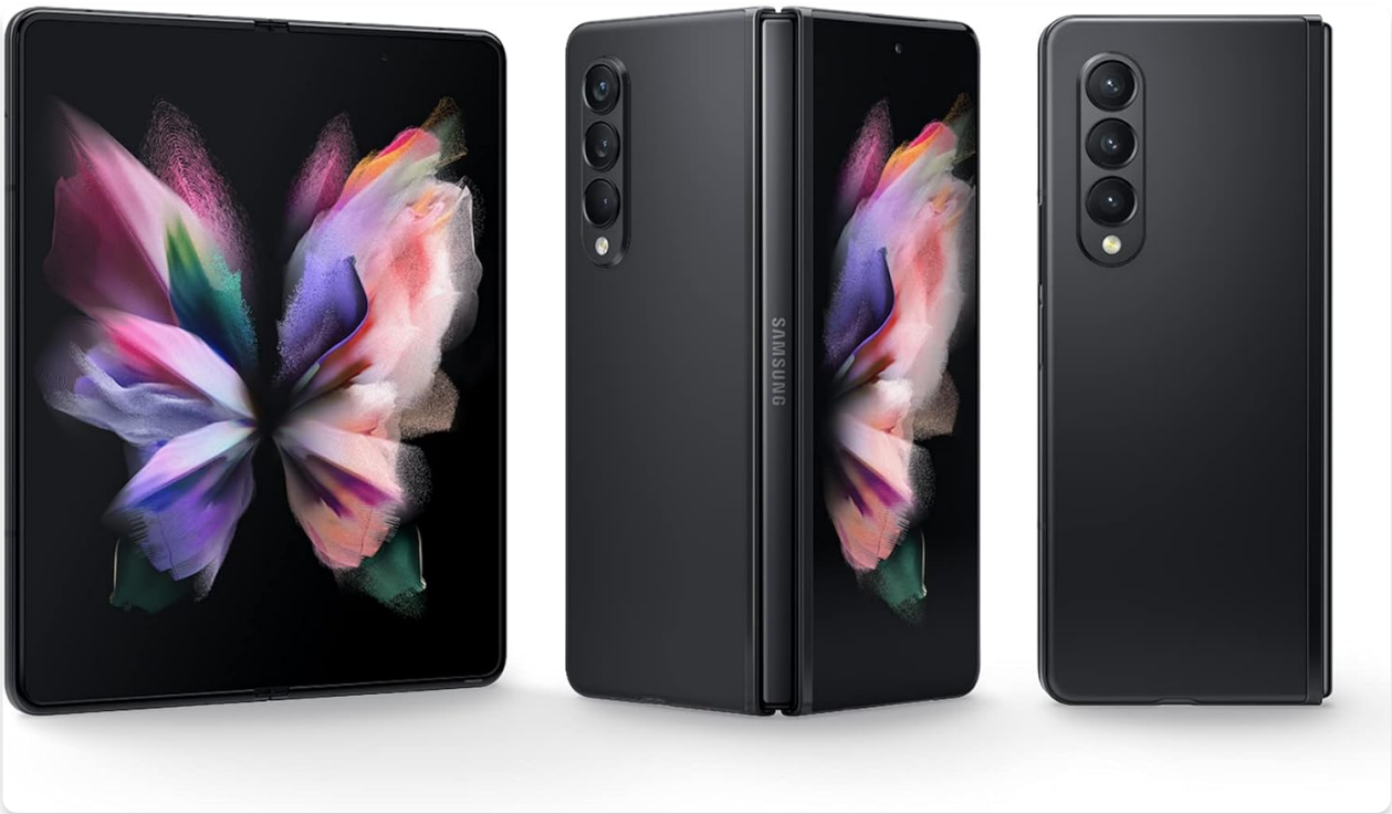
Figure 2: The Galaxy Z Fold 3 in both its folded and unfolded states.

The Galaxy Z Fold 3 is designed for seamless transitions between its folded (phone) and unfolded (tablet) modes. Gently open the device to reveal the expansive main screen. To fold, simply close the device until the two halves meet securely.