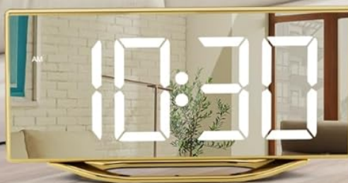
Image: Overview of the Roxicosly Digital Alarm Clock highlighting its features like 8.7" mirror surface, 7-level brightness, 7-level volume, 9-min snooze, dual alarms, 12/24H conversion, memory function, and 2 USB ports.