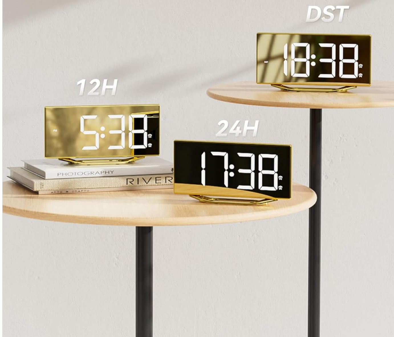
Image: The clock display is shown in 12-hour format (5:38), 24-hour format (17:38), and with DST enabled (18:38).