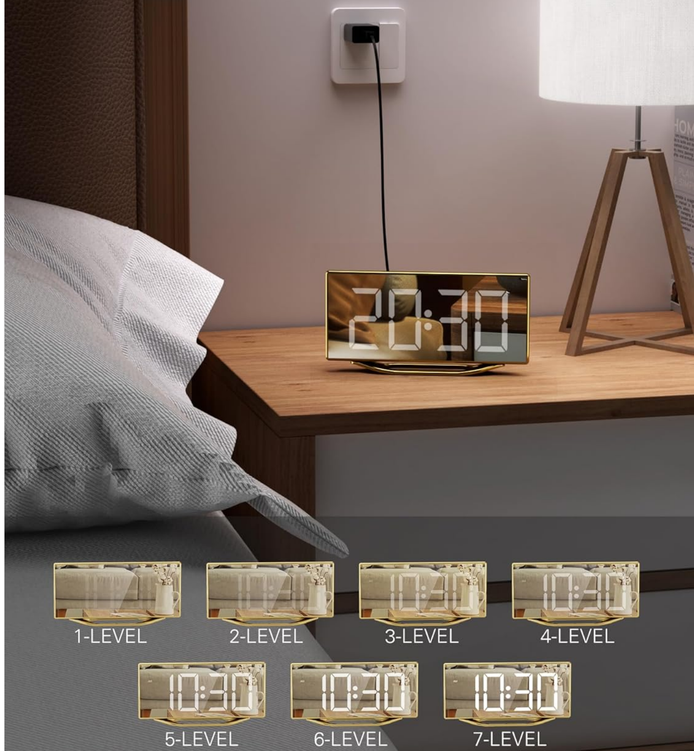
Image: The clock display is shown at various brightness levels, from 1-level (dimmiest) to 7-level (brightest).