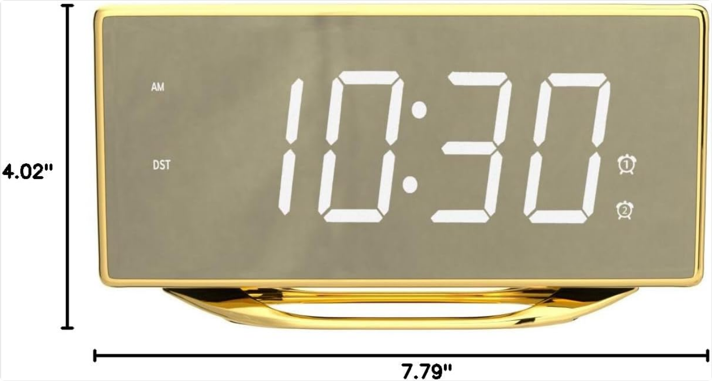
Image: The clock with its dimensions indicated: 7.79 inches width and 4.02 inches height.

This Roxicosly Digital Alarm Clock comes with a 30-day money-back guarantee and an 18-month warranty from the date of purchase. For product support, troubleshooting assistance, or warranty claims, please contact Roxicosly customer service through the retailer's platform or the contact information provided in your purchase documentation.