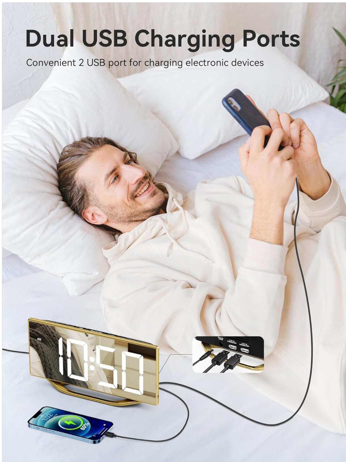
Image: A person in bed using the clock's dual USB ports to charge a smartphone, with an inset showing the two USB ports on the back of the clock.

Convenient 2 USB port for charging electronic devices