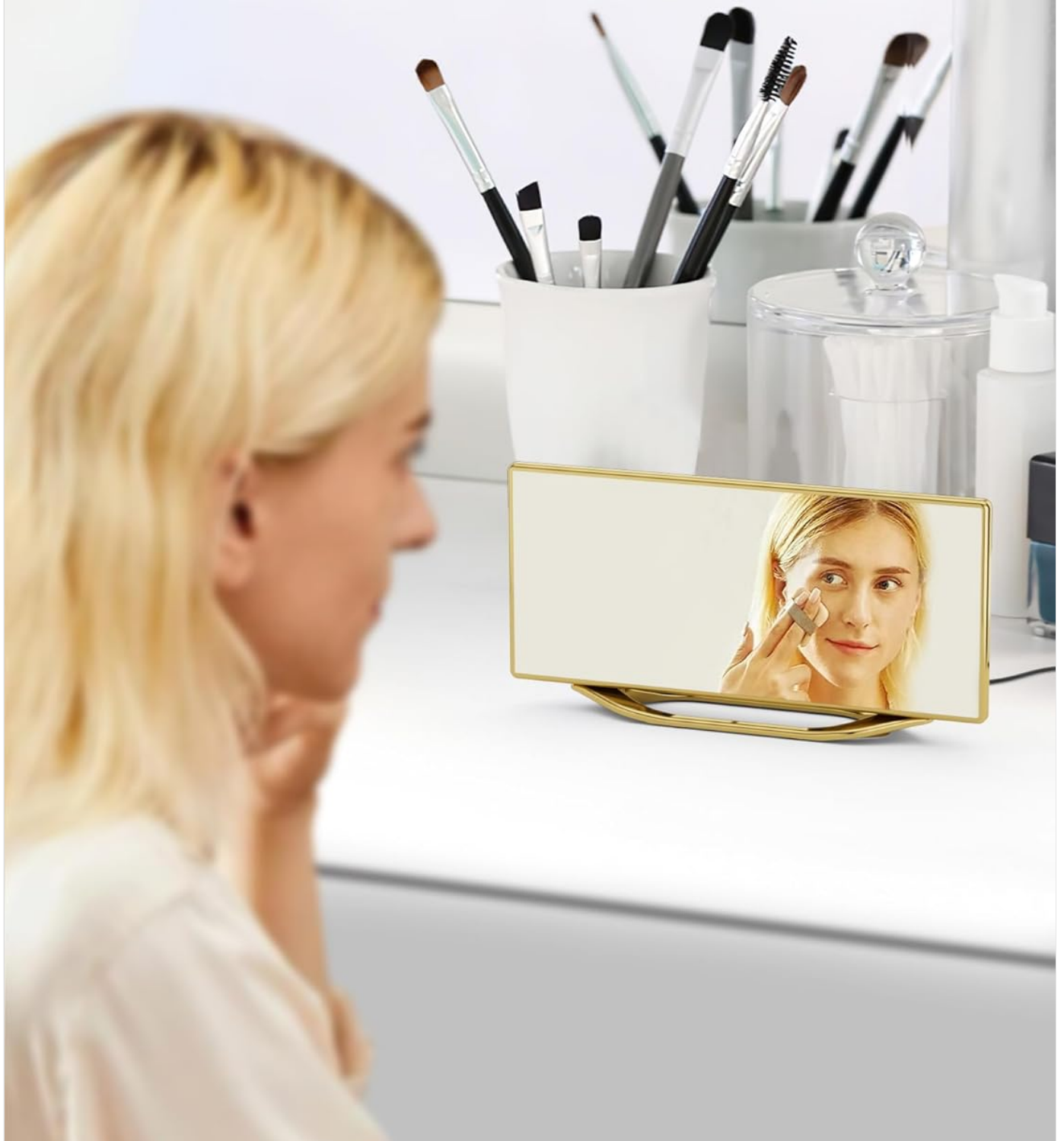
Image: A woman using the clock's clear mirror surface as a makeup mirror, demonstrating its dual functionality.

Can be used as makeup mirror in daily life