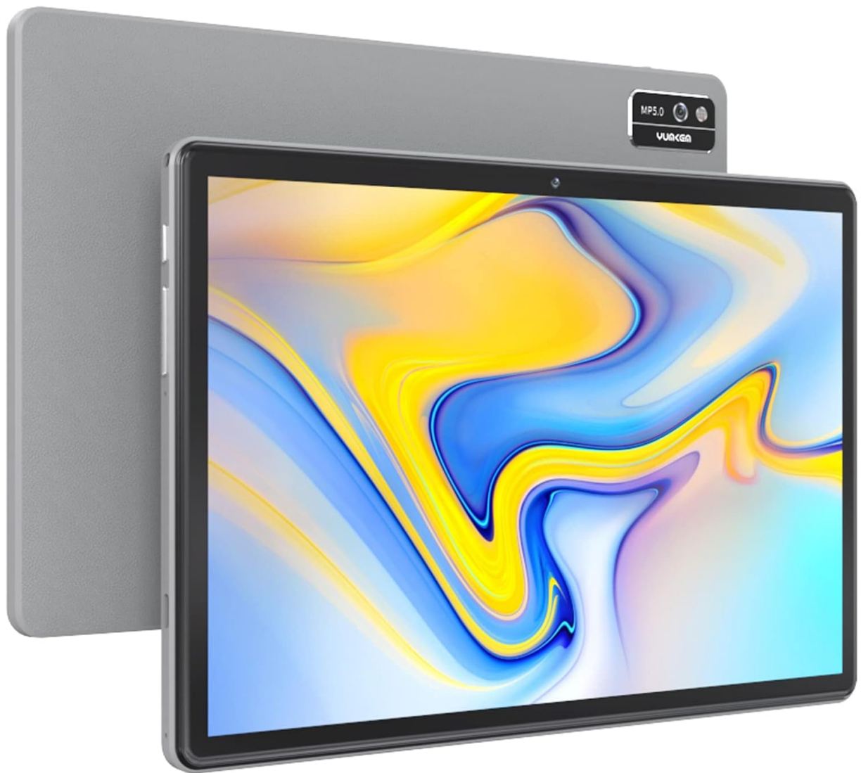
Image: Front and back view of the YUMKEM 10.1 inch Android Tablet.