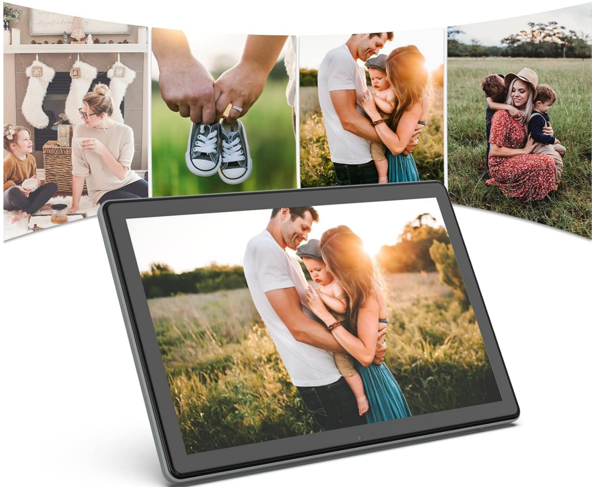
Image: The tablet displaying family photos, illustrating its 64GB internal storage and support for up to 128GB MicroSD card expansion.