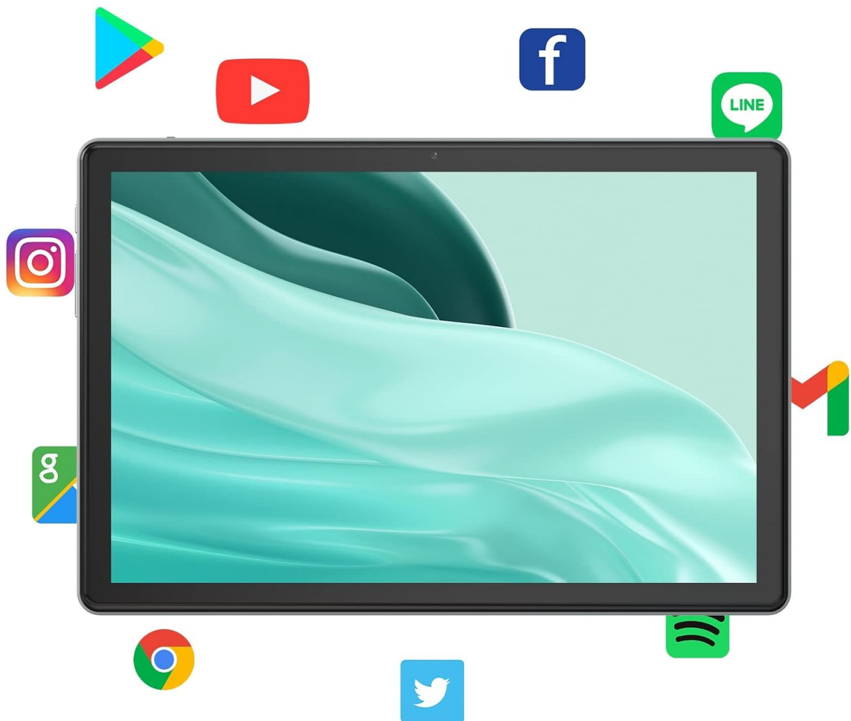
Image: The tablet screen showing various popular app icons, highlighting the Pure Android 11 experience.