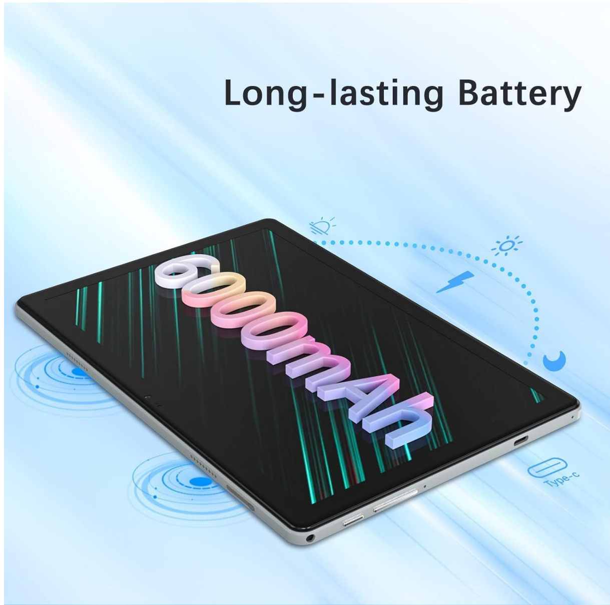
Image: The tablet highlighting its 6000mAh battery capacity and Type-C charging port.

Before first use, fully charge your tablet. Connect the USB Type-C cable to the tablet's charging port and the other end to the power adapter. Plug the adapter into a wall outlet. The battery indicator on the screen will show charging status.