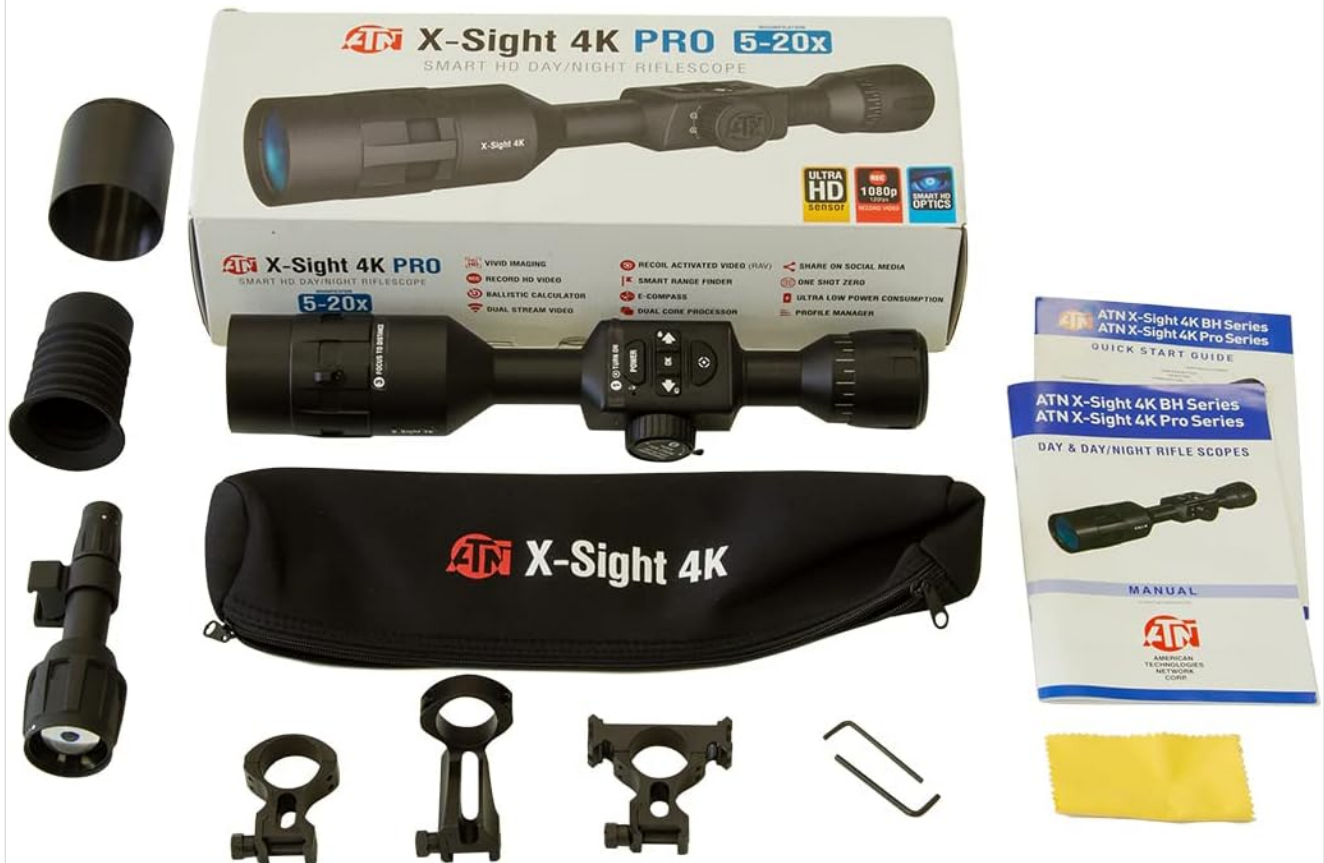
Figure 3.1: Unboxing the ATN X-Sight 4K Pro. The image displays the complete package contents, including the ATN X-Sight 4K Pro rifle scope, its retail box, mounting rings, a soft carrying case, lens cloth, and various other accessories.