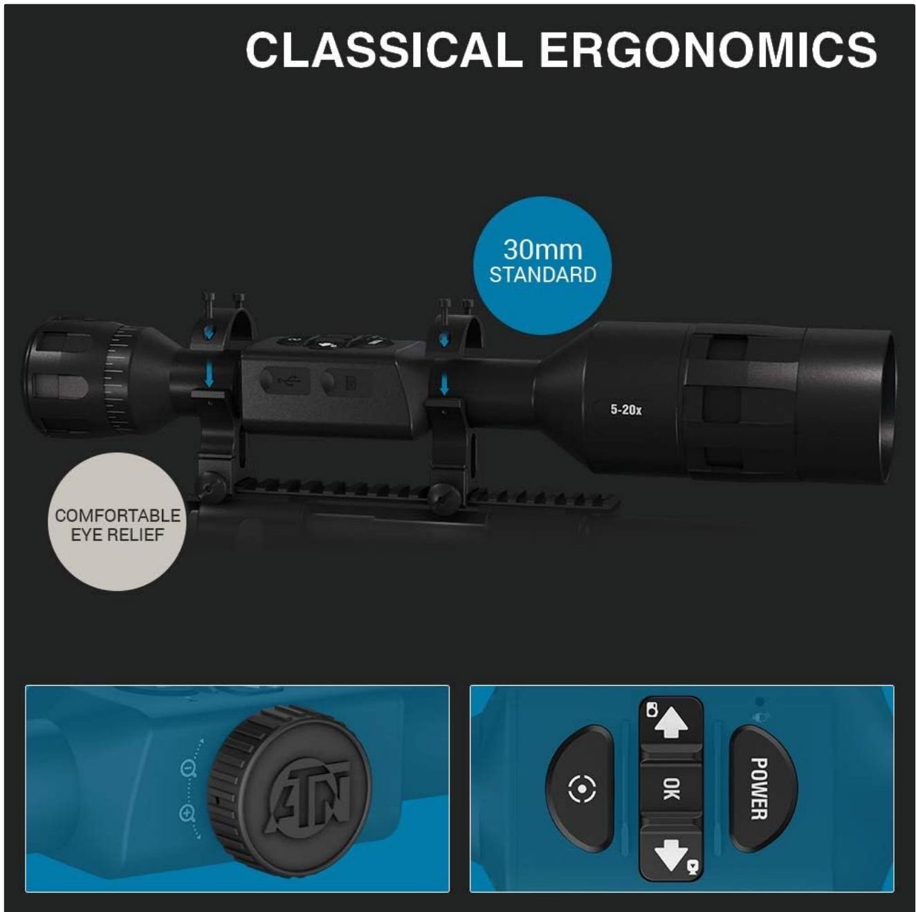
Figure 4.1: Scope mounting and controls. The scope features a 30mm standard tube for easy mounting and accessible control buttons.