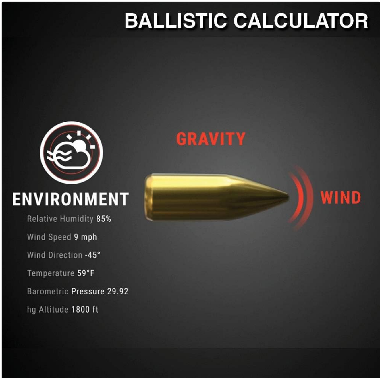
Figure 5.4: Ballistic Calculator interface. This diagram illustrates how the Ballistic Calculator processes environmental data to predict bullet trajectory.