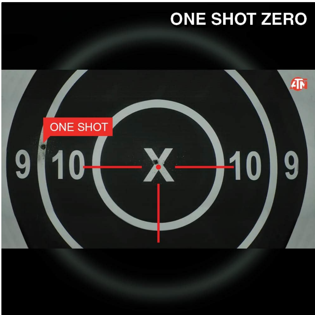
Figure 5.3: One-Shot Zero in action. This image demonstrates how the One Shot Zero feature allows for quick and precise reticle adjustment after a single shot.