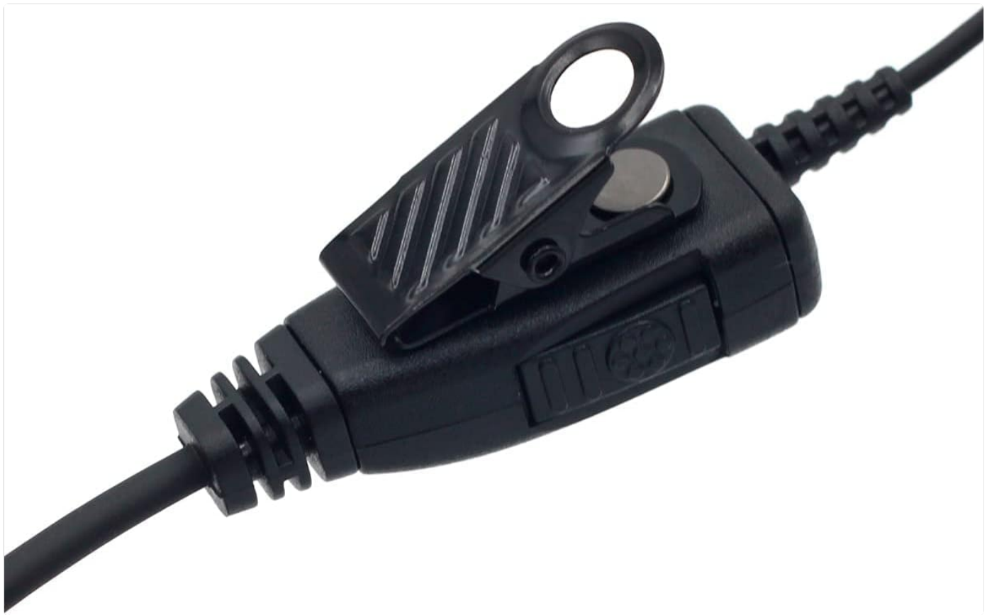
Image: A detailed view of the Push-to-Talk (PTT) unit, showing the integrated microphone and the metal clip for attachment.