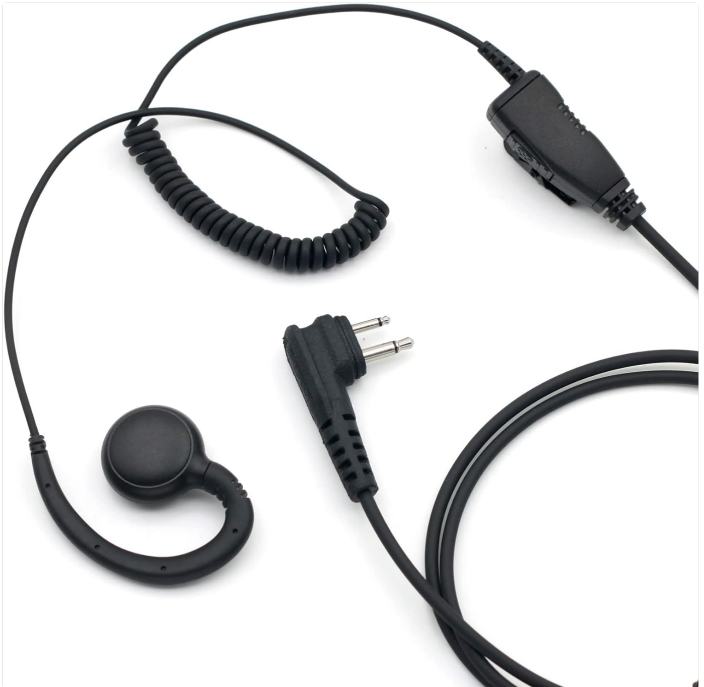
Image: The HKLN4604 earpiece, showing the earhook, coiled cable, PTT unit, and two-pin connector.