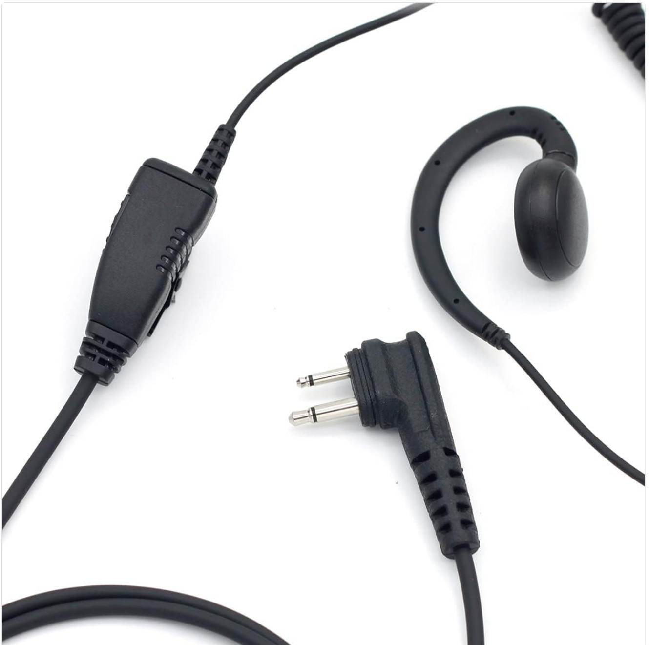
Image: A close-up of the two-pin connector, which plugs into the radio.