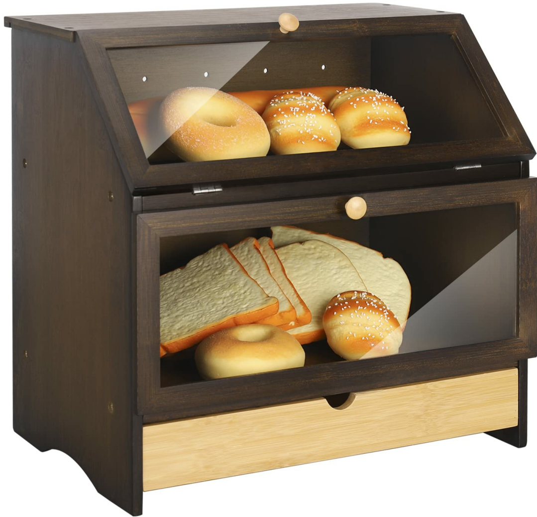
Image: Front view of the assembled HOMEKOKO Large Bamboo Two-Layer Bread Box, showcasing its two clear doors and bottom drawer.