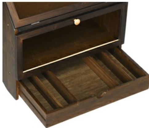
Image: The flexible drawer of the bread box, illustrating its adjustable dividers for versatile storage.