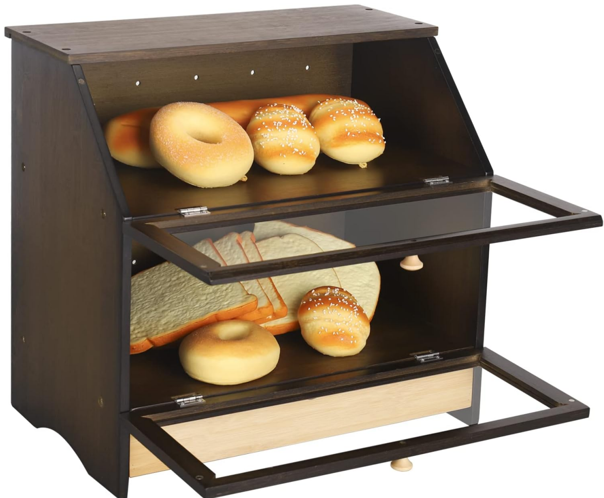
Image: The bread box with both upper and lower doors open, showing the interior compartments ready for use.