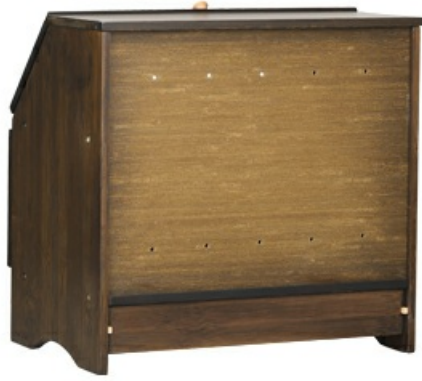
Image: Close-up of the back of the bread box, showing air holes designed to maintain optimal humidity for bread freshness.