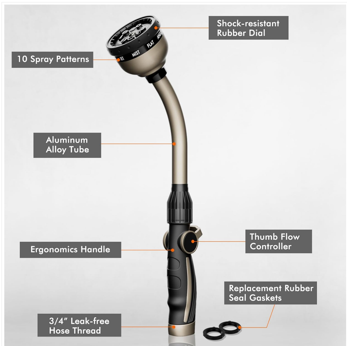
Figure 2: Labeled components of the RESTMO Watering Wand.