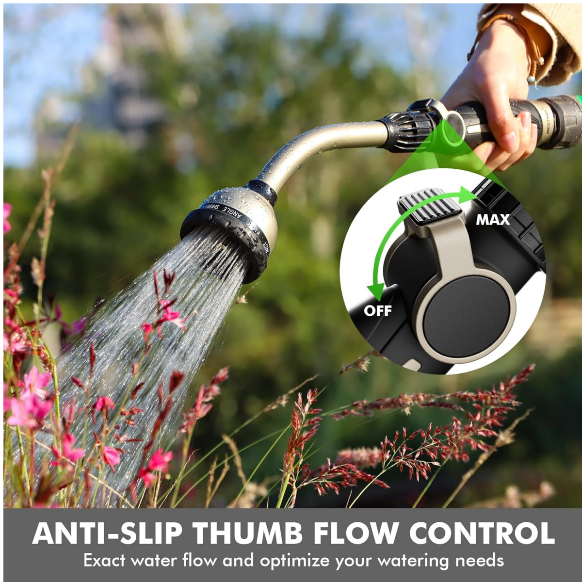
Figure 4: Using the thumb flow control to adjust water pressure.