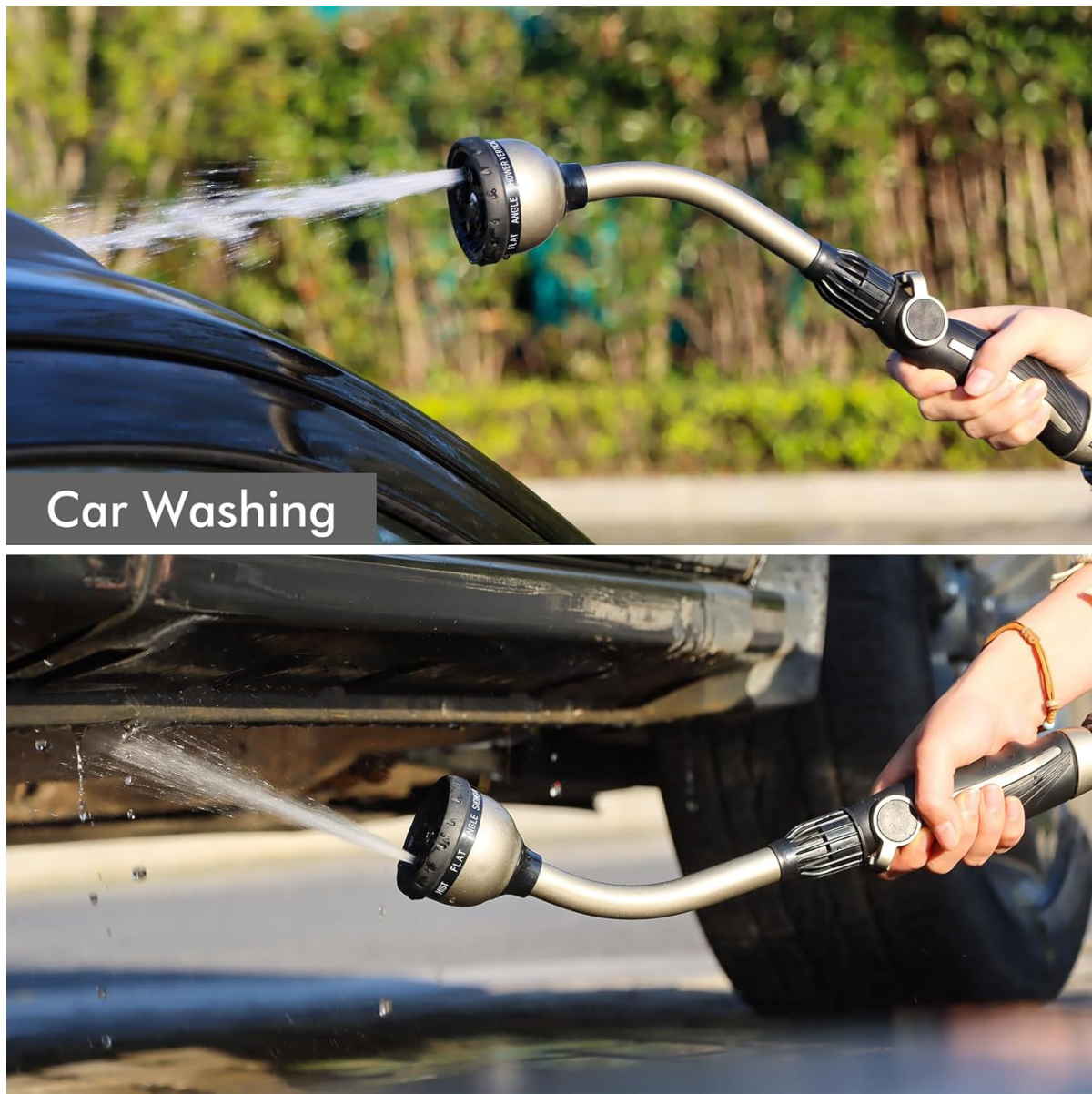
Figure 6: Using the Jet spray pattern for car washing.