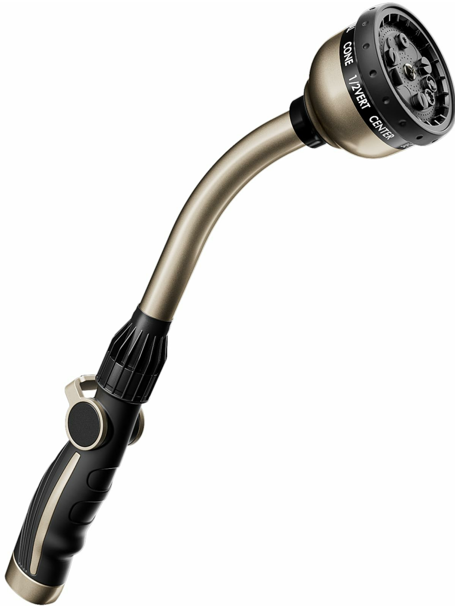
Figure 1: RESTMO Heavy Duty Metal Garden Hose Watering Wand.