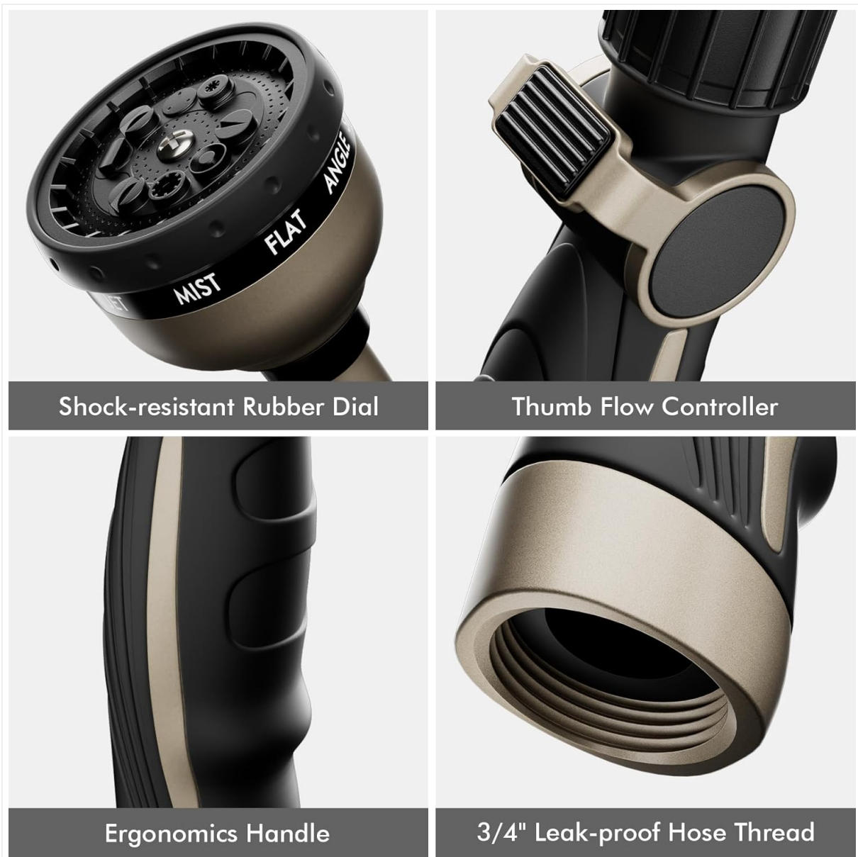
Figure 3: Detailed view of key features: rubber dial, thumb control, ergonomic handle, and hose thread.