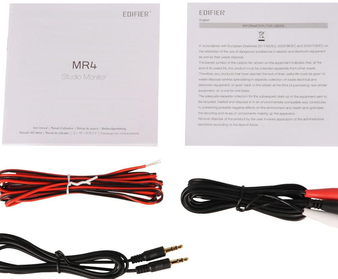
Image: Included accessories for Edifier MR4 speakers: user manual, speaker connection cable, RCA to 3.5mm audio cable, and 3.5mm to 3.5mm audio cable.