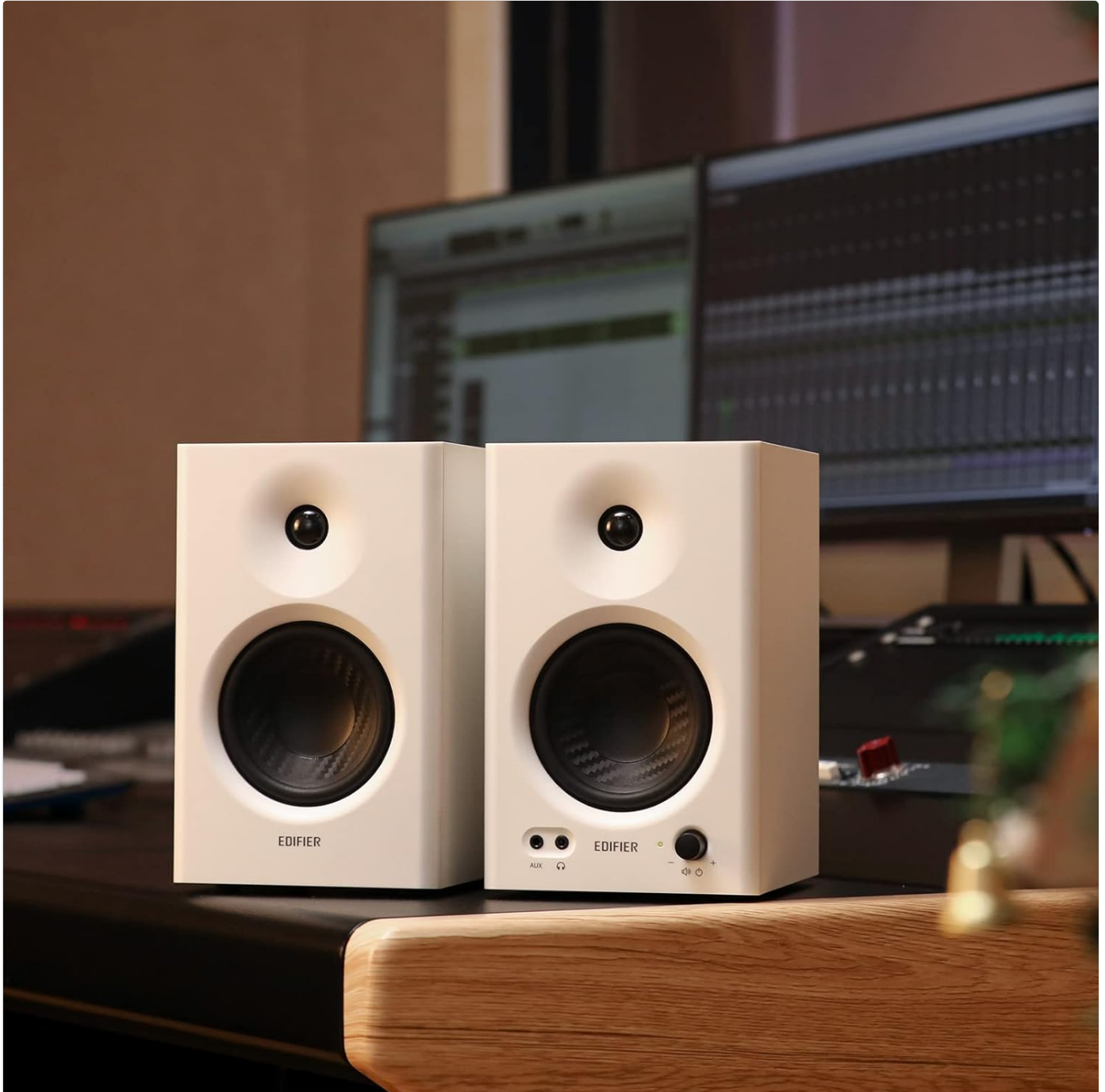
Image: Detailed view of the front panel, highlighting the main control knob and auxiliary input ports.

The multi-function knob on the front of the active speaker controls power and volume. Rotate clockwise to increase volume, counter-clockwise to decrease. Press and hold to power on or off.