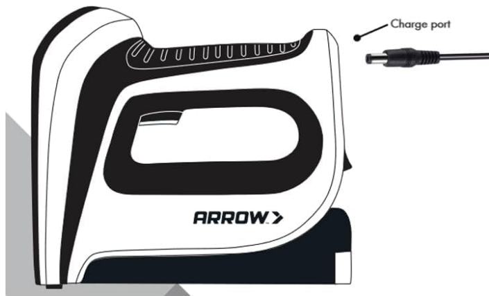
Figure 1: Connecting the adapter to the Arrow T50DCD stapler's charge port.