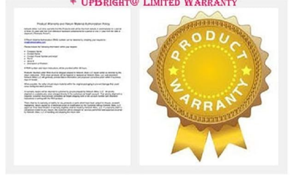
Figure 4: UpBright Limited Warranty Certificate and international plug options.

LIMITED WARRANTY CERTIFICATE + UPBRIGHT® LIMITED WARRANTY