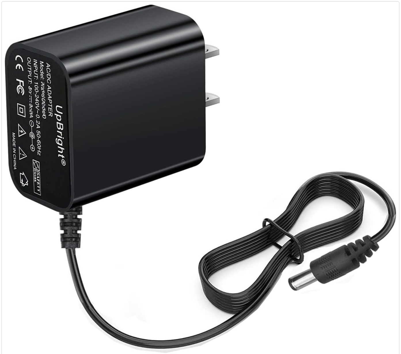
Figure 3: The UpBright 5V AC/DC Adapter ready for use.

Always ensure the stapler is turned off before connecting the charger.