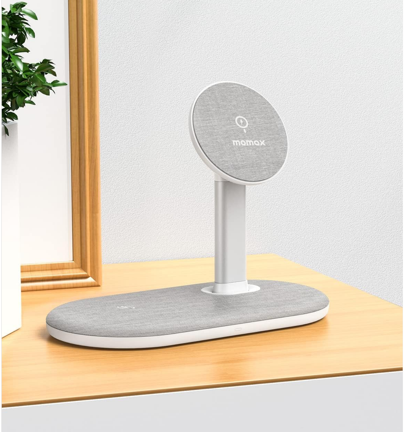
Image: The woven textured surface of the charging stand's base.