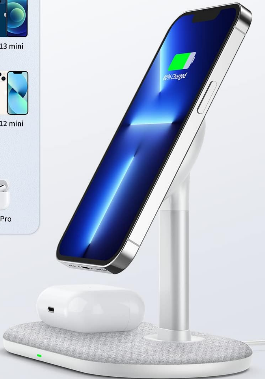
Image: Visual guide to compatible iPhone and AirPods models.