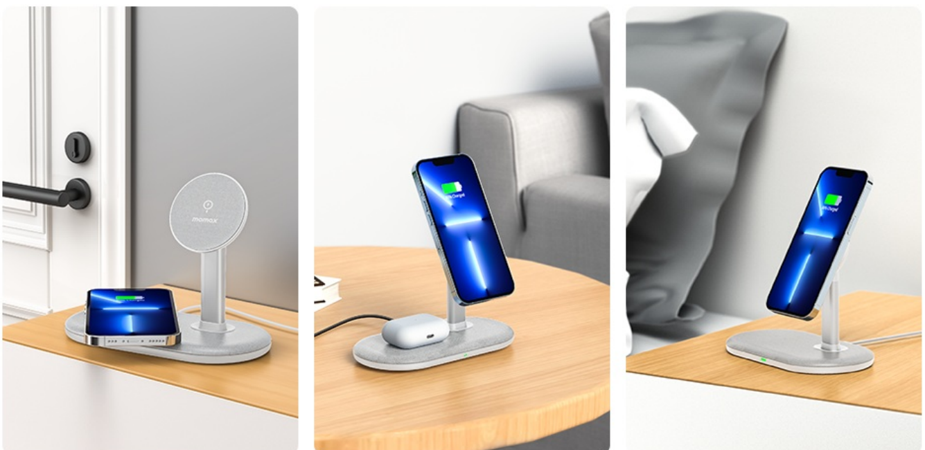
Image: The iPhone positioned in both portrait and landscape modes on the rotatable magnetic charging pad.

Up to 15W fast charging for Qi-enable devices, 7.5W for iPhone