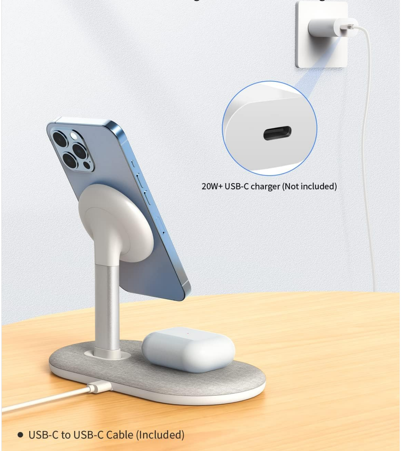
Image: Connect the charging stand to a 20W or higher USB-C power adapter (not included).

Please use a USB-C charger rated at 20W or higher