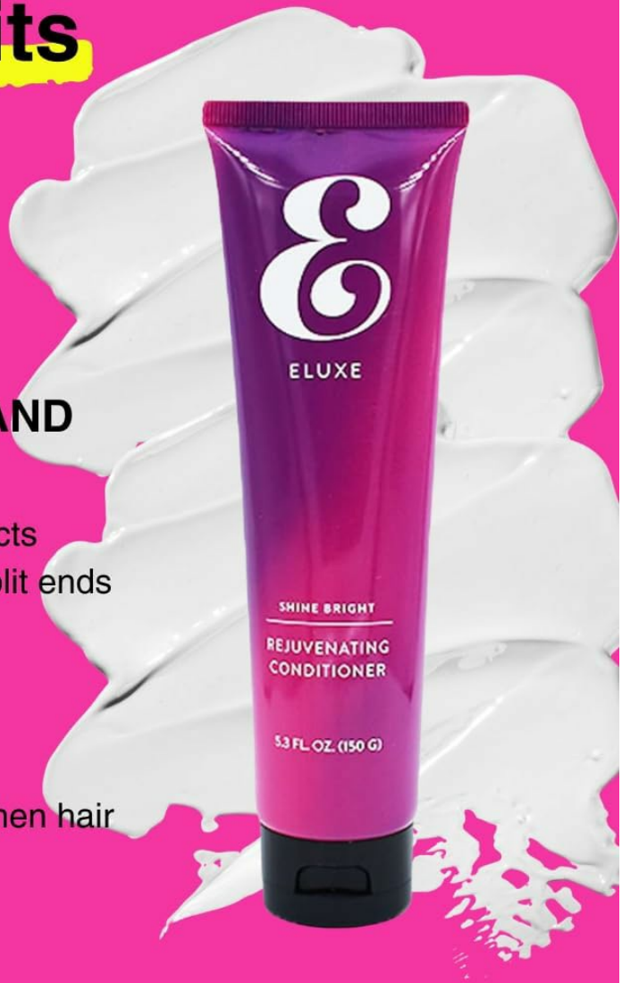
Image: The ELUXE Rejuvenating Conditioner tube, designed for deep conditioning.