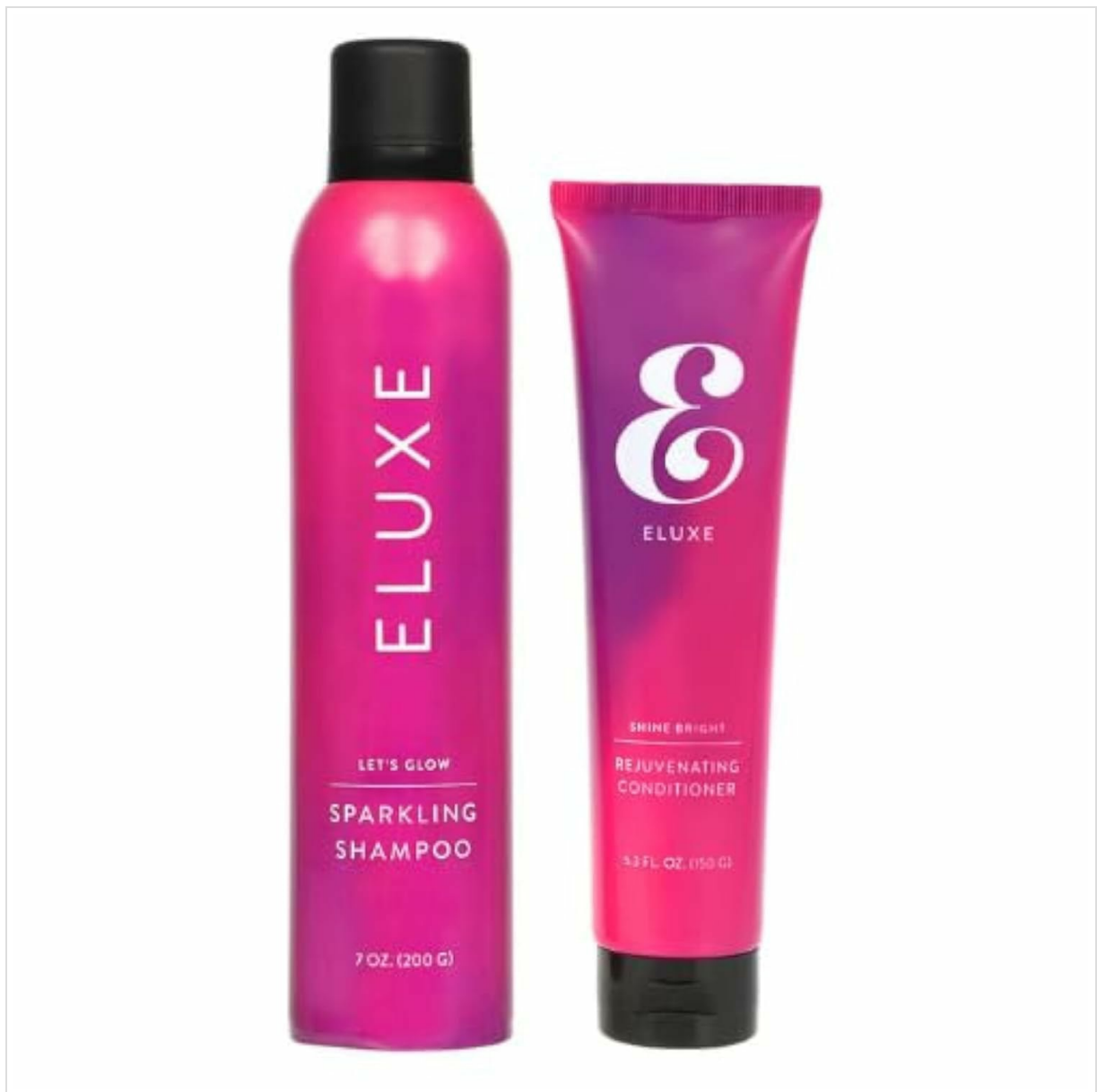
Image: The ELUXE Go Glow Kit featuring the Sparkling Shampoo and Rejuvenating Conditioner bottles.