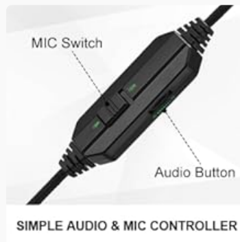
Image: The inline controller with a microphone mute switch and volume scroll wheel for easy audio management.