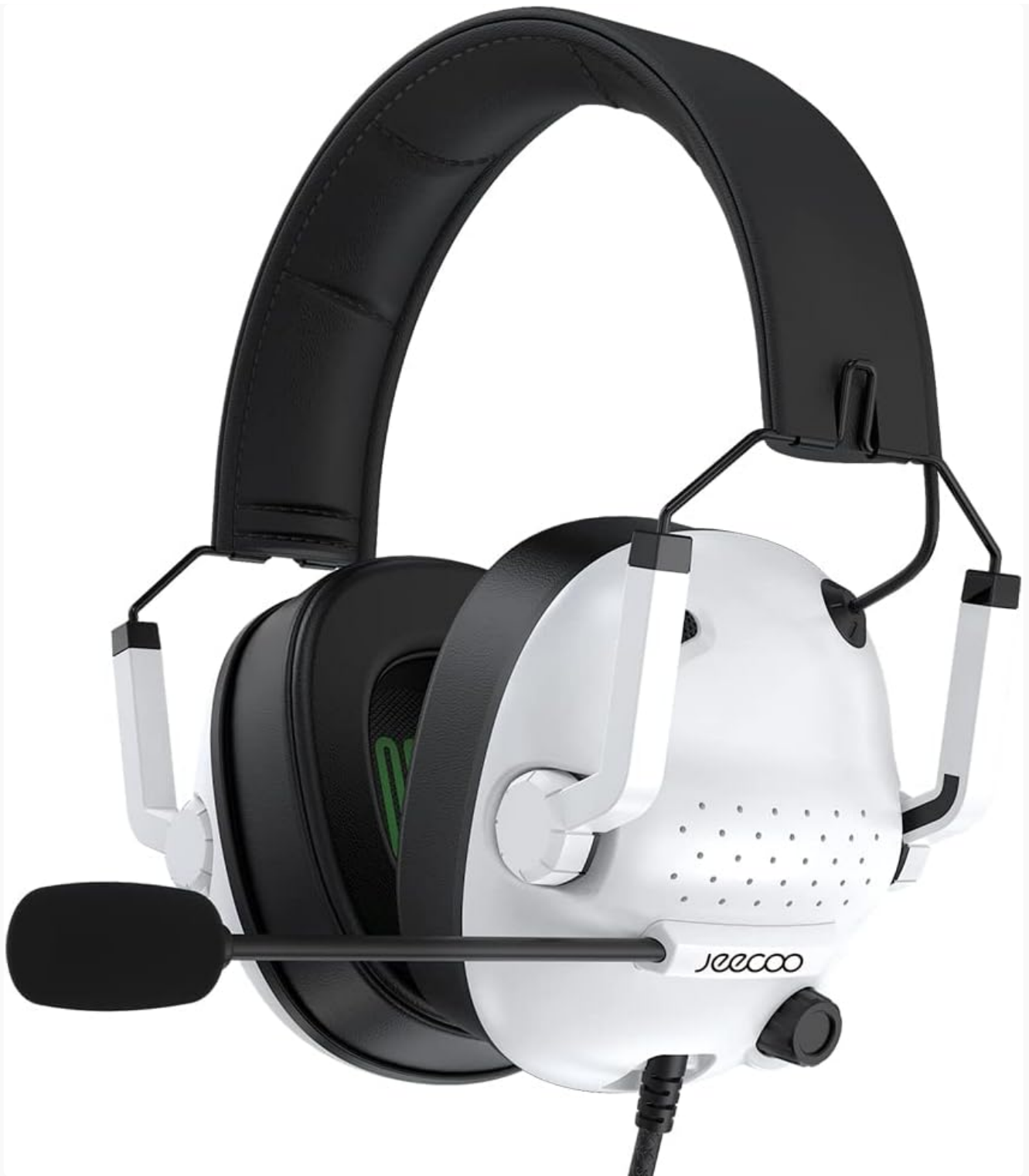
Image: The Jeecoo J50 Gaming Headset, featuring a white and black design with an adjustable microphone.