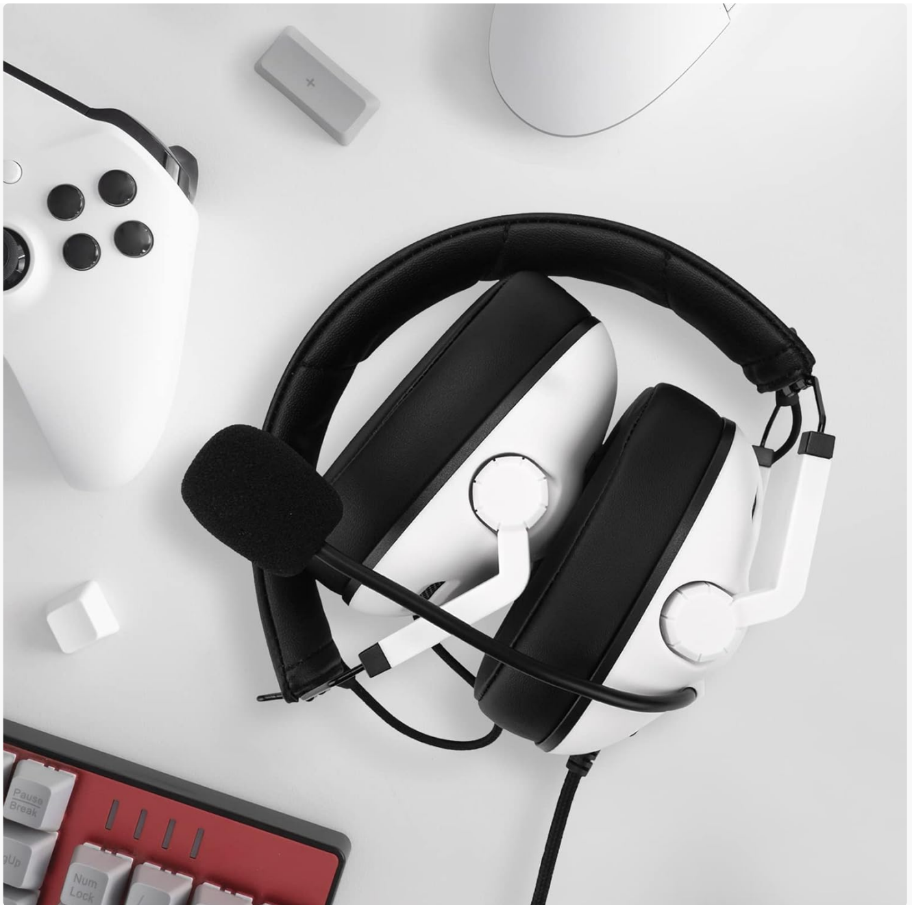
Image: The Jeecoo J50 headset in its folded configuration, demonstrating its space-saving design.