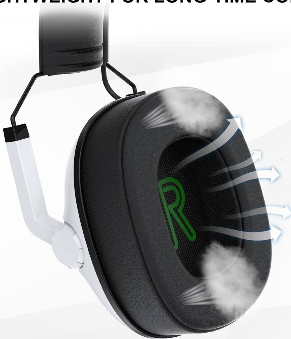
Image: Detail of the J50 headset's ear cups, emphasizing the soft, breathable material for comfort.