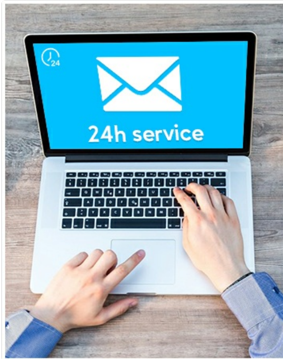
Figure 4: Yakry offers 24-hour customer service for support inquiries.

For the most up-to-date contact information, please visit the official Yakry website or refer to the contact details provided in your product packaging.