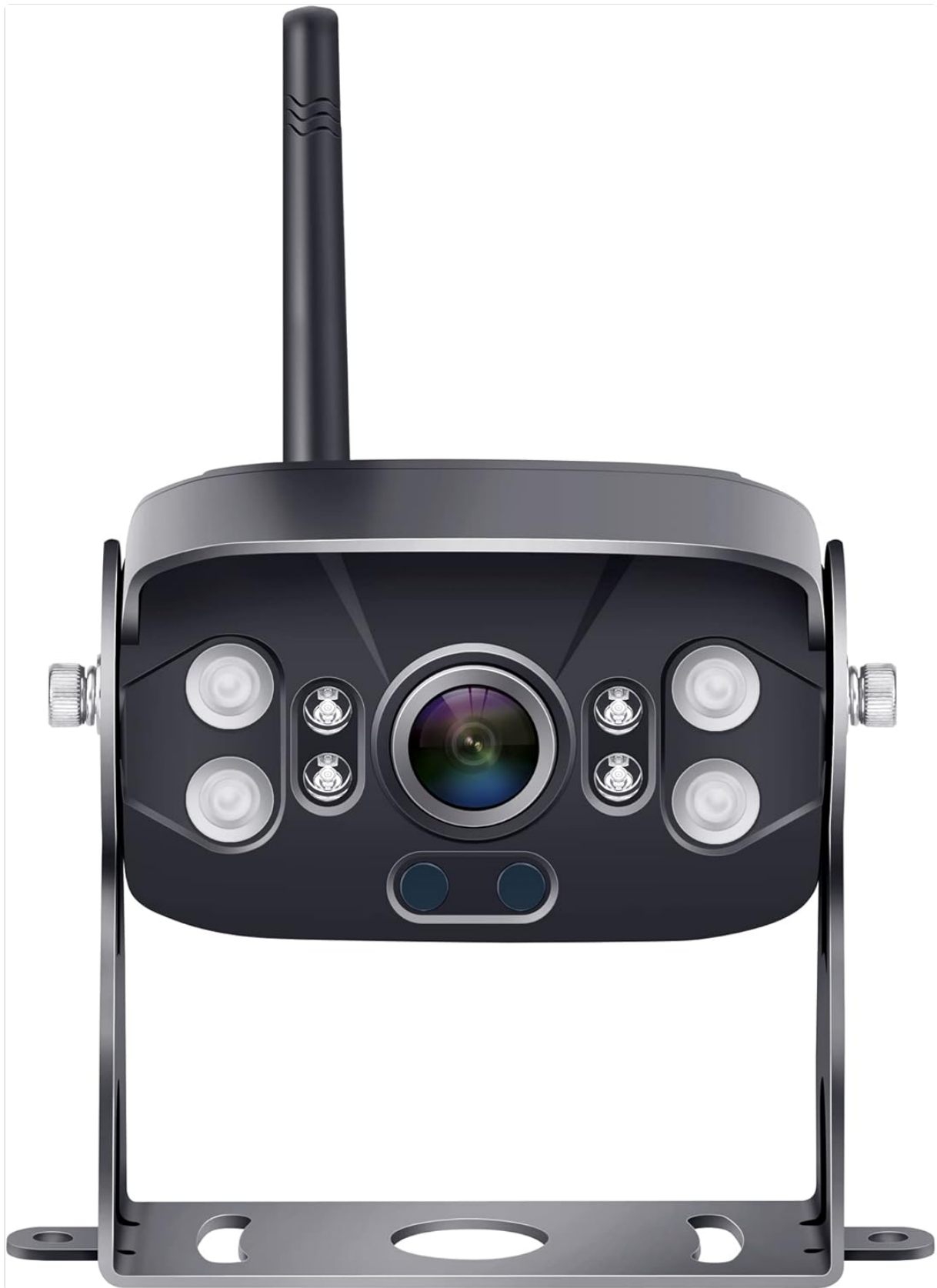
Figure 1: Front view of the Yakry Y95 Digital RV Camera.